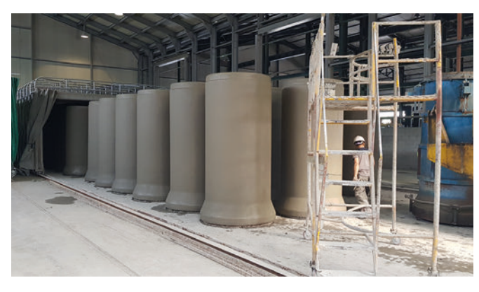
Freshly produced concrete pipes DN 1000 with integrated gasket