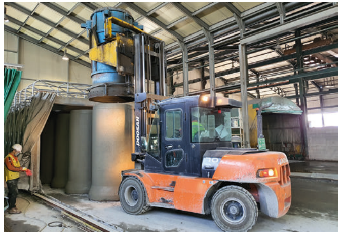
Professional production of concrete pipes DN 1000