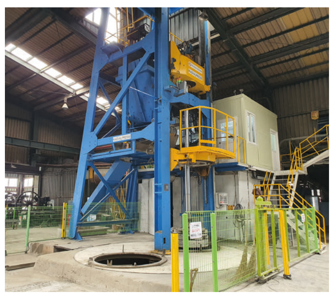
Front view: Radial Press RP 1230 (year of manufacture 1979)

Despite some complications in obtaining visas and entering South Korea due to ongoing Corona restrictions, the upgrades were successfully carried out on both machines, one after the other, within one month. This meant uninterrupted production continued with one Radial Press, while the other RP was being upgraded.