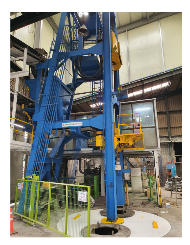
Side view: Radial Press RP 830 (year of manufacture 1992

With the upgraded 2 Radial Presses as well as the new plant in the Hans branch, ShinHeung is now well equipped for the future growth. Like Hans Co., ShinHeung plans also to invest in a base pallet handling and concrete pipe test line including documentation in the future.