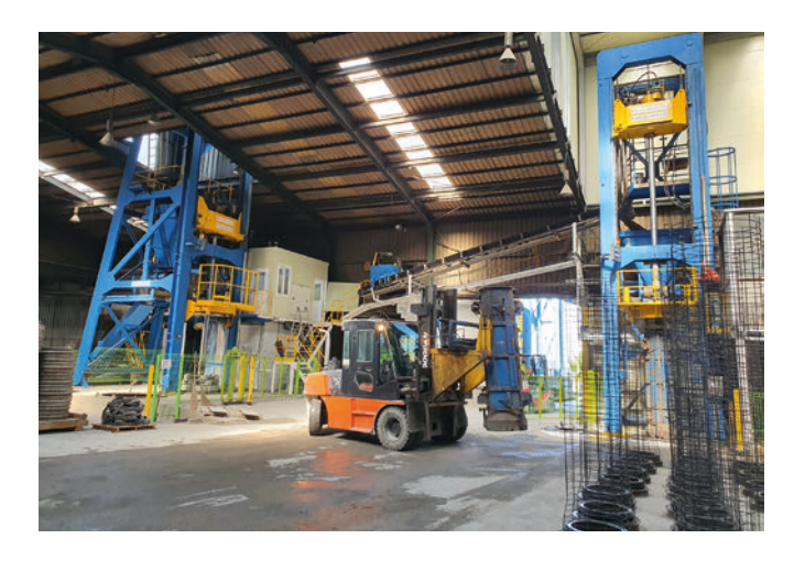
Preparation for concrete pipe production