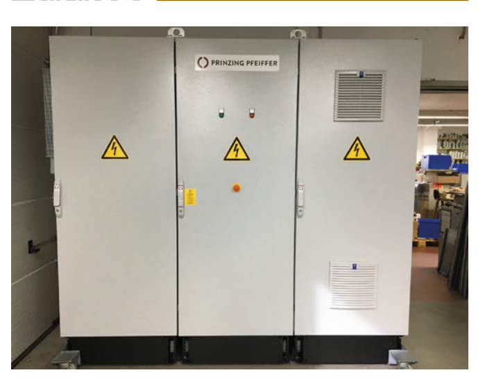
Electrical control system for the Radial Press RP 1230, built in a 3-door control cabinet including the latest worldwide proven Siemens Simatic S7 PLC technology

SHINHEUNG Concrete Co.,Ltd 586, Kongjwipatjwi-ro, Geumgu-myeon, Gimje-si KR - 54338 Jeollabuk-do, South Korea www.sh5000.kr