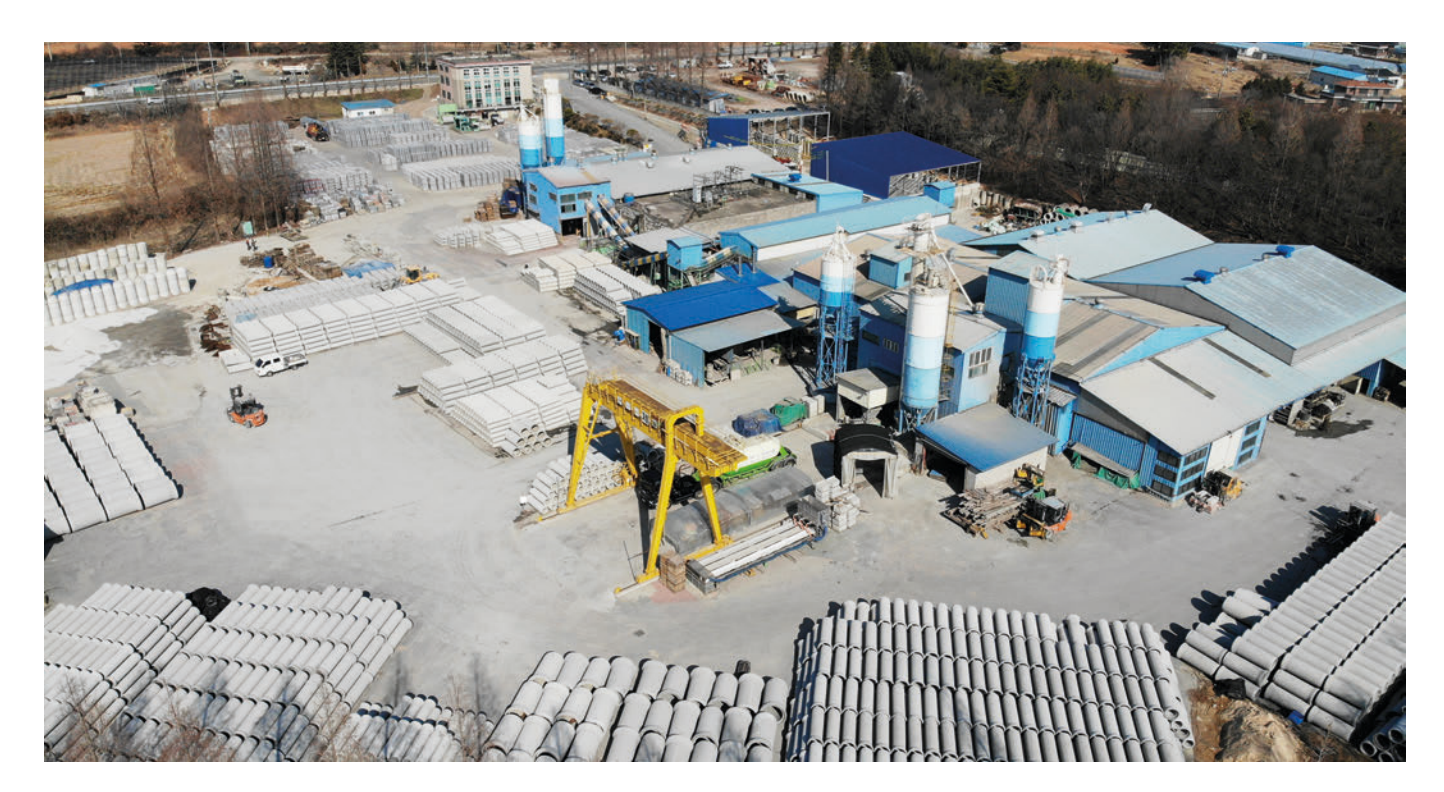
Aerial photograph ShinHeung Concrete factory

The experts from Prinzing Pfeiffer, in close cooperation with the customer, thoroughly examined the factories carefully evaluated collected information and confirmed possibility to upgrade both machines at ShinHeung factory.