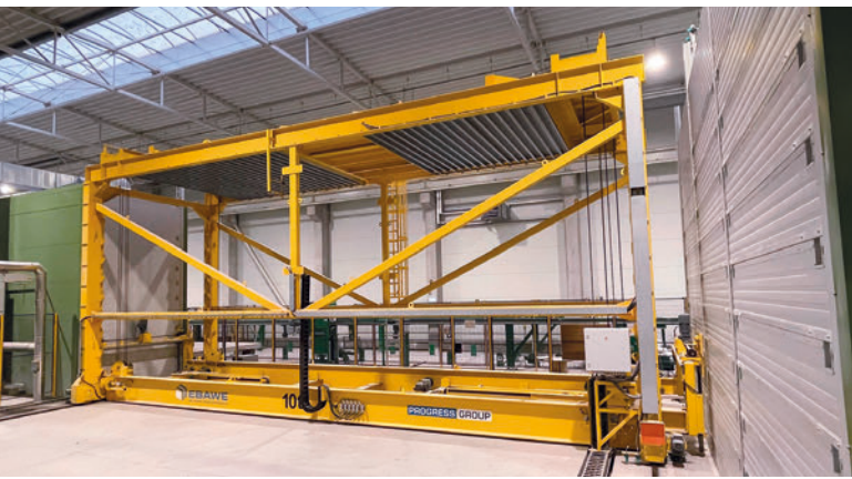
The pallet stacker is stacking the casted elements to the curing rack.