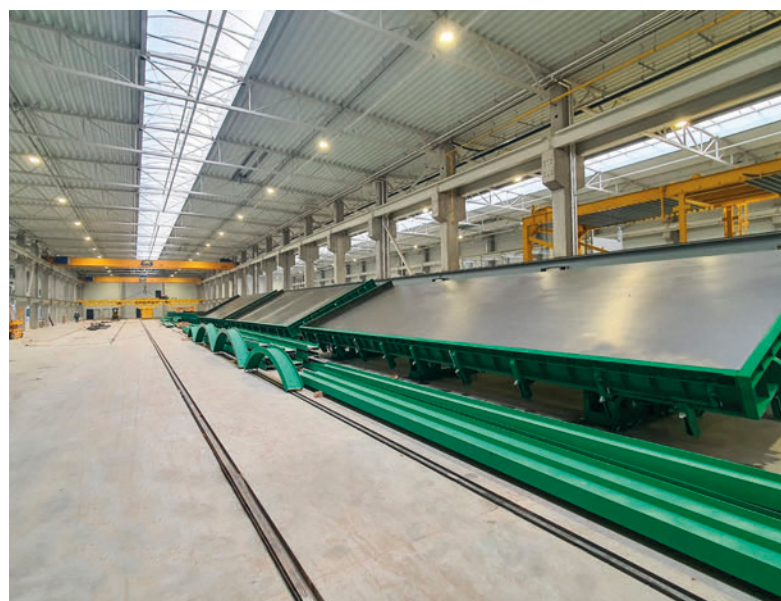
The tilting tables are used for the production of large area flat precast concrete elements, such as solid walls or sandwich walls.