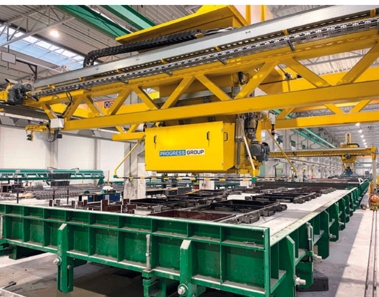
The concrete delivery system flying over the pallets is handling the delivery fully automated and with exact data, thus is saving concrete and time.

over the production lines to cast the fresh concrete uniformly over the shuttered area of the pallet and thus making the production safer, whilst additionally saving space and material. Further machinery for securing a high surface quality is a roughing equipment with lift to treat the concrete element as well as a compacting equipment, which is basically shaking the pallet to spread the concrete evenly. To smooth the fresh concrete surface even more before curing a power trowel got installed in order to achieve the best quality with no need of manual labour. The pallet lifting equipment includes a rail-mounted pallet stacker, which is a lifting device that receives the pallets containing the freshly casted elements from the production line. They get stored in a curing rack system with three side by side curing racks and a single rack nearby with a heating system. After removing the element from the pal-