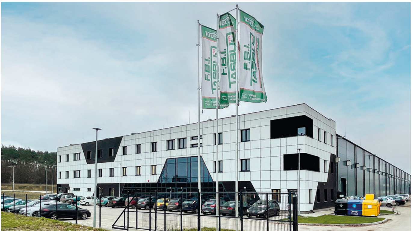
F.B.I. Tasbud equips its precast plant with automated machinery and software from Progress Group.

„The most important features of the automated systems are error-free production, easy handling and the longevity of the machines“, Tasbud's General Manager Piotr Krakowski explains the further investment in moulds and tilting tables and adds: „Progress is a manufacturer that is significantly involved from the planning stage through the design of production lines, which is extremely important in the case of the dynamically developing Polish prefabrication market. Investors have to analyze various possibilities and learn all the faces of the solutions that can be used in the production infrastructure.“