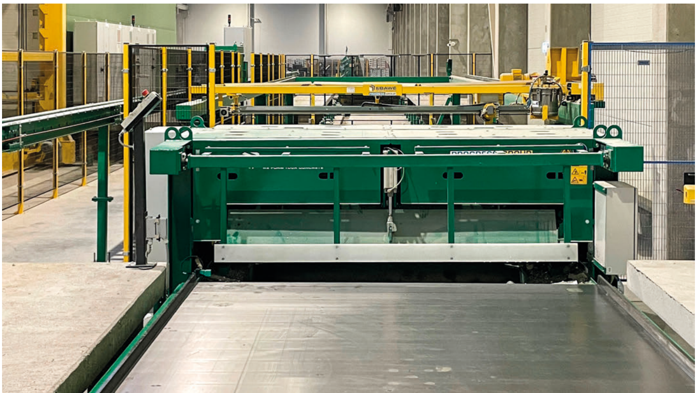
Before entering the system again, the pallets are being cleaned automatically.

To complete the production a multifunctional reinforcement machine, the Pluristar, has been installed to straighten, cut, and bend the needed steel for reinforcing the elements. It can process wire diameters of 6 - 16 mm directly from coil. The heart of the Pluristar is the combined straightening system consisting of a roller straightening unit and a rotor