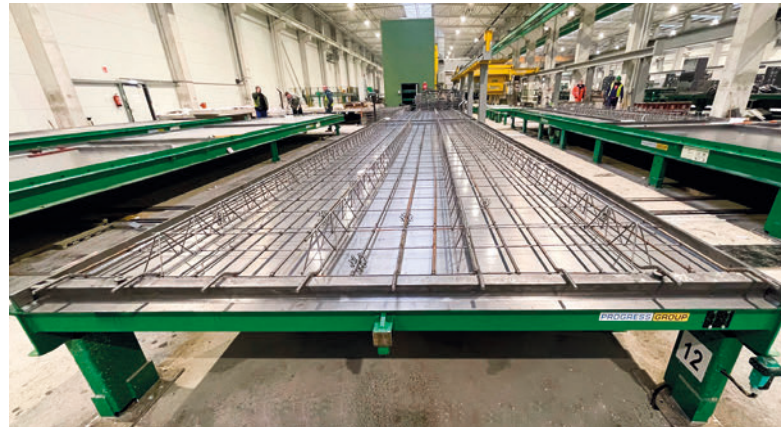
The reinforcement for the elements is being produced automated and thus exactly as planned.