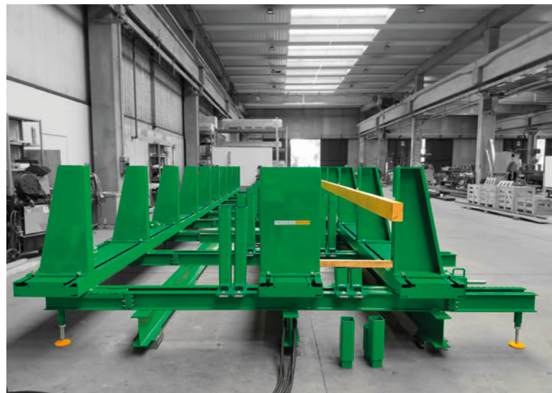
The double moulds are being used for producing the best-selling products - the columns and are 14 meters long.

straightening unit. This unique combination allows the flexible manufacture of stirrups, straight rebars, and rebars with large bends using just a single machine. The Pluristar is also equipped with a 3D bending system allowing not only 2-dimensional, but also 3-dimensional stirrups to be produced. "The Pluristar is optimally matched to the needs of the reinforcement workshop for the elements planned for production.", says Mr. Krakowski.