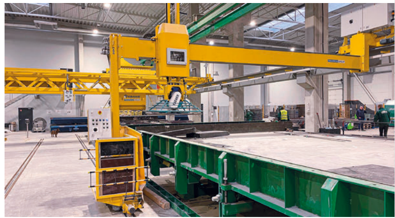
After the curing of the concrete surface the next phase is fine smoothing with a power trowel.

let, the release agent spraying device cleans the pallet - fully automated.