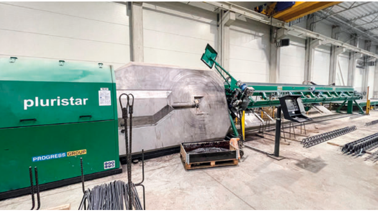
The multifunctioning machinery Pluristar can straighten, cut and bend the needed reinforcement steel directly from coil.