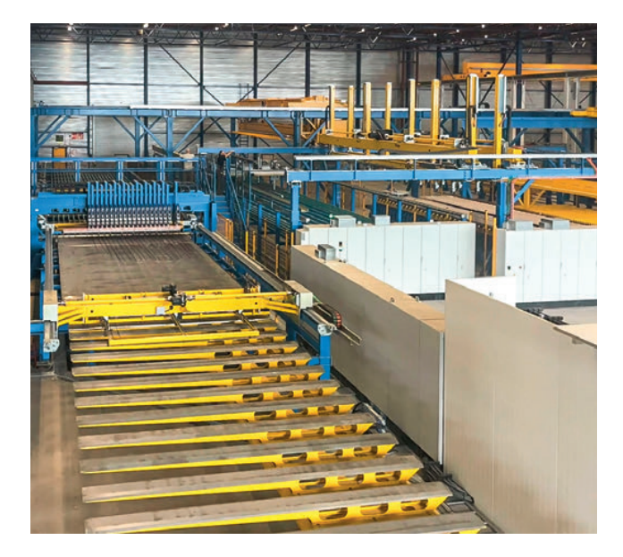
The high output of the M-System Evolution mesh welding plant is especially impressive

The need for efficient, sustainable construction methods is great as well in the Netherlands and is becoming increasingly more urgent. The precast industry is expecting high growth. Precast concrete elements are already widely utilised in construction work in the Netherlands due to the great housing shortage. The time saved, and thus the CO<sub>2</sub> emissions saved on a construction site itself, as well as the long service life of precast concrete buildings will make this market increasingly important in the future. GP Wapening is responding to this by increasing the size of its machine pool and embracing sophisticated innovation in automation and software solutions for cutting-edge production. The company began in a hall of 3,000 m² in a small neighbouring village of its current headquarters. Because of the new mesh welding line, a new hall of 9,500 m<sup>2</sup> was also built at the same time, thus investing in the future and planned growth. According to their own assertion, they are well positioned to supply reinforcement cages to precast factories in the Netherlands and Belgium, and should the case arise, of course, to Germany as well.