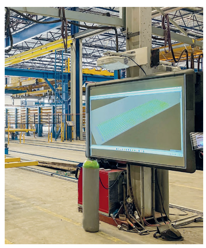
Plans can be visualised in 3D models with the appropriate software solutions, thus facilitating accurate results

The decision to invest in the M-System Power Mesh was based on the fact, that the machine could deliver the most production amount in square metres per machine area. It was also a question of generating the greatest volume of output