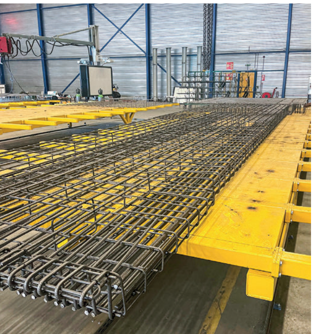
Recesses and bends exactly according to plan are no longer a problem with the innovative automation solutions

been projected to the welder on a screen or beamer as a 3D representation. What the end product looks like is thus clearly visible according to design planning. This makes the work easier and reduces the error rate - which additionally supports paperless, and thus even more sustainable, production. The e<sup>rp</sup>bos system thus helps organise production correctly and is supported by the "profit" software, which takes over production planning and sends all data directly and cleanly to the MSR straightening, cutting and bending machine as well as the EBA automatic stirrup bending machines. This happens at exactly the right moment thanks to the good interaction of software and automated machines, so that the add-on material is ready at its assembly station even when the M-System is engaged in production. Everything can be planned, produced and assembled as needed with this innovative software and the automated machines.