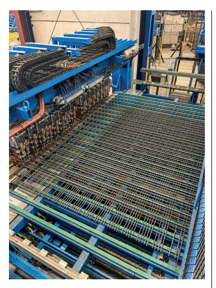
GP Wapening can produce flawless special cages rapidly using the maximum number of welding heads and additional innovative bending solution

with high quality and little waste. Especially when current steel prices are taken into consideration, production from a coil, as is standard with all Progress machines, is the more sustainable solution because it minimises waste. The M-System PowerMesh with 20 welding heads is the ideal solution for generating high output with special curved cages. It boasts a sophisticated bending solution featuring a combination of single and side benders for positioning mesh elements and then mounting a corresponding 2D top mesh on top. The maximum is 4 tonnes per hour. The system works in three shifts, two during the day when cages are produced and a night shift when it is the turn of flat meshes and more simple curved cages. Cages and meshes for solid walls can be manufactured, some with recesses, but also balcony cages and the like for supports in the range of 6 to 16 mm wire diameter.