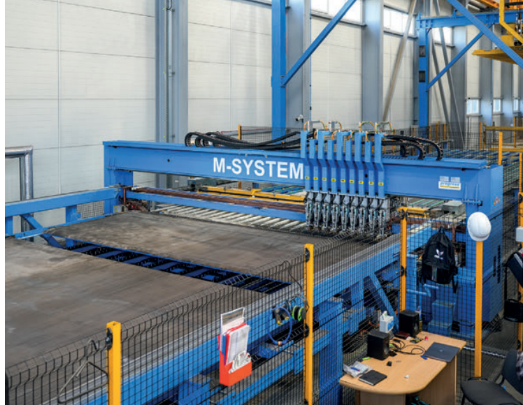
The M-System mesh welding plant is providing a high output with very high flexibility and automation and is producing directly from coil.

ebos is part of the digital platform and together with e<sup>rp</sup>bos<sup>®</sup>, guarantees a seamless vertical integration of all the business and production processes of Viastein Bayer across the different plants.