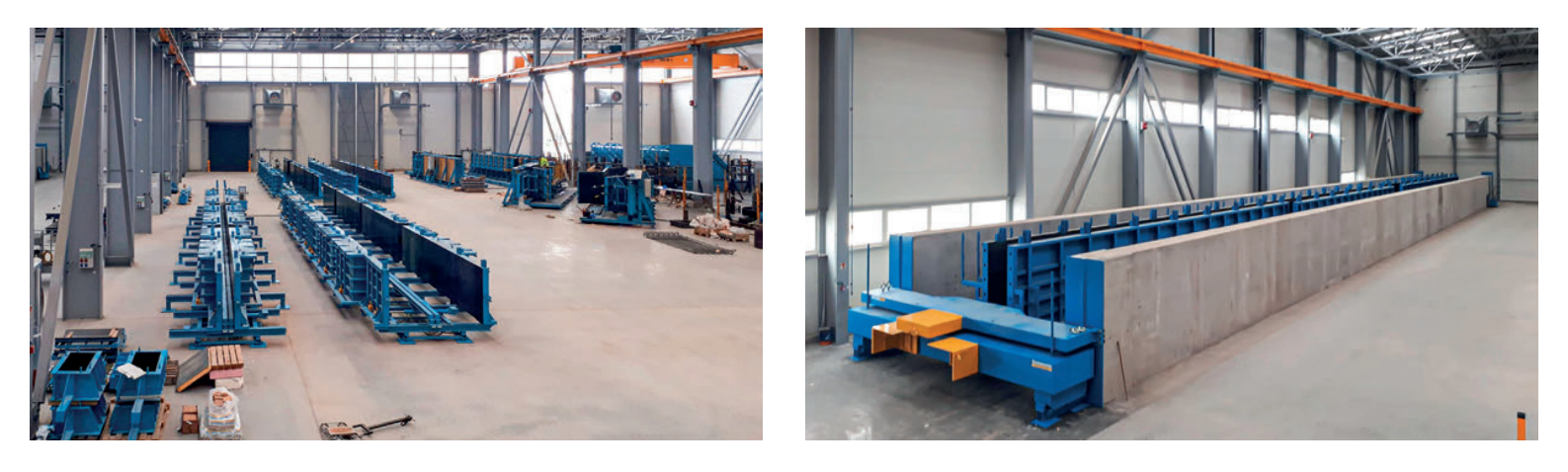
Viastein Kft. hall with the moulds for the production of columns, beams and stairs

The e<sup>m</sup>bos solution, which was especially developed for the precast concrete industry, functions as a higher-level ERP system and provides specific industry functions in order to support the business processes. From sales, project management, engineering to production, assembly planning, logistics and supply chain management, everything is perfectly integrated and managed in this central system. The complete project life cycles are constantly updated, making it easy to keep costs and time under control at all times. Real-time decisions can be made based on production, capacity, and costs.