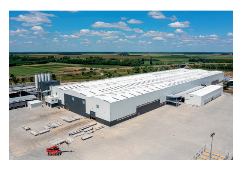
Viastein Kft belongs to the Bayer Construct group and is one of the biggest precast plants built in Hungary.

A precast plant as modern and automated as this one consists of many innovative machines working seamlessly together. In this case, the industry front runner chose another leader in its field for supplying the machinery and the relevant technology, the Progress Group. The company group