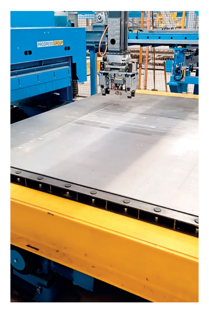
The marker for the placement of the shutters are made precisely with the help of the integrated software and fine lasers.

The production of precast elements consists of three essential parts: the rebar and mesh production, the software system and of course the carousel plant technology from Ebawe Anlagentechnik in which the pallet is circulating with the precast element and transporting it to the various steps of produc-