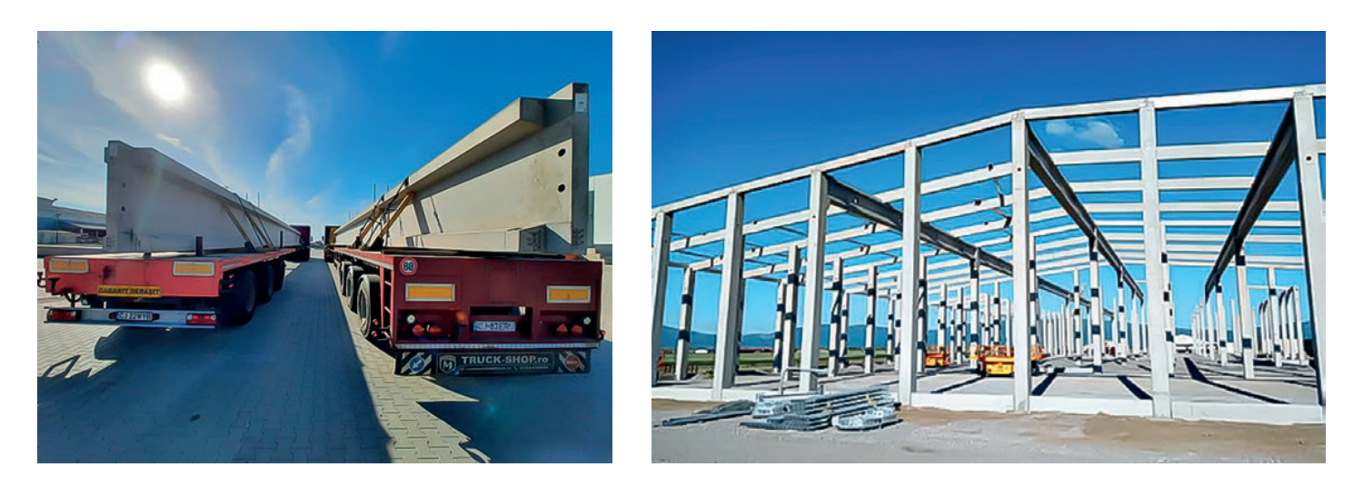
The beams and columns can be produced in the factory and then installed in no time at the construction site.

"The Progress Group fulfilled our expectations with the quality, support and mentality they deliver. For example, the Progress Software Development provided us with a great roadmap for the implementation, support and maintenance of the e<sup>rp</sup>bos and ebos systems belonging to the production lines. The custom needs were handled and the customization of the solutions (machines and software) were done on a high level.", said Viastein KFTs managing director.