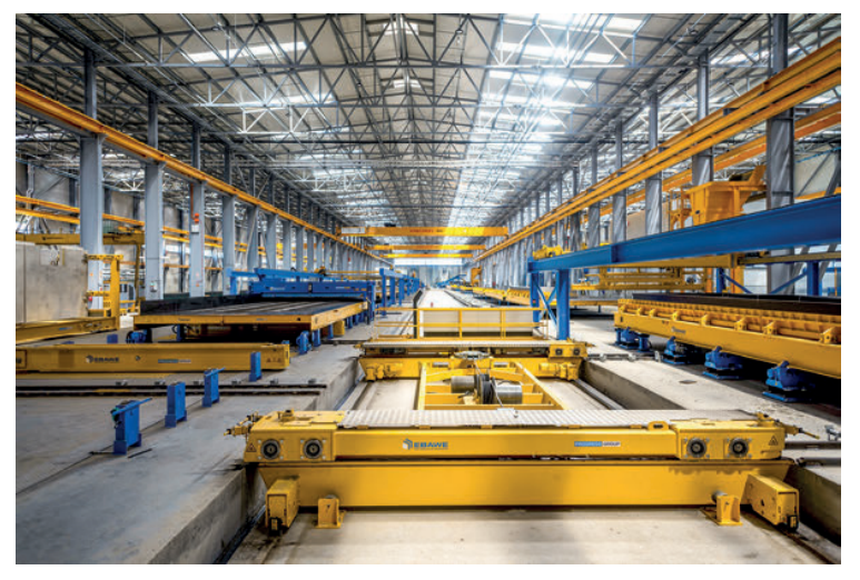
The new machinery from Progress provides an automated, more secure and cleaner production with higher quality products, made in a shorter amount of time.