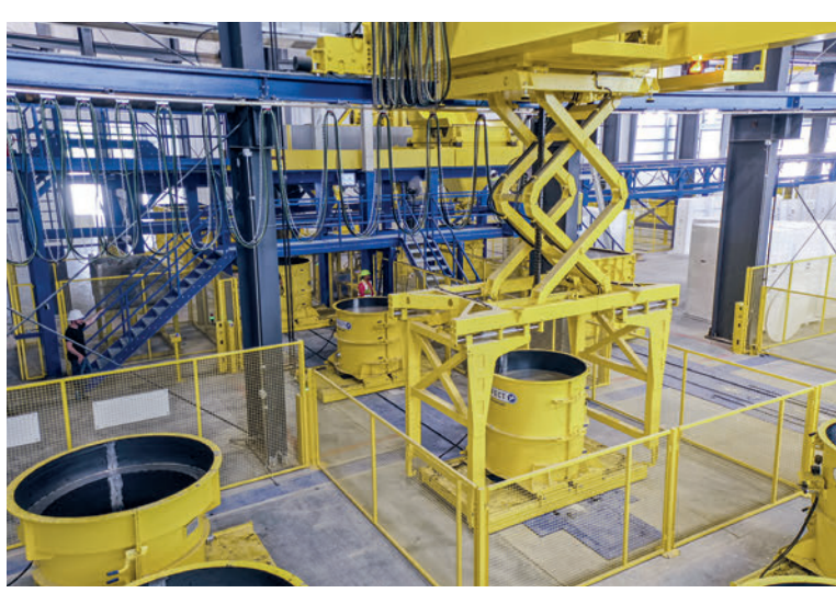
Continuous processing of SCC constitutes a vital basis for efficient operation of an industrial wet cast production plant.

To reduce the working hours required to manufacture and install negative channels in the casting moulds, the entire plant concept is designed for maximum throughput. All the necessary work steps are carried out in predefined places using suitable tools. Even activities such as cleaning or lubrication of moulds, or setting up the reinforcement in the moulds are taken into account in the overall concept as predefined work steps. To accommodate mould set-up, which can vary in complexity depending on the product to be manufactured, to continuous wet cast production, the Ameritex Pipe & Products plant was equipped with severalset-up locations. There, staff can carry out all the necessary work steps outside of the safety area of the automated plant and return the set-up moulds to automatic operation at the push of a button.