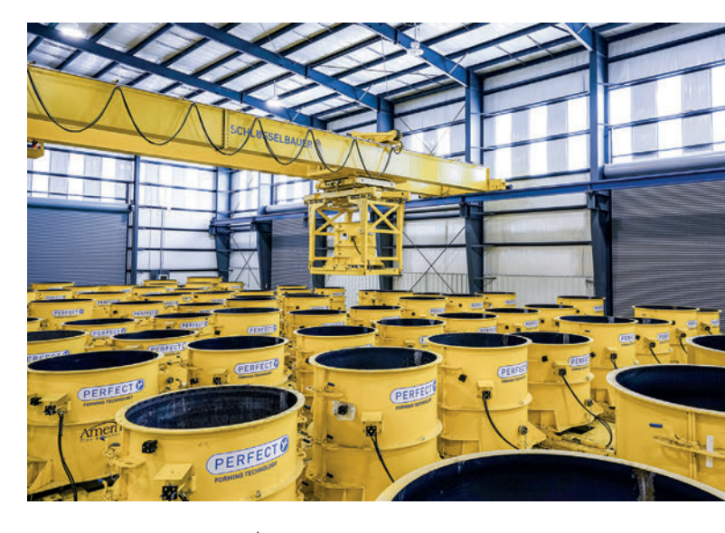
Transexact - Automated crane operation and mould management system in one.

The use of an automated Transexact crane to move the filled moulds is vital to the productivity in the factory. The Transexact places the moulds that have just been filled with SCC in a predefined position in the curing area. Following the daily production schedule, the Transexact then picks up a mould containing the hardened product and moves it to the demoulding position. An automated product gripper removes the component from the mould and places it in the desired position on the outgoing chain conveyor. The EPS negative channels are removed from the manhole bases and recycled in compact form. The EPS consumption of the Perfect production system is a fraction of that of other known production techniques.