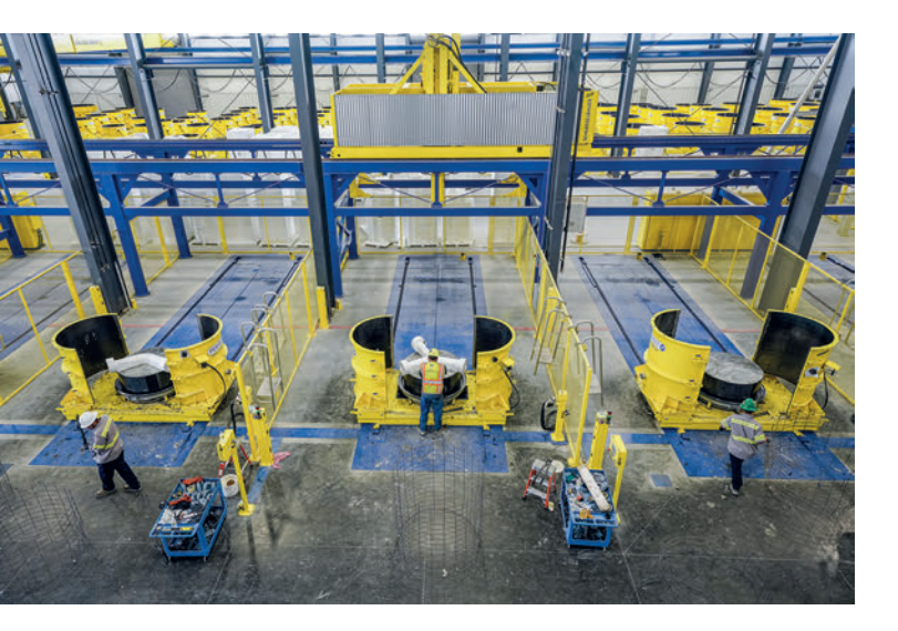
In all operating positions, value is placed on user-friendliness and efficient division of labor.