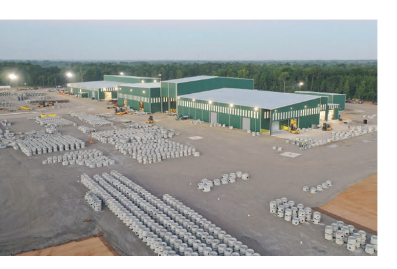
The first location of Ameritex Pipe & Products to be equipped with a highly automated wet cast production plant from Schlüsselbauer Technology in 2022.

Custom manhole bases have been manufactured efficiently using the Perfect production method developed by Schlüsselbauer Technology since 2005. A smart system of prefabricated EPS moulded parts and easy-to-use plants with which to process them are now recognized and used globally. At Ameritex Pipe & Products, manhole bases with nominal diameters of 48" and 60" are manufactured on the new wet cast plants. For channels with diameters ranging from 10" to 36", EPS moulded parts are assembled in very few work steps. A characteristic of the Perfect method is that the inclines in the channel are continued in the pipe connection. This improves the hydraulics of the individual pipe-manhole connection and ultimately of the entire sewage network.