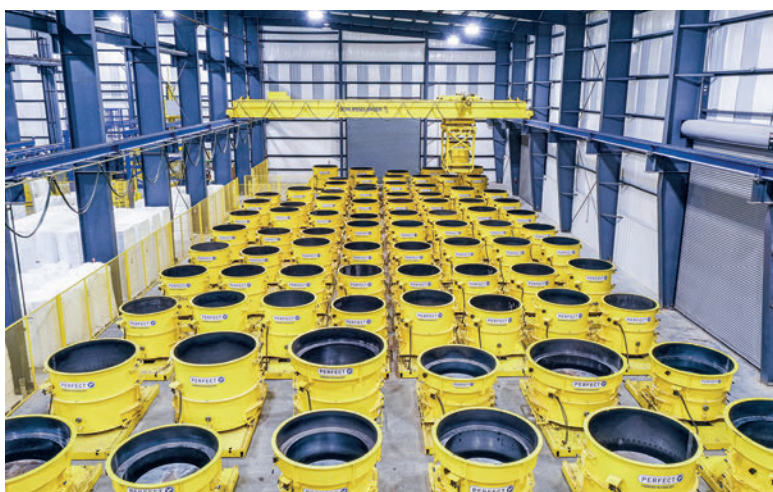
The installation enables a production output of significantly more than 100 components per extended shift.