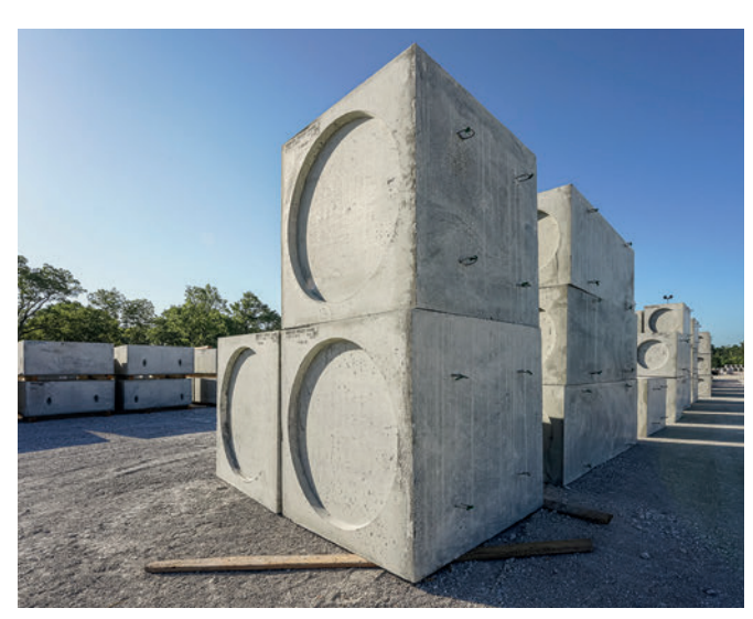
In addition to custom monolithic Perfect manhole bases, rectangular and standardized manhole components are also manufactured on the plant.