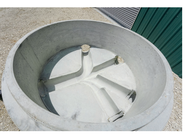
The custom channel formation is the essential characteristic of Perfect manhole bases.