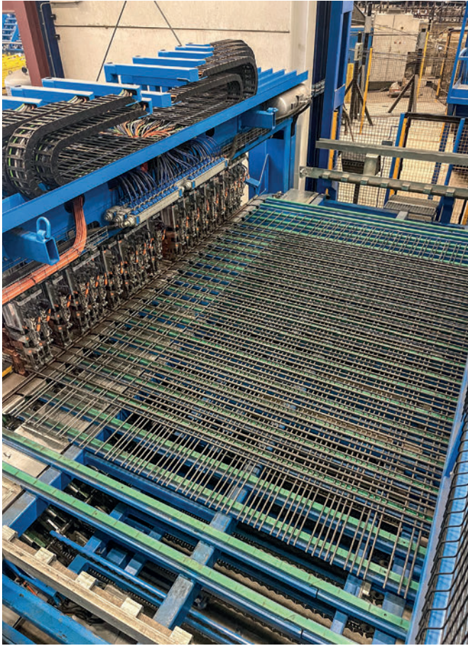
GP Wapening can produce flawless special cages rapidly using the maximum number of welding heads and additional innovative bending solution

with high quality and little waste. Especially when current steel prices are taken into consideration, production from a coil, as is standard with all Progress machines, is the more sustainable solution because it minimises waste. The M-System PowerMesh with 20 welding heads is the ideal solution for generating high output with special curved cages. It boasts a sophisticated bending solution featuring a combination of single and side benders for positioning mesh elements and then mounting a corresponding 2D top mesh on top. The maximum is 4 tonnes per hour. The system works in three shifts, two during the day when cages are produced and a night shift when it is the turn of flat meshes and more simple curved cages. Cages and meshes for solid walls can be manufactured, some with recesses, but also balcony cages and the like for supports in the range of 6 to 16 mm wire diameter.