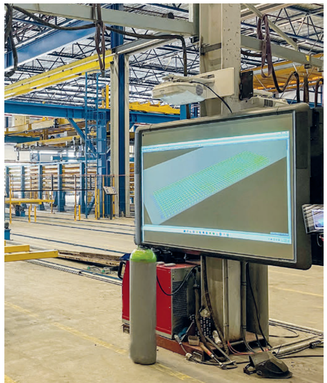
Plans can be visualised in 3D models with the appropriate software solutions, thus facilitating accurate results