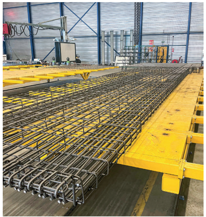
Recesses and bends exactly according to plan are no longer a problem with the innovative automation solutions

been projected to the welder on a screen or beamer as a 3D representation. What the end product looks like is thus clearly visible according to design planning. This makes the work easier and reduces the error rate - which additionally supports paperless, and thus even more sustainable, production. The e 2 Pbos system thus helps organise production correctly and is supported by the "profit" software, which takes over production planning and sends all data directly and cleanly to the MSR straightening, cutting and bending machine as well as the EBA automatic stirrup bending machines. This happens at exactly the right moment thanks to the good interaction of software and automated machines, so that the add-on material is ready at its assembly station even when the M-System is engaged in production. Everything can be planned, produced and assembled as needed with this innovative software and the automated machines.