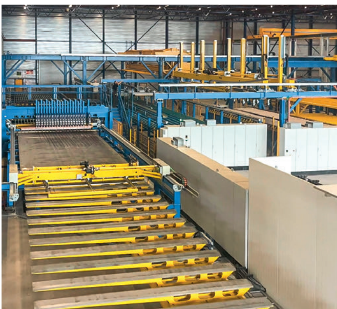
The high output of the M-System Evolution mesh welding plant is especially impressive

The decision to invest in the M-System Power Mesh was based on the fact, that the machine could deliver the most production amount in square metres per machine area. It was also a question of generating the greatest volume of output