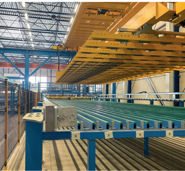
A magnetic crossbeam transports the meshes and cages fully automatically to the next station