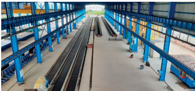
Overall four lines with a length of 145 meters are producing hollow core precast elements in the new plant of Stellar Precast.

“What we have seen is that the hollow core machinery of UltraSpan / Progress Precast India in the means of efficiency, compared to other hollow core production machinery, is higher. We saw that the void percentage is much higher and safety is higher. The machine is competitively simpler to understand and handle and can be maintained very easily. Even if any problem comes up, it can be resolved very quickly, so the down time is less and we are very satisfied with it.”, states the Project Manager Mr. Gaurav confidently.