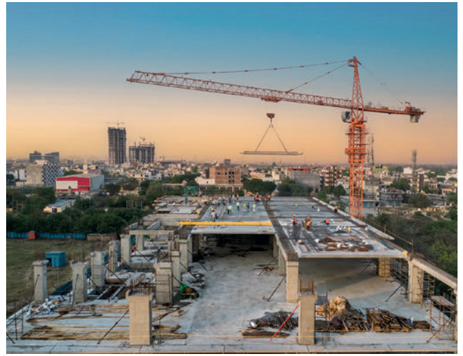
Building with precast elements reduces material needed, manpower and mistakes on site - all while increasing quality.