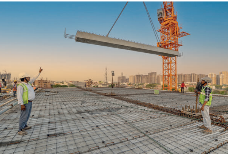
With prefabricated elements it takes significantly less time to build.

According to Stellar, in the beginning they had some similar commercial building projects, which lined up in the last years. So moving the focus to constructing with standardized precast also regarding those projects just made more sense. Especially in commercial buildings, as you get a longer span and a clear room / working area. Apart from that, precast has the benefit of reducing the construction time up to 50%, so the elements can be produced under any weather condition in the plant and the machinery can work around the clock, according to the expert from Stellar. In addition the quality of the product is constantly good as it is produced in a highly automated plant. The elements stay in a certain quality that is not achievable with classical construction methods. There are too many factors, that can compromise the quality and with that often the speed of the construction as mistakes need to be mended. Also safety remains a big concern and, it is way easier to guarantee with producing and building with precast elements.