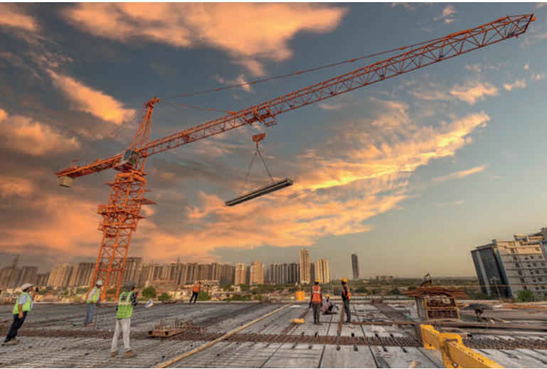
With 25 years experience the construction company never fails to think ahead and invest in innovation - such as precast.