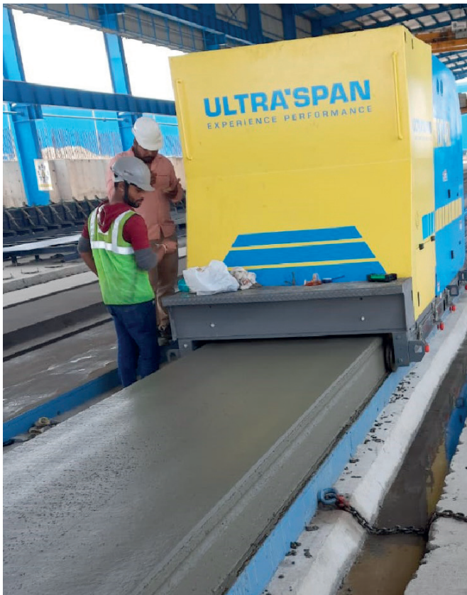
The extruder from UltraSpan is providing fast and high quality production on beds of hollow core slabs.