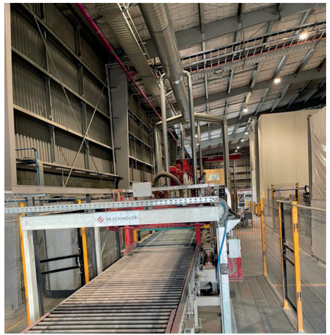
Piping of dust extraction