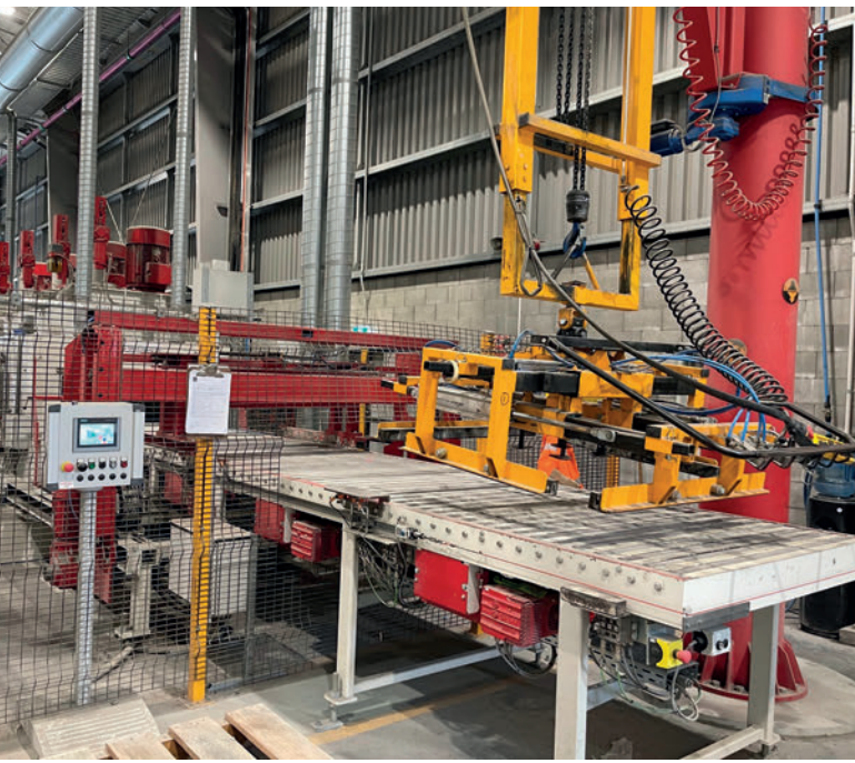
Infeed with slewing crane and 4-sided clamp, roller conveyor enclosed in our safety system