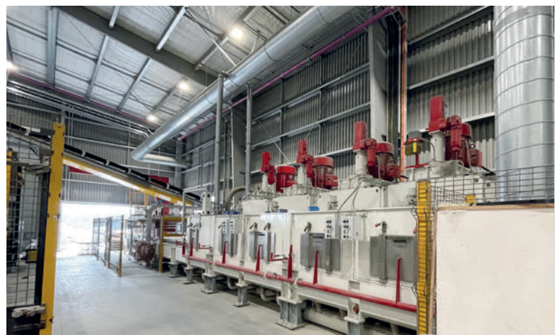
Complete grinding line