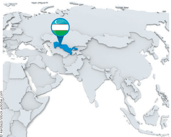
Uzbekistan as an attractive country for investment and commerce

AKFA had gone through many internal decision-making processes beforehand, as the management does not leave anything to chance. A highly efficient business division that is part of the R & D Department had thoroughly researched market trends and recognized the potential of various concrete products in Uzbekistan. The R & D Department developed a structured business plan that also comprised of potential and