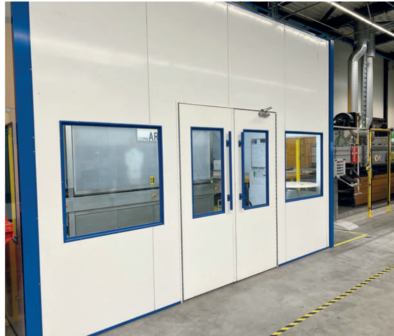
The printer prints the individual desired motifs on the products at an 8 m/min throughput speed.

A further layer pusher with a transfer table now transports the individual layers to the printer provided by the customer, where the individual desired motif is printed on the products at a throughput speed of 8 m/min.