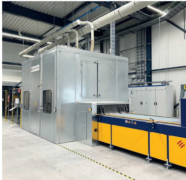
Soundproofing chamber for the aging plant

To protect the employees in the hall from the noise level caused by the aging machine, MBI opted for a separate soundproofing chamber in which the plant is housed.