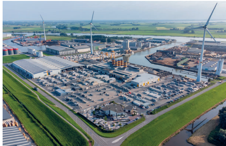
The MBI plant in Kampen

The heart of the new finishing line is the printing line, which enables the family-owned company to print individually on