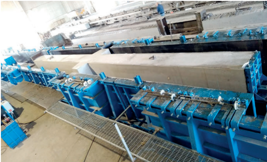
The produced pillars with corbels are 28, 5 meters long.

The family run company was founded in 1994 by the Pireddu family and is, with 40 employees, one of the most important companies in the Sardinian world of pre-fabrication. The state-of-the-art plant is taking 55.000 square meters in space and produces elements for roughly forty structures per year – commercial and industrial buildings. Consultecna is a reference supplier of the most important national and foreign commercial chains and – also thanks to the barycentric position – the whole regional territory of the beautiful island Sardinia.