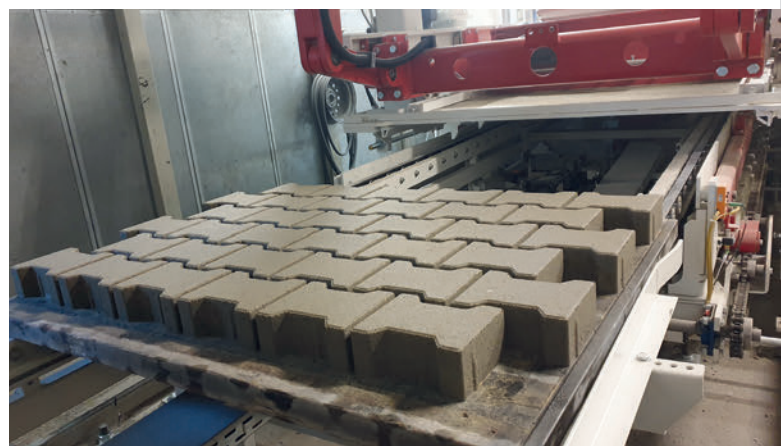
Start of production with the RH 2000-4 MVA block making machine