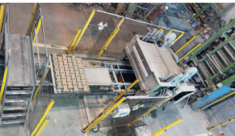
New safety technology on the wet side

Hess Group Freier-Grund-Straße 123 57299 Burbach-Wahlbach, Germany T +49 2736 49760 info@hessgroup.com www.hessgroup.com