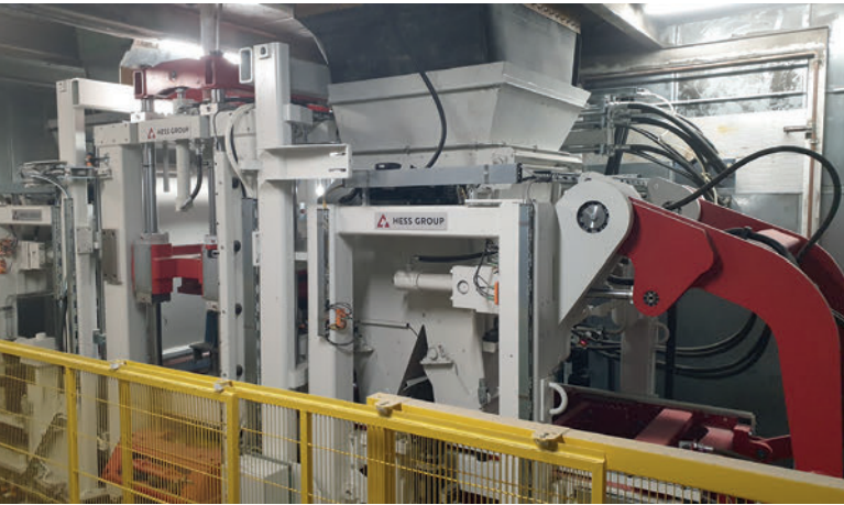
The new RH 2000-4 MVA block making machine

A new control system for the existing finger car was installed alongside the complete wet side control system as part of the first reconstruction phase.