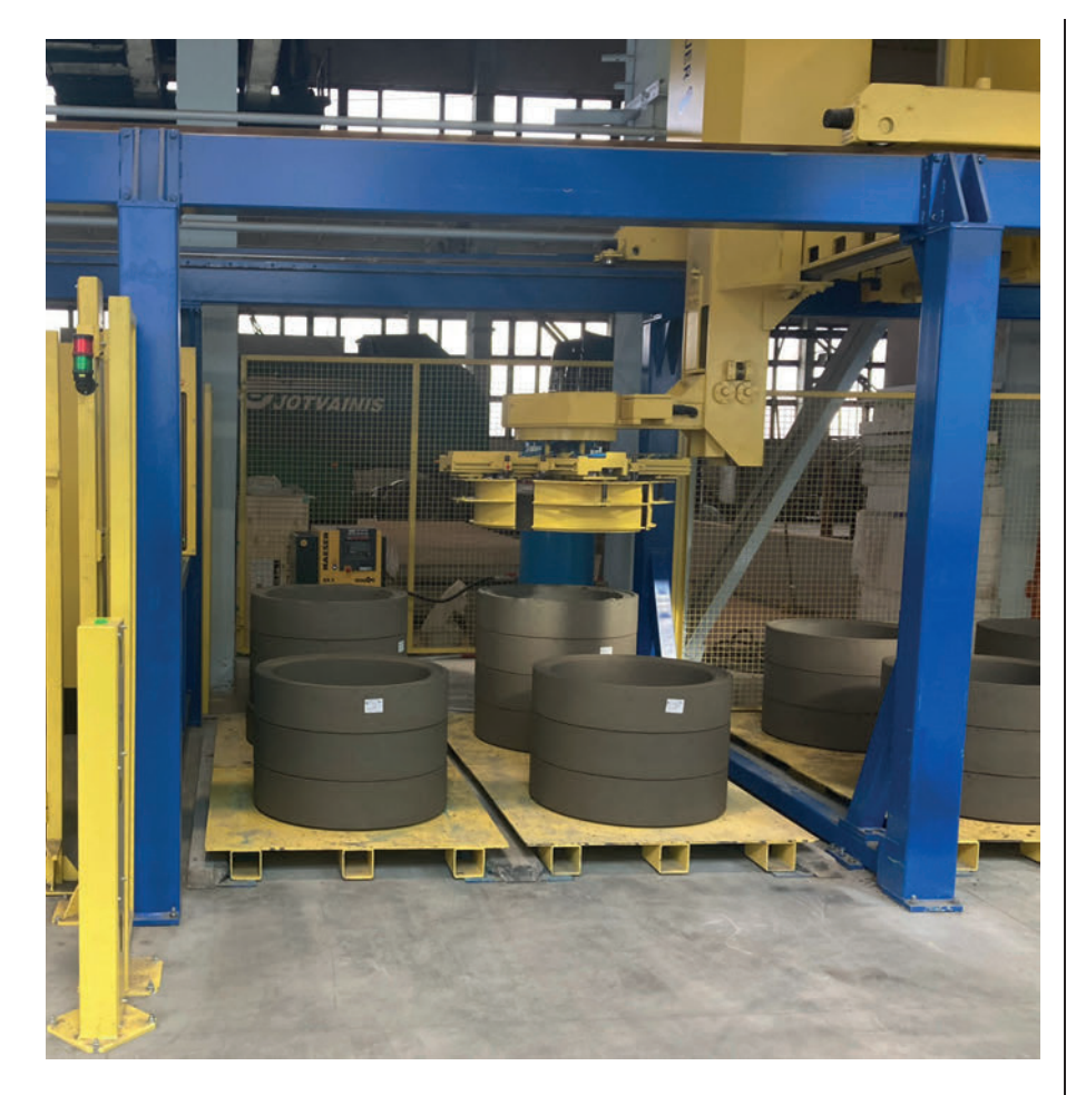
Fully automated adjustment ring manufacture and handling with automatic Ringmaster stacker.

and form the joint. Aside from laying the pre-prepared reinforcement rings in the machine, the plant operator's main task is to monitor the process and to check the concrete and product quality is consistent. Depending on the selected ring height, the Ringmaster plant can output 40 to 60 circular adjustment rings every hour.