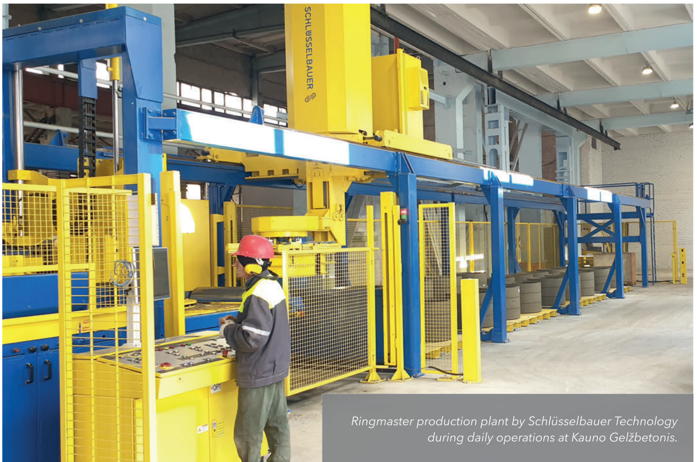
Ringmaster production plant by Schlüsselbauer Technology during daily operations at Kauno Gelžbetonis.

Approximately one hour's drive from the Lithuanian capital, Vilnius, is Kauno Gelžbetonis's base in the city of Kaunas, where the Ringmaster by Schlüsselbauer Technology was installed and commissioned with impressive speed in the summer of 2021. Right from the start, adjustment rings measuring 700 mm in diameter and in seven different heights have been manufactured at the plant. A feature unique to the plant is production without steel bottom pallets. The fresh products are lifted out of the machine and carefully moved to the curing area using a hydraulic gripper. A closer look at the production process reveals how smoothly and seamlessly—almost at a rate of every minute—reinforcement rings are transferred to the mould and hydraulically centered, and then the mould is filled with concrete. The vibration unit, core, mould, and press work perfectly together to compact the concrete