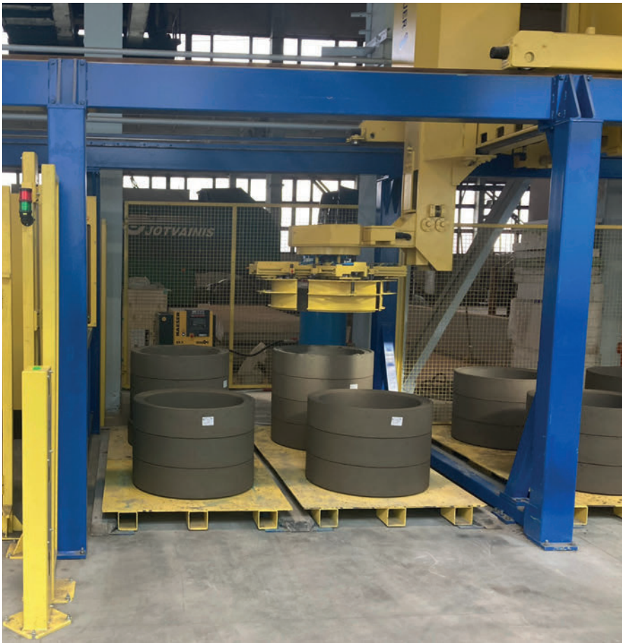
Fully automated adjustment ring manufacture and handling with automatic Ringmaster stacker.

and form the joint. Aside from laying the pre-prepared reinforcement rings in the machine, the plant operator's main task is to monitor the process and to check the concrete and product quality is consistent. Depending on the selected ring height, the Ringmaster plant can output 40 to 60 circular adjustment rings every hour.