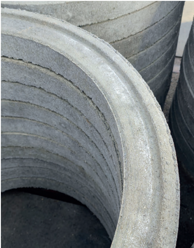
Production of adjustment rings with rebated joints without bottom pallets.

This, together with a fine layer of release agent on the underside of the products, ensures that fresh products do not stick to one another. A different number of components are stacked on the steel storage pallet depending on the height of the relevant product. Once all pallets have been loaded, the operator moves them out of the machine area into a second curing area and then moves the emptied pallets back to the machine.