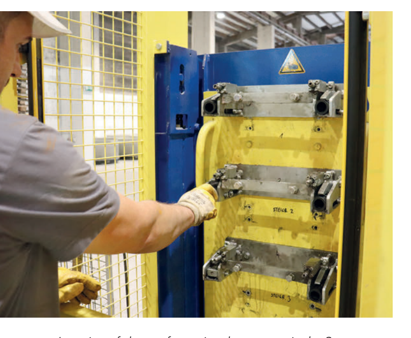
Insertion of sleeves for optional step pegs in the Stepmaster magazine

Tiba opted for the Magic 1501 production system, which allows single or multiple production of up to six precast parts, such as guidepost bases, and is designed for maximum product sizes of up to 820 mm outer diameter in double production and up to 1,800 mm outer diameter in single production. Square profiles can be manufactured with external measurements of up to 1,270 x 1,270 mm in single production.