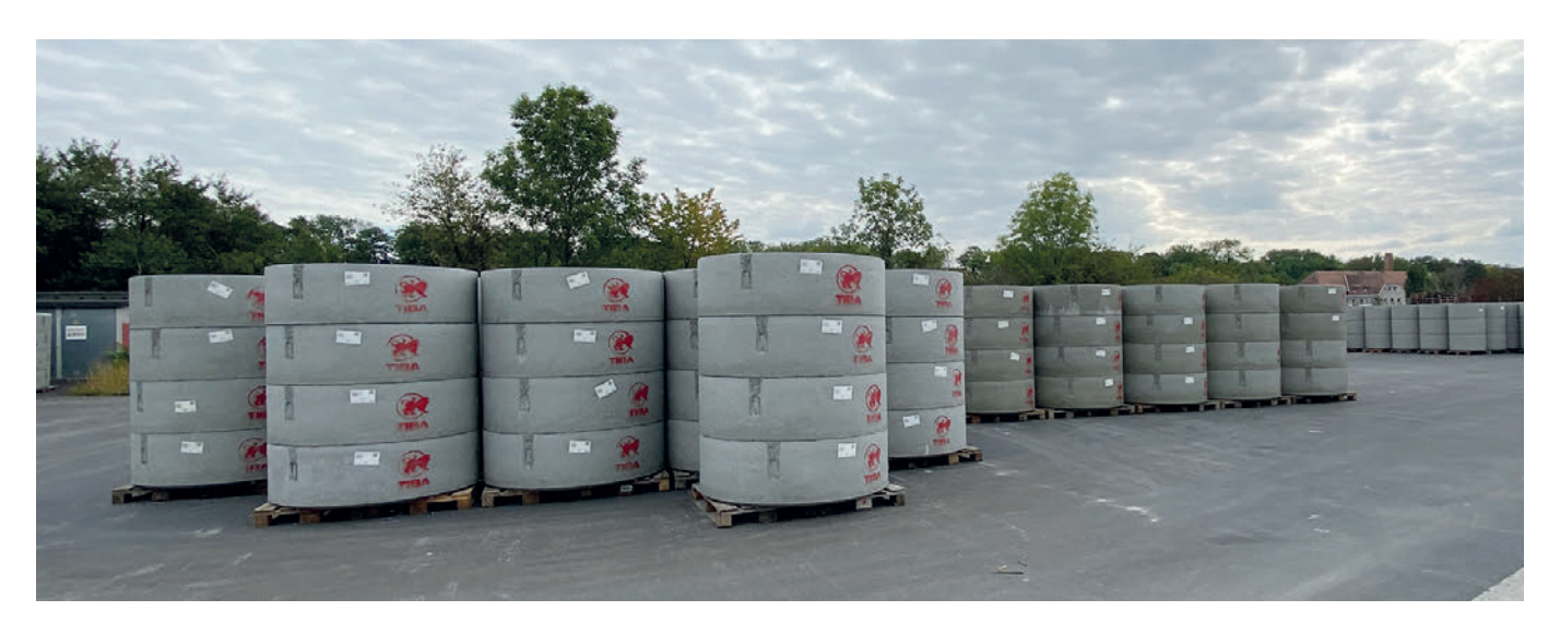
External storage area at the Sollenau factory

In addition to the visual monitoring of Magic's production, the operator is also responsible for inserting reinforcement rings into the machine and minor tasks such as placing set rings on the tops of the manhole parts or spray-painting the company logo on the product, for example.