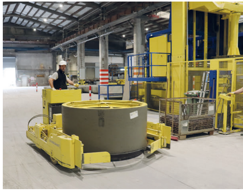
Electric cart for the transportation of fresh and hardened products