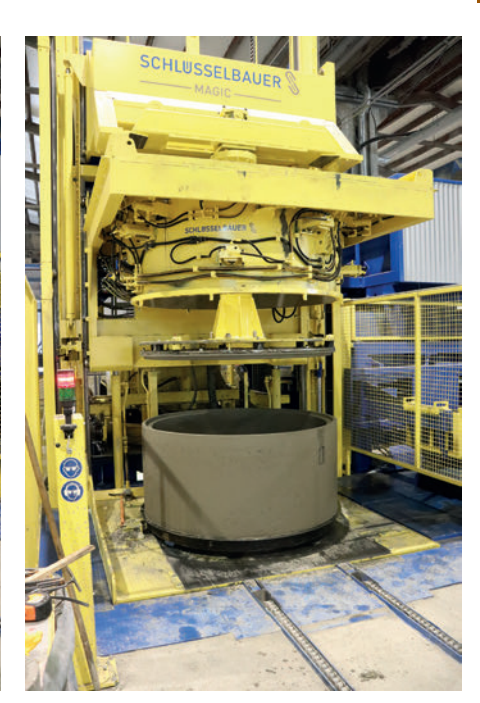
The filling of the Magic production system with concrete. The compaction process and the ejection of the finished product are fully automated.

system, which enables manhole bases to be manufactured in one pour using a wet cast process. Overall, the corporate group, Kirchdorfer Fertigteilholding, operates ten systems from Schlüsselbauer Technology at five production sites.