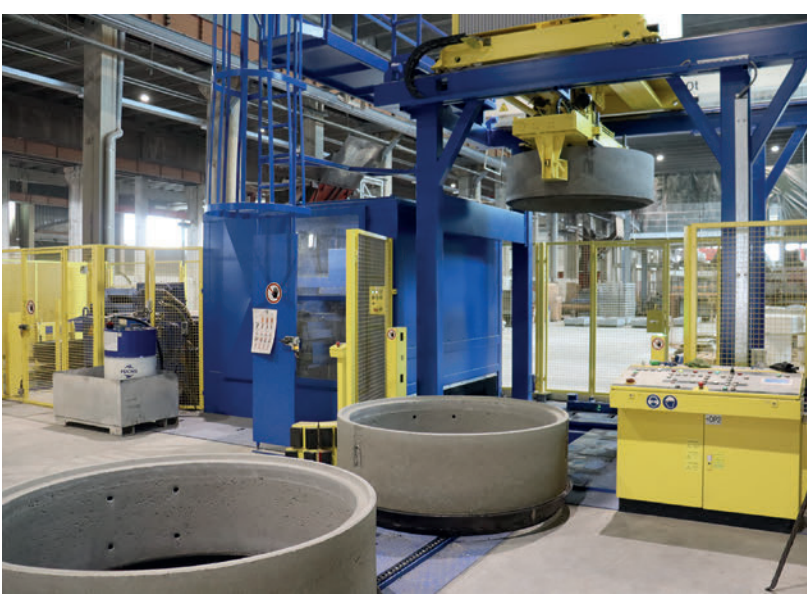
View of the palletizing station of adjoining, blue enclosed cleaning system and following pallet oiling station

Magic offers two different system concepts: a stationary production on a standalone production machine with manual product transport, or a fully automatic circulation system. A stationary machine is used at Tiba, paired with a very high