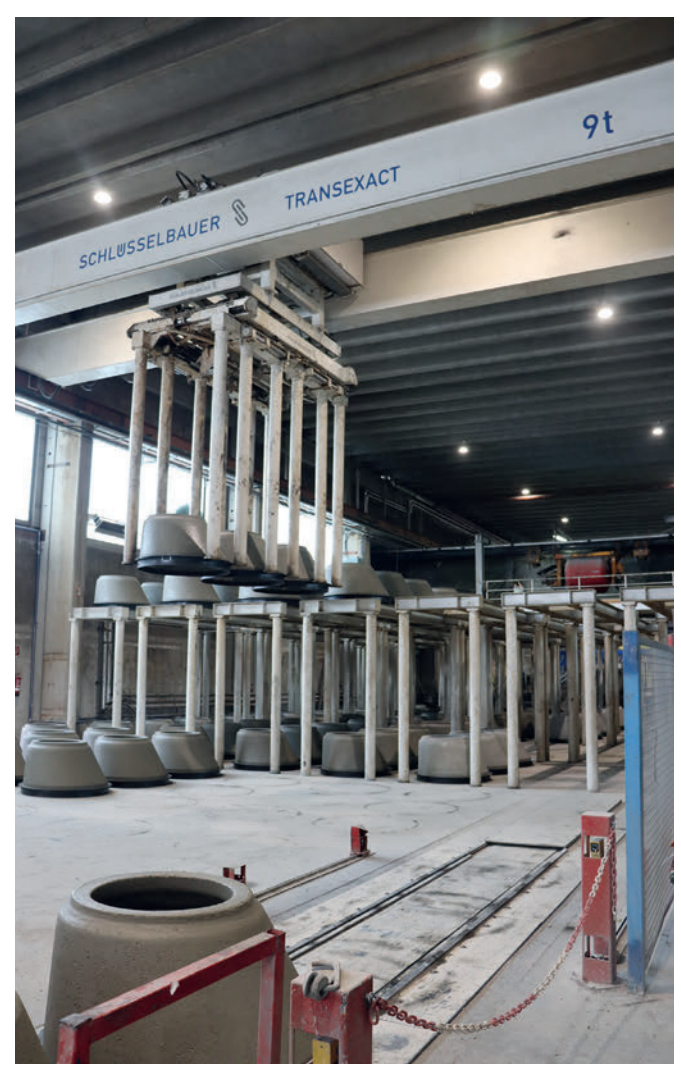
The modular, fully automatic Exact production system for pipes and manhole components has been in operation at Sollenau since 1998.