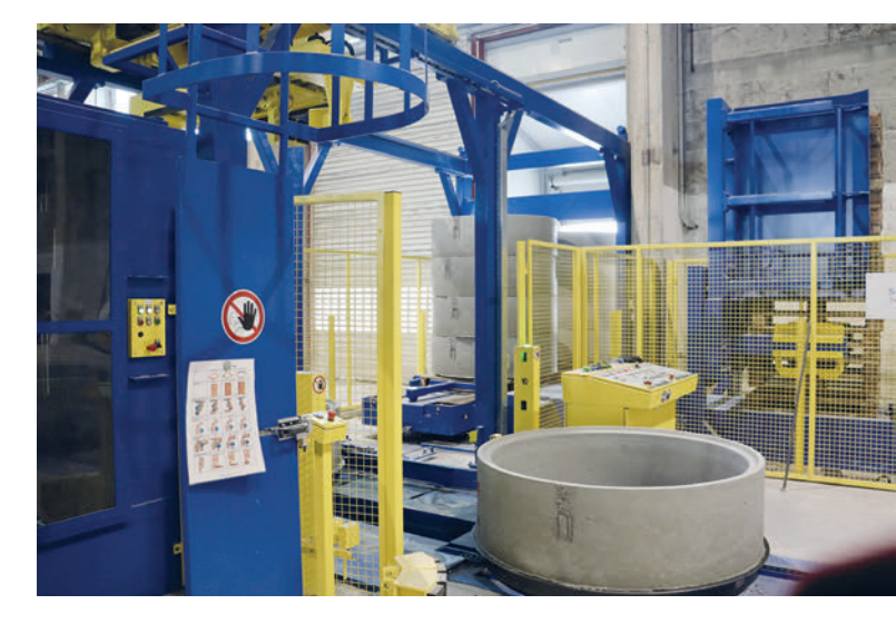
The maximum stack height is 2,000 mm; this figure shows four manhole risers with a height of 500 mm each.

The concrete is supplied via the existing concrete mixing plant. The concrete is transported from the mixing plant to