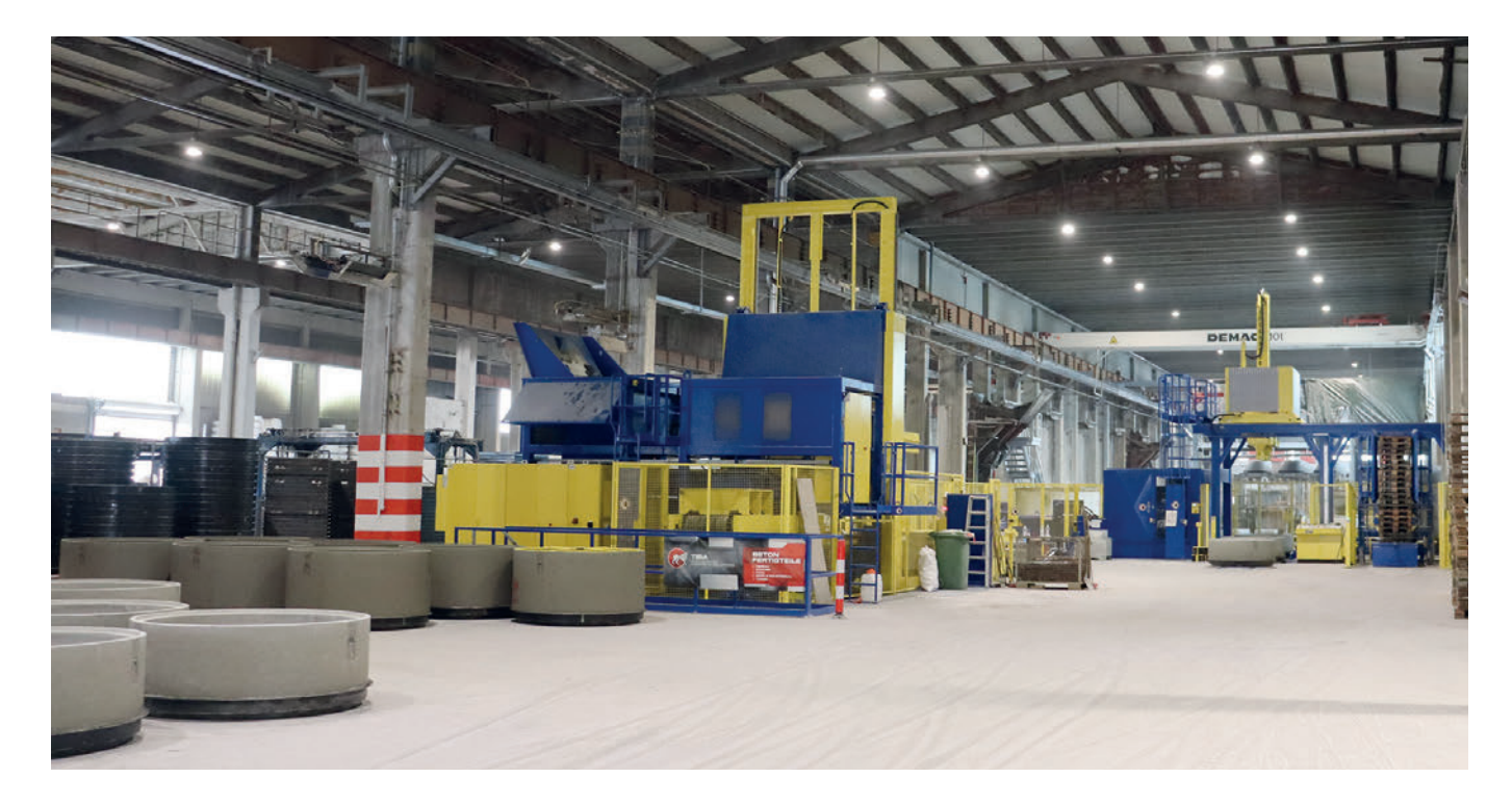
View of the new Magic production system

With Tiba's installation of a new Magic production system, their Sollenau plant now has three Schlüsselbauer Technology systems in operation. In 1998, prior to Tiba's purchase of the plant, the previous owner installed a Schlüsselbauer Exact plant, which is a modular, fully automatic production system for pipes and manhole components. And in 2013, Tiba installed Schlüsselbauer's Perfect manhole base production