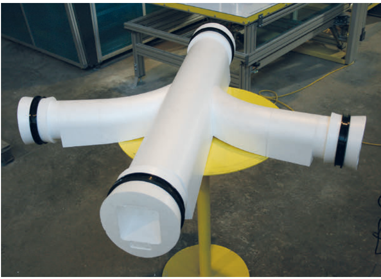
In use since 2013: The Perfect manhole base production system with which manhole bases can be manufactured in one pour using the wet cast process.