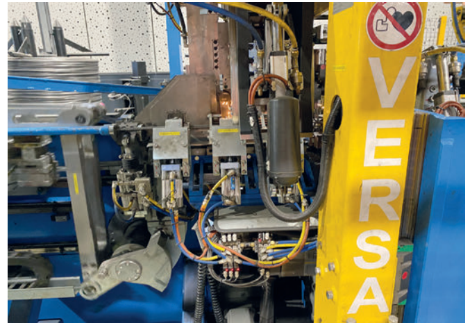
VGA Versa lattice girder welding machines for flexible production of lattice girders from the coil