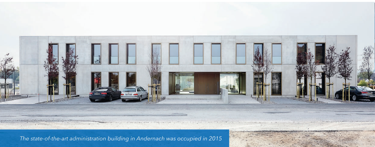
The state-of-the-art administration building in Andernach was occupied in 2015

The demand for energy-efficient buildings is growing steadily, as about 40% of the total energy consumption in the EU is attributable to the use of buildings. With concrete elements from ABI, building can be economical, sustainable and environmentally friendly. Energy consumption is not only