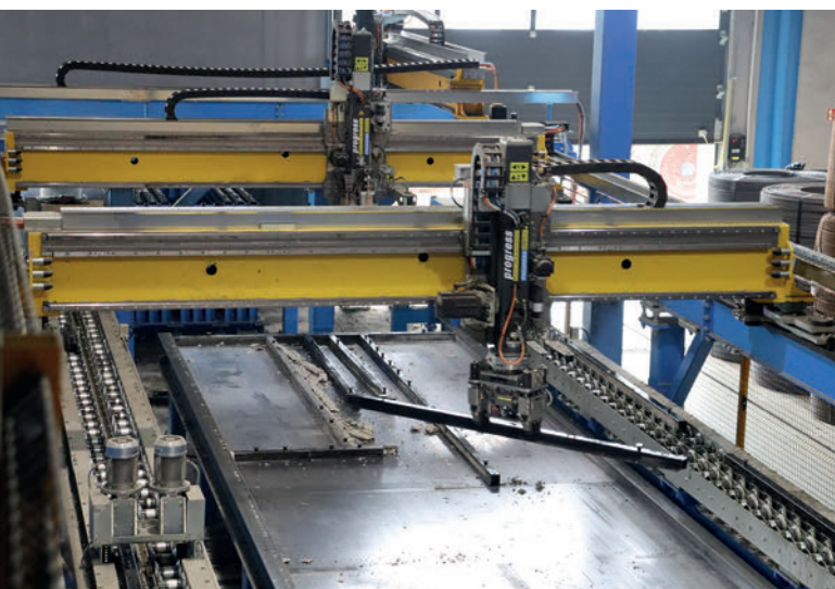
Form Master shuttering removal station

Clean pallet formwork surfaces guarantee high quality end products without subsequent post-processing. After all the