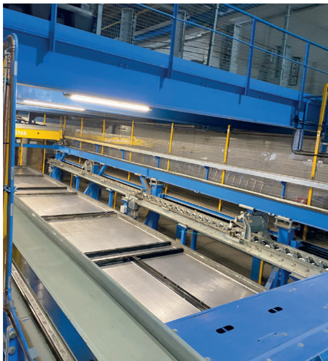
Form Master shuttering station

The storage robot selects the required shutters for new components from the shuttering store according to the CAD data transmitted by Progress Software Development's ebos® control system.