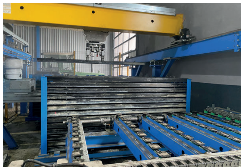
Storage robot in the active storage area