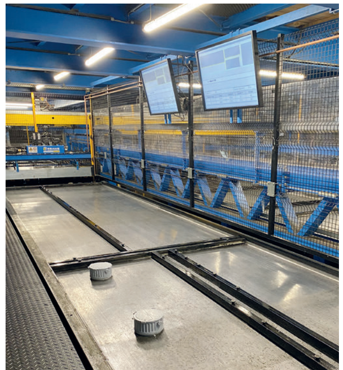
Paperless production - printed drawings are a thing of the past at ABI

After the shuttering work has been completed, the pallet moves across to the next station, where manual shuttering work, such as placing installation boxes, etc., is still being carried out by an employee. Another special feature of ABI is that drawings of the components to be manufactured are a thing of the past. At the stations where employees intervene manually in production, detailed drawings are displayed on several large monitors, of course only of the precast slabs currently being processed. When the positions of the pallets are changed, the display on the monitors is also updated fully automatically.