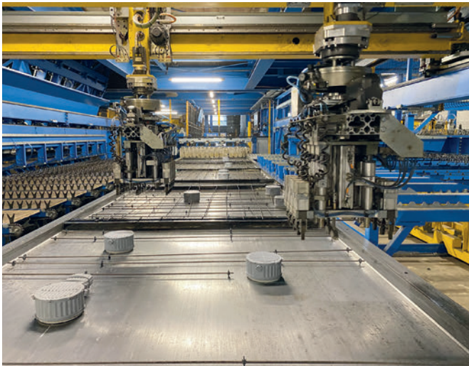
Multi-axis robot for placing the reinforcement

straightening technology allows a very high processing quality in order to meet the applicable standards.