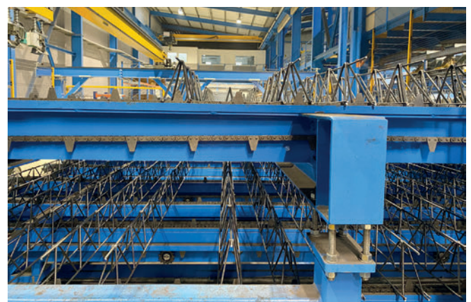
All manufactured lattice girders are placed on a buffer magazine by a crane robot, which then automatically and individually feeds them to the laying robot.