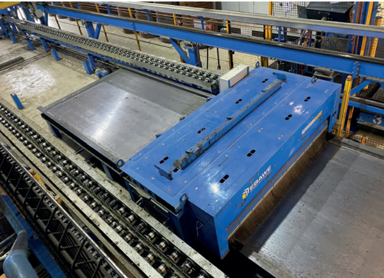
Pallet cleaning device

formwork has been removed by the robots, the pallet moves longitudinally in the production cycle to the shuttering station. The pallet passes through an Ebawe cleaning device to clean the formwork surface. Residues on the formwork surface and the edge shuttering are effectively removed. This ensures a consistently high-quality surface of the end product.