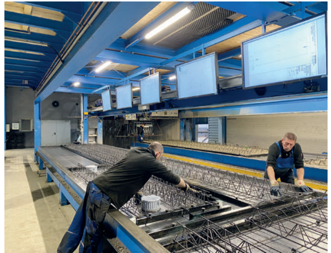
Final inspection of the reinforcement

reinforcement, it is ready to be moved to the next processing station.