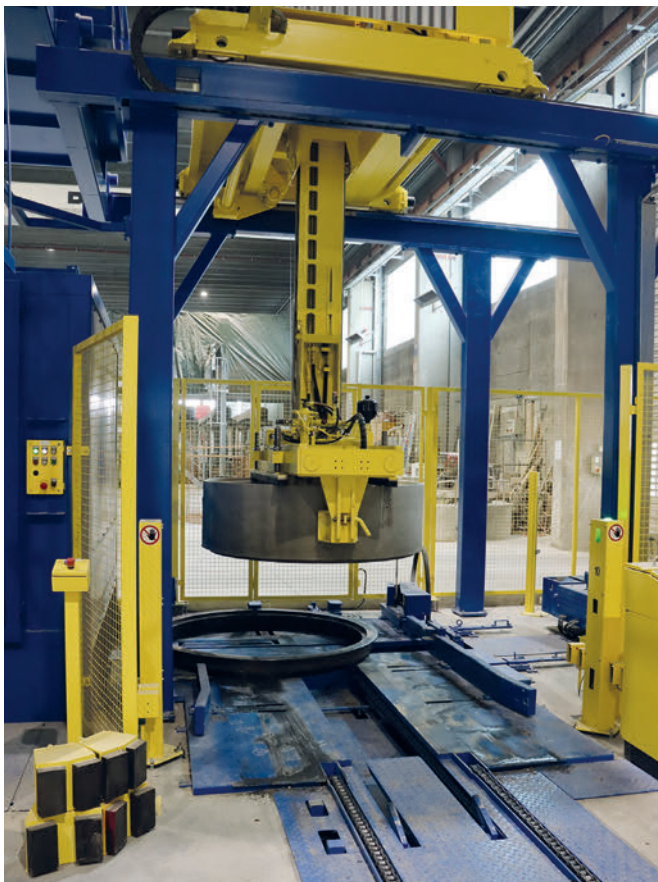
After the manipulator has lifted the manhole part and thus released it from the pallet, it is directly inserted into the cleaning station.

level of automation on the dry side with a fully automatic pallet solution, pallet packaging, cleaning and oiling, as well as a fully automatic return of the pallets to Magic's production system. Only freshly made products and the later hardened manhole components are transported by the employee in an electric cart, also designed by Schlüsselbauer Technology.