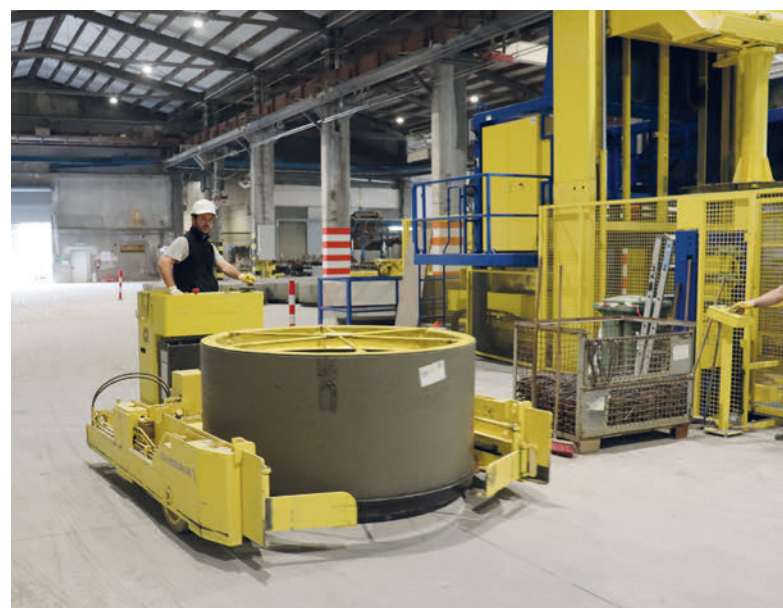
Electric cart for the transportation of fresh and hardened products