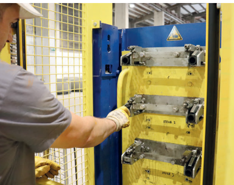
Insertion of sleeves for optional step pegs in the Stepmaster magazine

Tiba opted for the Magic 1501 production system, which allows single or multiple production of up to six precast parts, such as guidepost bases, and is designed for maximum product sizes of up to 820 mm outer diameter in double production and up to 1,800 mm outer diameter in single production. Square profiles can be manufactured with external measurements of up to 1,270 x 1,270 mm in single production.