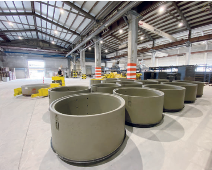
Fresh products in the curing area of the production plant