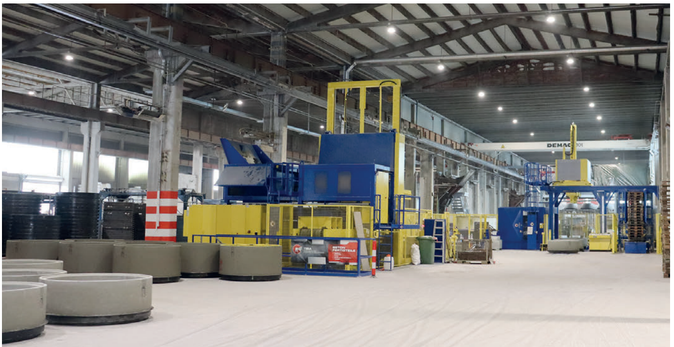
View of the new Magic production system

With Tiba's installation of a new Magic production system, their Sollenau plant now has three Schlüsselbauer Technology systems in operation. In 1998, prior to Tiba's purchase of the plant, the previous owner installed a Schlüsselbauer Exact plant, which is a modular, fully automatic production system for pipes and manhole components. And in 2013, Tiba installed Schlüsselbauer's Perfect manhole base production