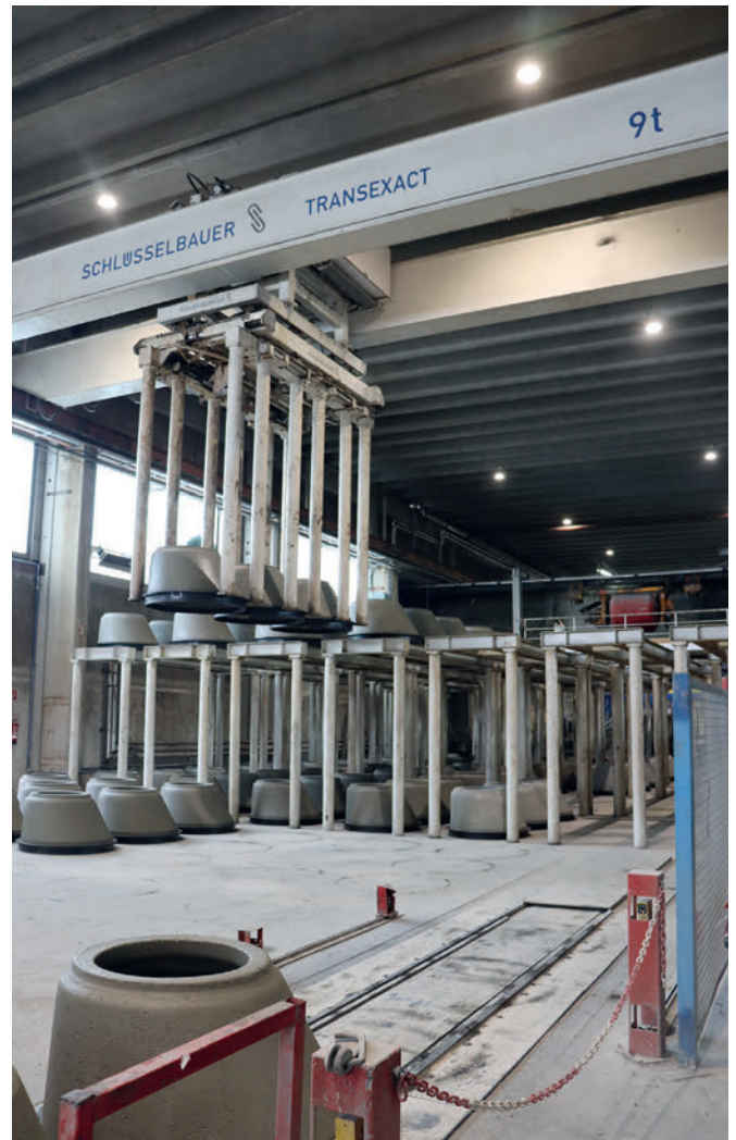
The modular, fully automatic Exact production system for pipes and manhole components has been in operation at Sollenau since 1998.