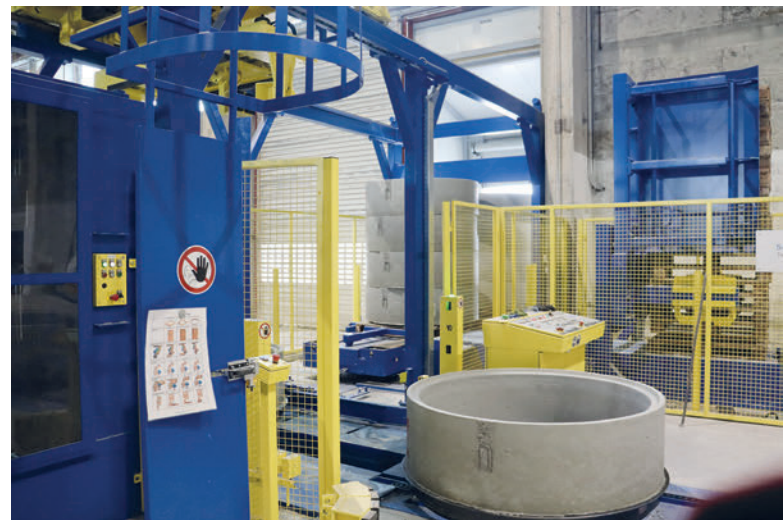
The maximum stack height is 2,000 mm; this figure shows four manhole risers with a height of 500 mm each.

The concrete is supplied via the existing concrete mixing plant. The concrete is transported from the mixing plant to