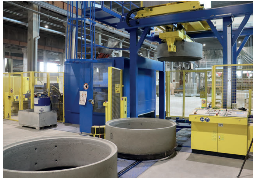
View of the palletizing station of adjoining, blue enclosed cleaning system and following pallet oiling station

Magic offers two different system concepts: a stationary production on a standalone production machine with manual product transport, or a fully automatic circulation system. A stationary machine is used at Tiba, paired with a very high