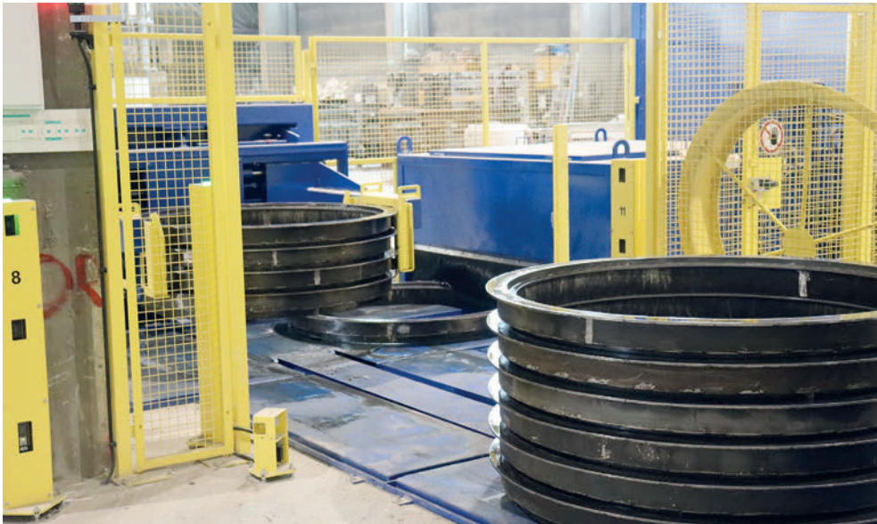
The cleaned and oiled pallets for subsequent use are stacked by the pallet stacking device

the production system using a bucket conveyor. The storage container is very spacious and lasts several cycles.