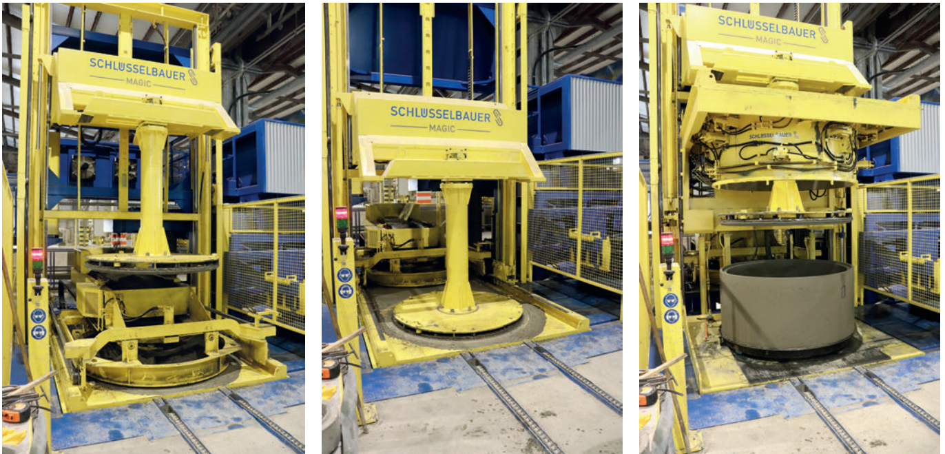
The filling of the Magic production system with concrete. The compaction process and the ejection of the finished product are fully automated.

system, which enables manhole bases to be manufactured in one pour using a wet cast process. Overall, the corporate group, Kirchdorfer Fertigteilverteilung, operates ten systems from Schlüsselbauer Technology at five production sites.