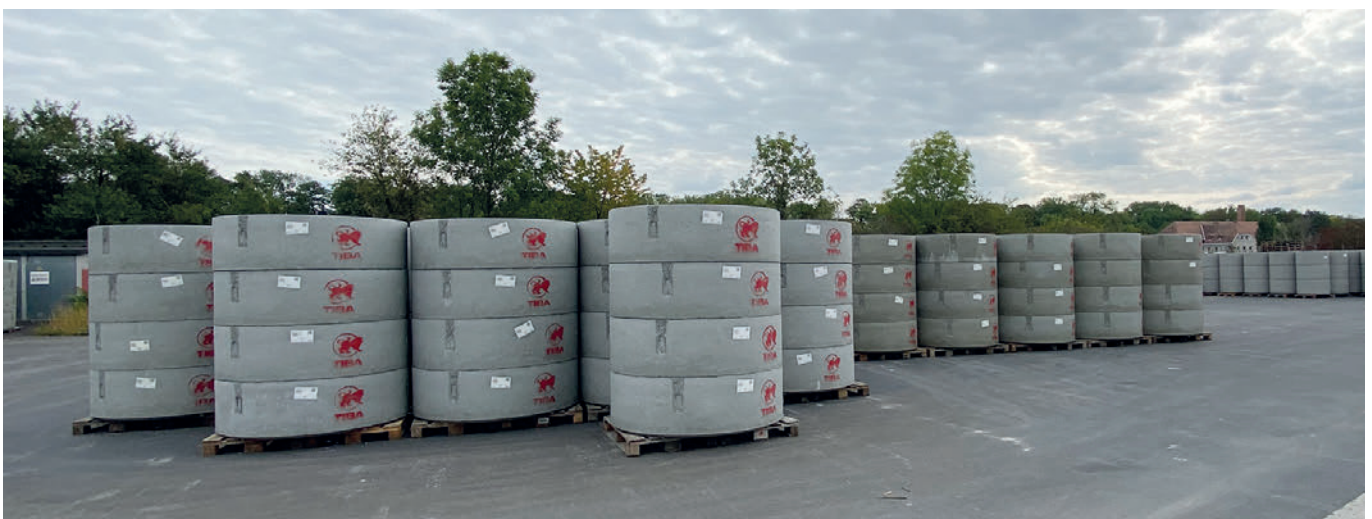
External storage area at the Sollenau factory

In addition to the visual monitoring of Magic’s production, the operator is also responsible for inserting reinforcement rings into the machine and minor tasks such as placing set rings on the tops of the manhole parts or spray-painting the company logo on the product, for example.