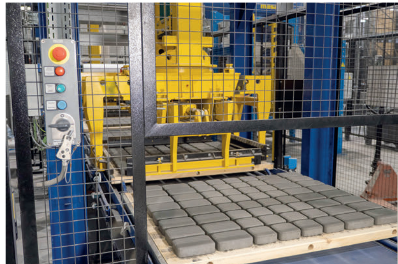
Servo controlled Masa centering device with 4-sided centering clamp