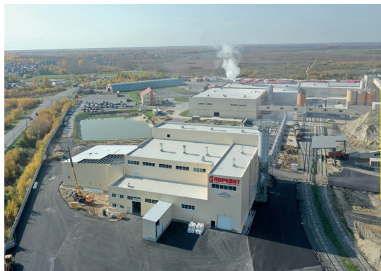
The Porevit Plants in Yalutorovsk: Successful partnership with Masa GmbH since 2009