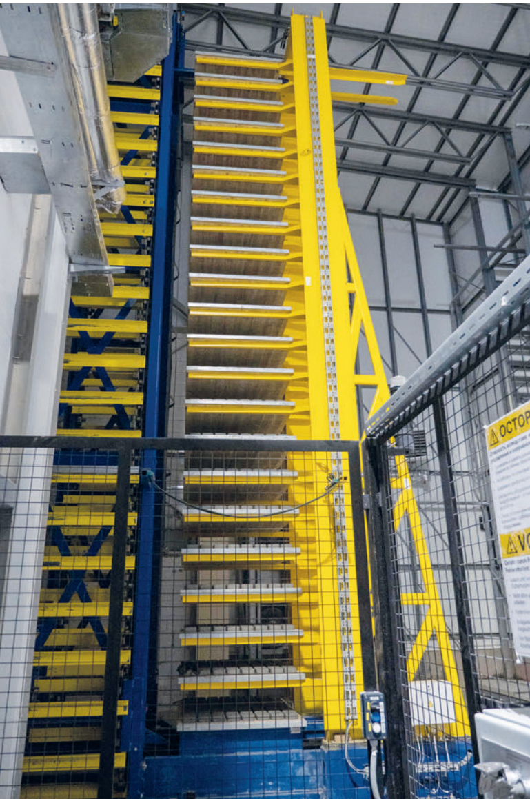
Continuous operation process with Masa intermediate finger car on the dry side

The intermediate finger car in combination with a buffer rack system, where the production boards are stored after being flipped and cleaned, gives more flexibility in production planning. This allows the wet side and dry side lines to run independently so production can continue even when one side needs to be stopped. The buffer system has a capacity for 2160 production boards. The wet and dry sides of the line can thus be operated in an individual mode and at individual speeds, and Porevit can carry out more detailed quality control in line with their strict quality standards.