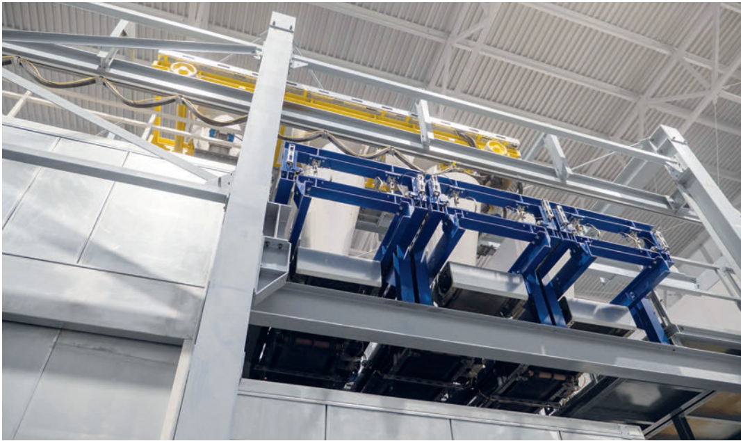
Masa Multi-color system with three silos