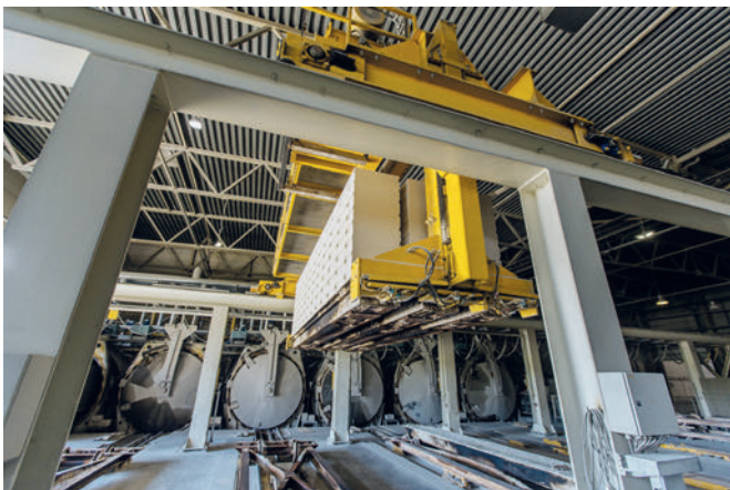
Impressions of the Masa AAC production plant

as concrete products – all from one supplier, Masa GmbH. For Porevit, this was a deliberate decision: In the long-standing business relationship, Masa has proven to be a reliable and honest partner who is highly respected in the Siberian region. Of course, the high level of technical solutions offered by Masa was a key factor when deciding who to partner with for these projects. The Porevit plants are among the most modern facilities in the Ural region, as well as the entire CIS.