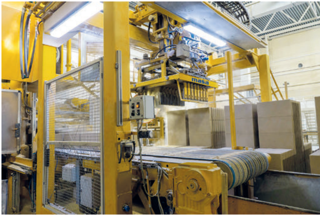
Production of sand lime bricks with the Masa hydraulic press HDP 800