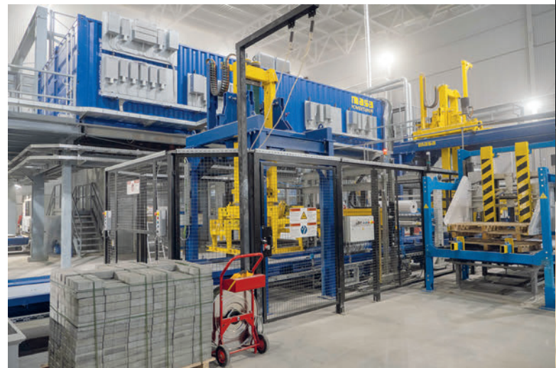
Dry side, cubing area and Masa Powertainer