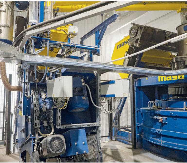
The mixing area includes a Masa mixer S 350/500 (left) for face mix concrete and a Masa mixer PH 1500/2250 for main mix concrete

by 20° so that the mixing process is separated from the transport of the mix. This prevents cement and color balling and achieves a very good homogenization of colored concrete, even with fine aggregates and small batches. With the face mix concrete mixer, an output between approximately 120 l and 350 l can be achieved per mixing cycle.