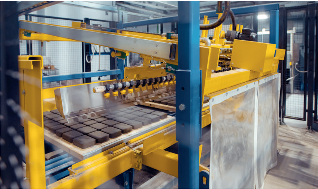
Masa wet side paver washing unit