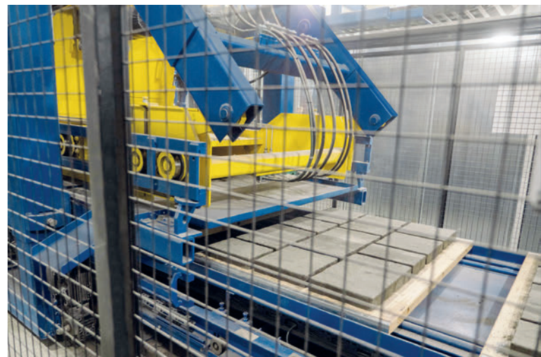
Masa concrete block making machine XL 9.1