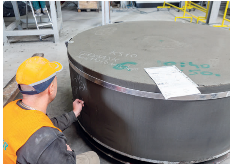
The green base unit is further processed after only 2 hours of curing

the two machines in the autumn/winter of 2020 included the appropriate software for technical sales to enter specifications of customer orders and transfer the data records to production.