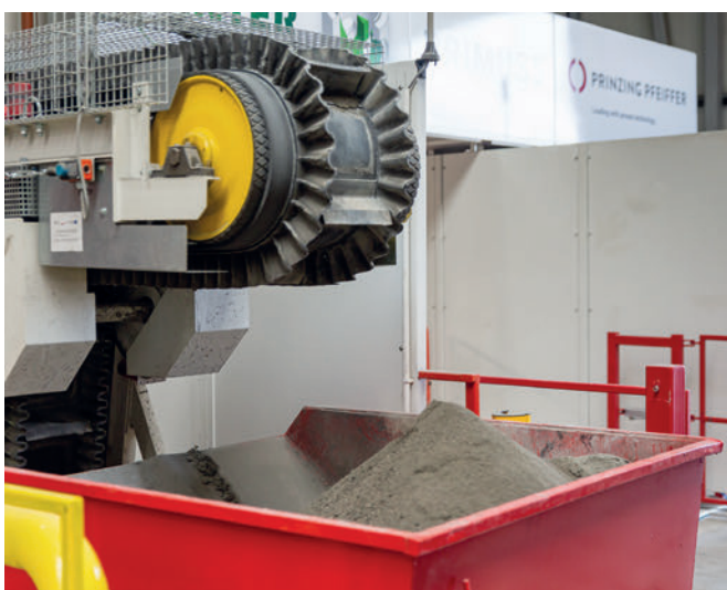
The residual material after milling is conveyed up and can be used again in production