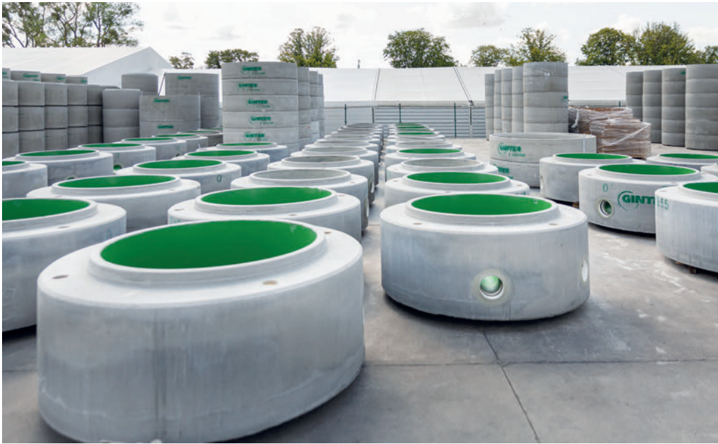
View over the outdoor storage area

The machining process on the Primuss takes between 20 and 40 minutes, depending on the dimensions of the respective product. The machine does not need to be operated during this time.