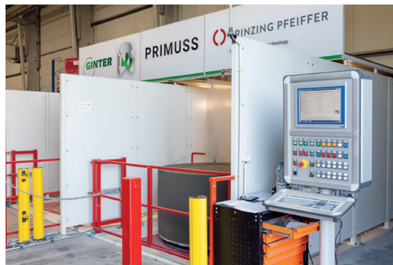
Control panel of the Primuss