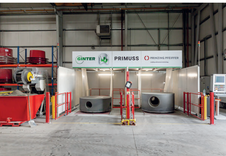
Processing station of the Primuss

With the dry cast process, several products can be produced per day with only one mould. So if the manufacturer is faced with increased demand, it does not have to invest in more moulds, but only temporarily increase the production time. At Ginter, the product reaches the basic stability required for further processing after only 2 hours. This short waiting time between the Atlas and Primuss stations results in a fast process and high productivity. Currently, Ginter produces approximately 16 products in a 7.5-hour shift.