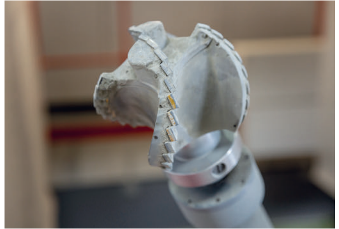
Concrete milling within millimetre accuracy with 2 different milling heads: for inlets and outlets on the left and for the channel on the right