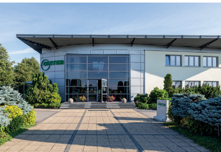
The headquarters of Ginter in Chojnice

Ginter has been planning for several years to expand the plant with new machinery in order to offer its customers all required precast concrete elements from one source. The situation in Poland has changed since the introduction of the EU standard for infrastructure projects in Poland, according to which the manhole base elements must be monolithic. Accordingly, the production of floor slabs and a subsequent installation of the manhole ring no longer complies with this standard. At that time, only the wet cast manhole bases, made with the aid of polystyrene inverts were installed on-site. As this process leads to both ongoing costs for the purchase of polystyrene blanks as well as a possible increased waste production, Ginter was looking for a suitable alternative that offered efficiency, sustainability and productivity. After a thorough decision-making process, in which the company talked to machine manufacturers as well as other producers in the industry, Ginter invested in a combination of Atlas and Primuss. The deciding factors were the many years of experience already gained with Prinzing Pfeiffer machinery, as well as the cost-effective and efficient production of individual products without follow-up costs. The delivery of