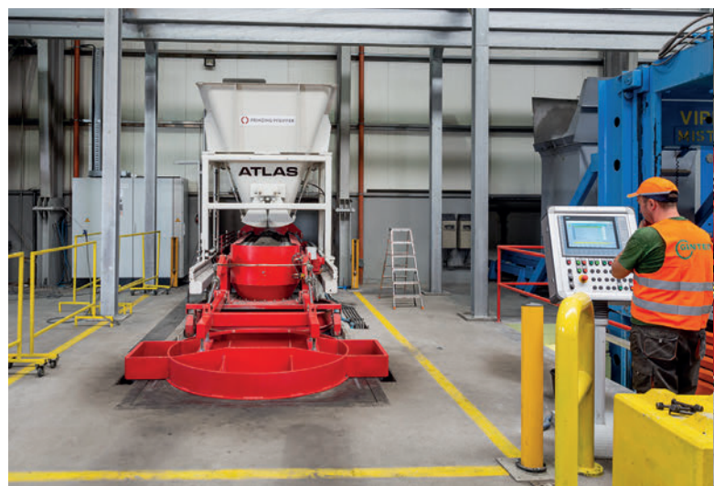
The Atlas - flexible manufacturing plant for the production of manhole products