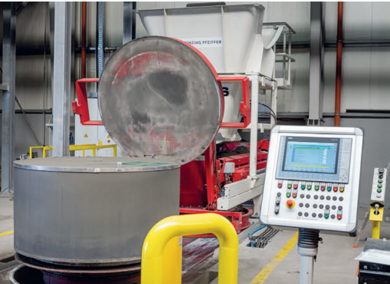
The fresh manhole base element (green base unit) after demoulding