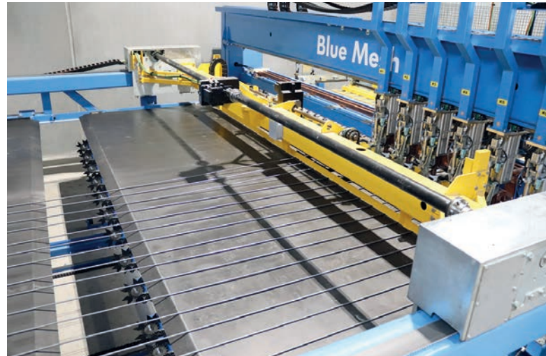
The mesh welding plant welds individual reinforcement meshes just-in-time.

equipped with five separate rotors for different wire diameters and guarantees constant straightening results due to the implemented rotor straightening technology. This means that the correct lengths and spacing of the bars can be precisely prefabricated with a wire diameter of up to 16 mm. The processed longitudinal and transverse bars are then transported fully automatically to the welding station. With the BlueMesh, the production of special meshes is also facilitated by the six flexibly movable welding heads. The required production data are taken from the structural engineer's software, i.e., the CAD data, on the basis of a bending list, prepared accordingly and transferred to the machine. The software required for this was supplied by Progress Software Development, also a Progress Group company. An automated mesh conveyor system including a traverse gripper and an automated stacking unit provides additional savings in heavy physical labour and a higher throughput speed.