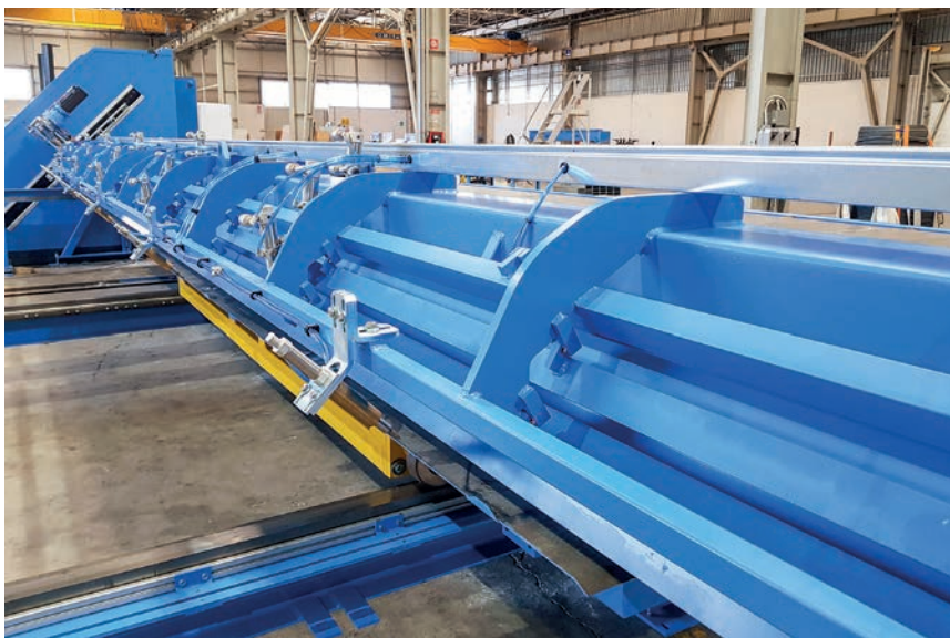
The outlet of the longitudinal bars with 2 outlet flaps and 10 m length catches the cut bars and brings them into position for the likewise automated further transport to welding.

The M-System BlueMesh mesh welding plant from Progress Maschinen & Automation, a Progress Group company, works directly from the coil and can produce elements with or without recesses just-in-time and grid-free. Each production phase is assigned to a single workstation, so that the individual parts of the machine can operate independently of each other, thus guaranteeing a continuous flow of production. The integrated MSR straightening and cutting machine is