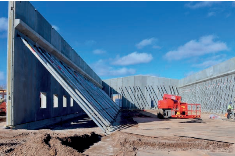
The construction of the hall and the installation of the machine could be finalised in the summer of 2021.