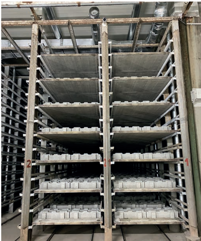
Blocks in the lower part of the rack and blocks in the upper part no longer show any differences in colour.

sors distributed in the chamber. Kraft's custom air curtain - on both the wet and dry sides - prevents warm and moist air from escaping the chamber. The unit is heated to prevent condensation.