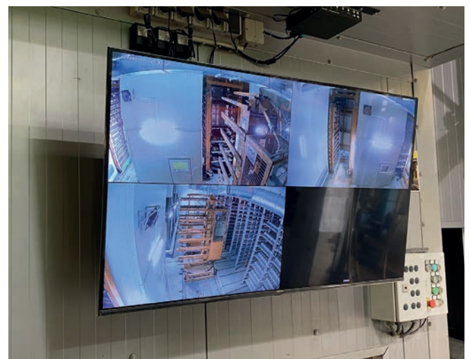
The processes in the camera-monitored curing chamber can be followed on a 55" screen.