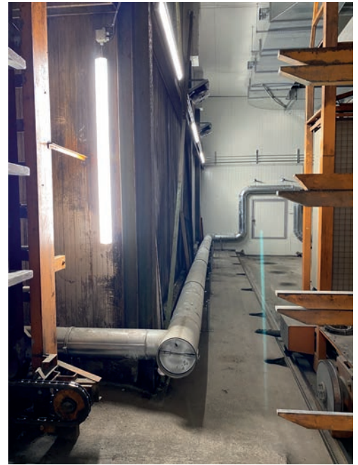
View inside the curing chamber with the Quadrix pipe systems on the ceiling and floor.