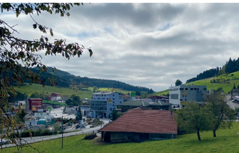
Surrounded by picturesque scenery, the headquarters of the Müller Steinag Group in Rickenbach in the canton of Lucerne.

Creabeton Baustoff AG offers complete solutions and high-quality Swiss products for building construction, underground construction and road construction, as well as for garden and landscape construction. The company's own fleet of vehicles and the various regional locations guarantee an excellent delivery service.