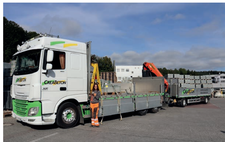
On-time delivery is guaranteed thanks to the modern transport fleet.