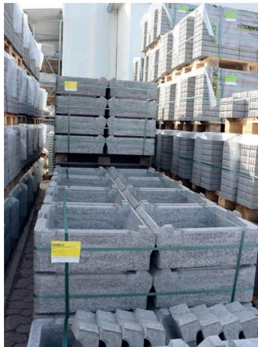
Filter plates and embankment stones made by Müller Steinag