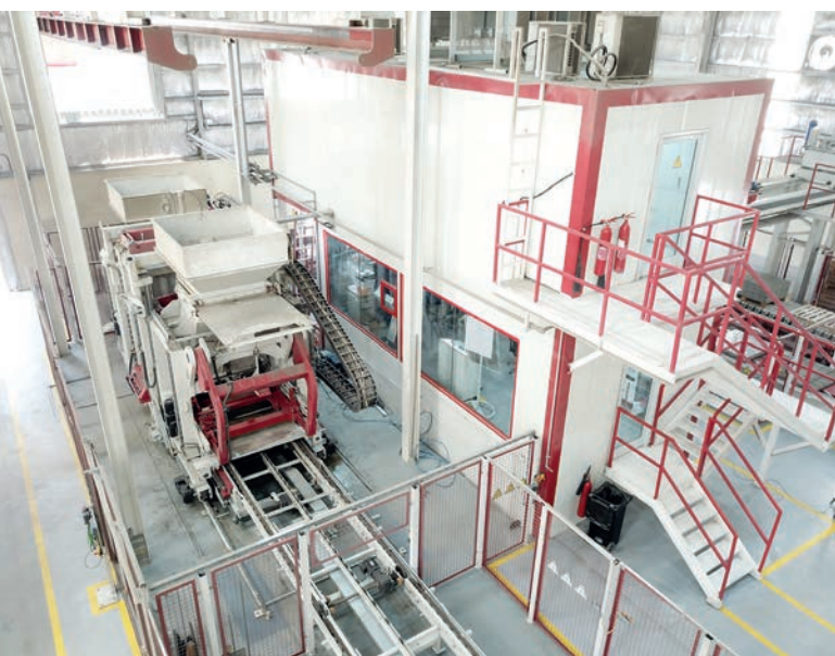
At the heart of the new production line is the Multimot RH 1500-4 concrete block machine.

The eastern region offers good sales opportunities, especially as the production capacities are lower compared to the region in and around Riyadh and the western provinces like Jeddah or Makkah. The region also provides the opportunity to export to the neighbouring countries like Qatar and Bahrain, which at a distance of approx. 200 km each lie within the delivery range.