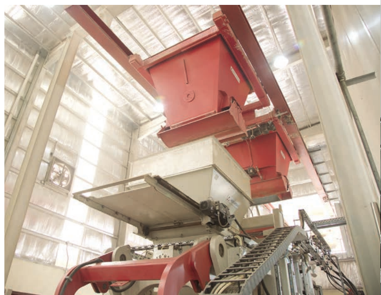
The double bucket conveyor transfers the core and facing concrete into the concrete block machine's corresponding storage silos.