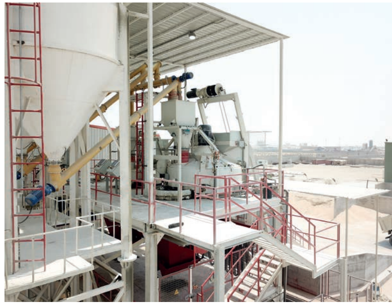
Two planetary mixers were selected for the concrete production: the large SX3750 for the core concrete and the smaller SX750 for the facing concrete.