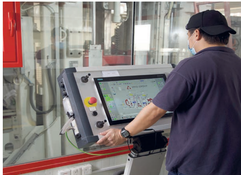
Like all concrete block machines produced by the Hess Group, the new unit at Artic is also equipped with an operating console.

It remains to be seen what the concrete block experts from Saudi Arabia will plan next, as standing still does not appear to be in the management's vocabulary. ■