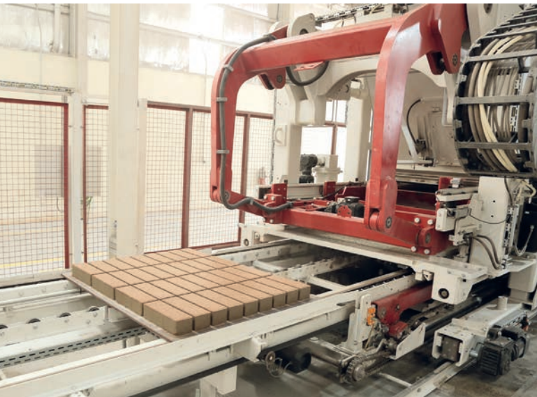
Production is done on 1,400 x 1,100 x 14 mm steel production boards.