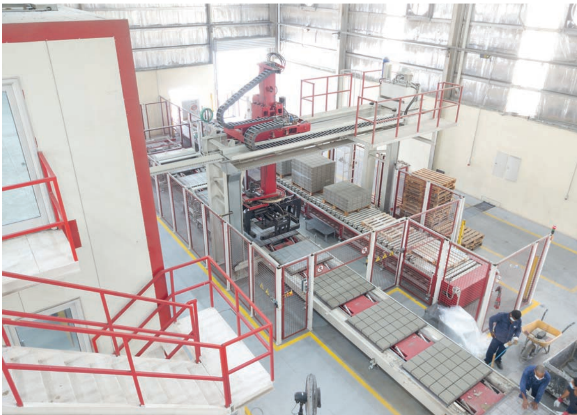
Servo 700 cubing system