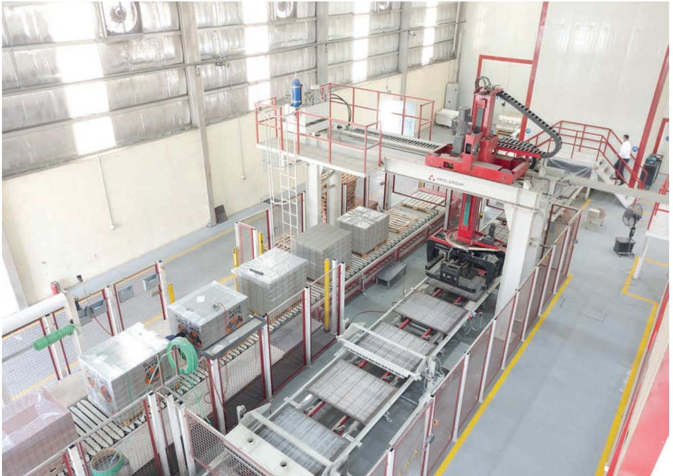
The packets of blocks are formed on the 28-m long slat conveyor arranged in parallel and then transported outdoors in cycles.