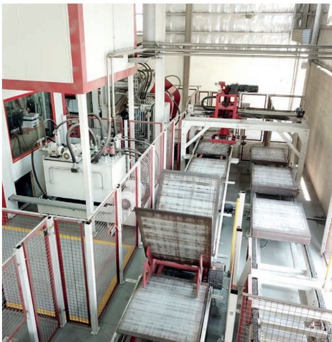
Cross conveyor with board turnover device and board buffer conveyor; in the background the magnetic stacking device