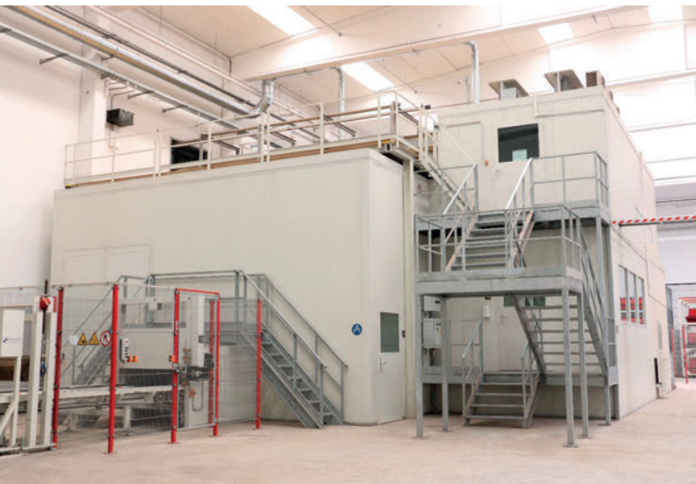
Machine sound-proof, control, and cabinet room

cleaned with a cross scraper and/or a rotating tamper head brush mounted on the filler box. If any coarse mix concrete material sticks to the tamper head, this will be removed and the facing layer will not be affected. These prevent material from sticking, ensuring that no concrete deposits can negatively affect product quality. The coarse mix silo has 2 outlets to enable dosing the concrete faster and more evenly in the filler box. The coarse mix part is movable to have better access to all machine parts for maintenance and cleaning.