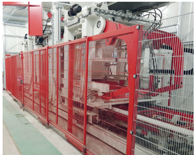
Concrete block machine RH 2000-3 MVA

The freshly made products are conveyed by a belt conveyor into the elevator. Each board with products is assigned an ID in the concrete block machine, which is tracked throughout