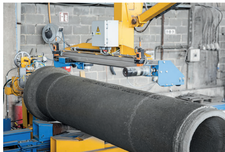
Marking of a tested concrete pipe with the pipe marking device.