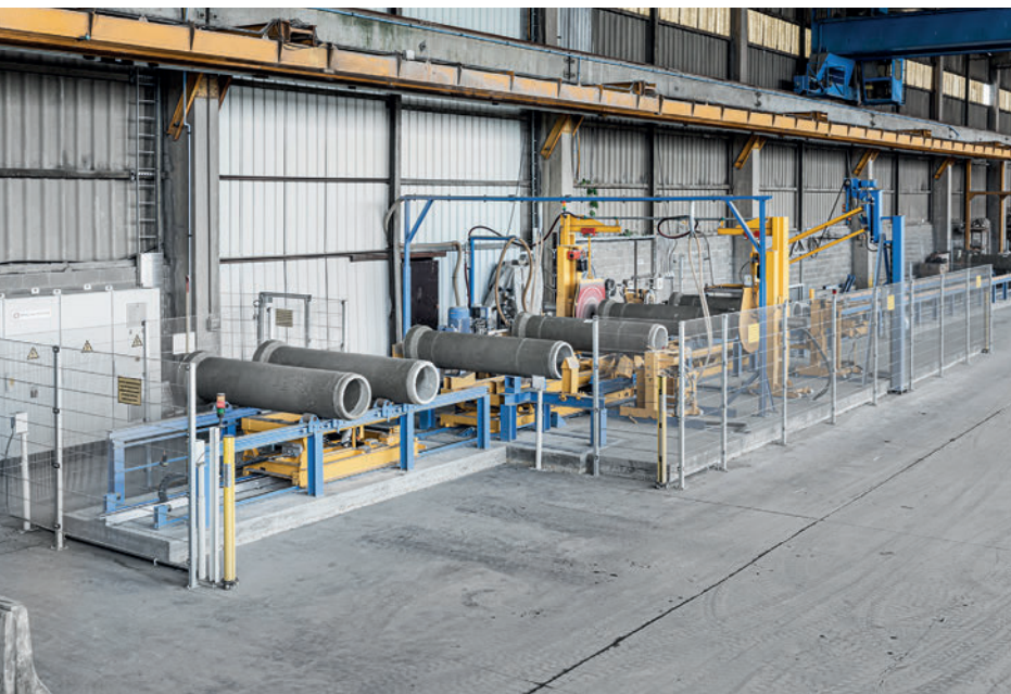
In Beton De Clercq in Gent, Belgium, another concrete plant relies on a pipe testing line from Prinzing Pfeiffer.