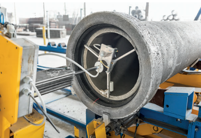
Spigot end, the integrated gasket and straightness measurement in the last station of the test line.

The deburred concrete pipes are fed to the vacuum testing device in the next cycle. Here, the pipes are sealed at both ends with pressed-on rubber mats and checked for