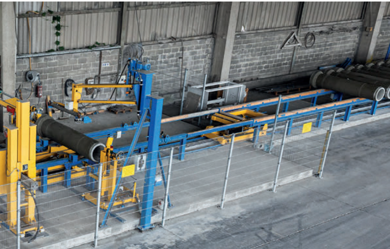
Numerous pipes can be buffered on the pipe deposition track after testing.