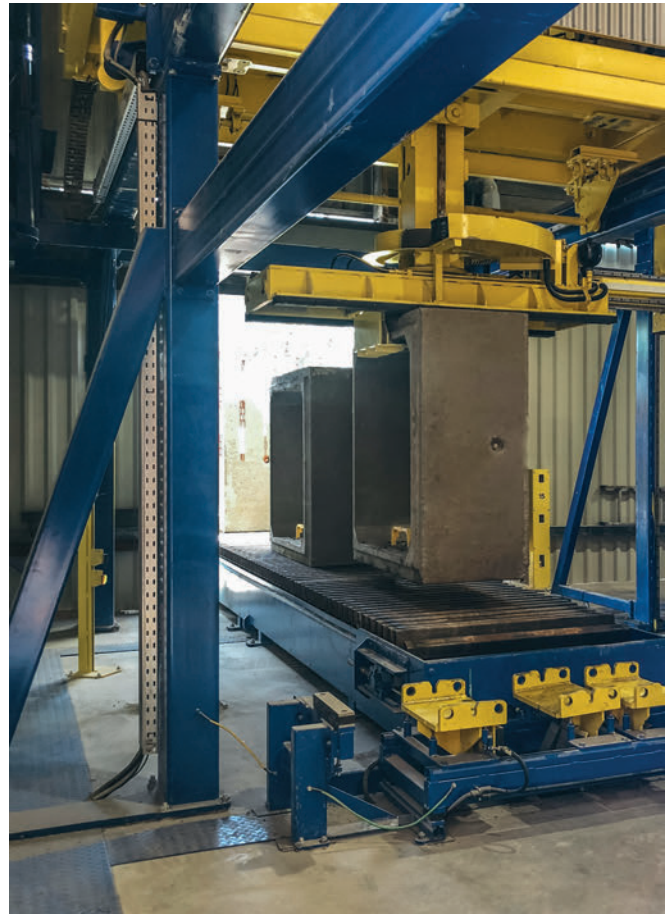
Product conveyor leading to the outside

Bessières said. “We believe CRP will be able to make even better use of peripheral equipment such as moulds and bottom pallets with two Magic systems and we will be able to change production from one machine to another, allowing us to react quickly to changing demand on the markets.”