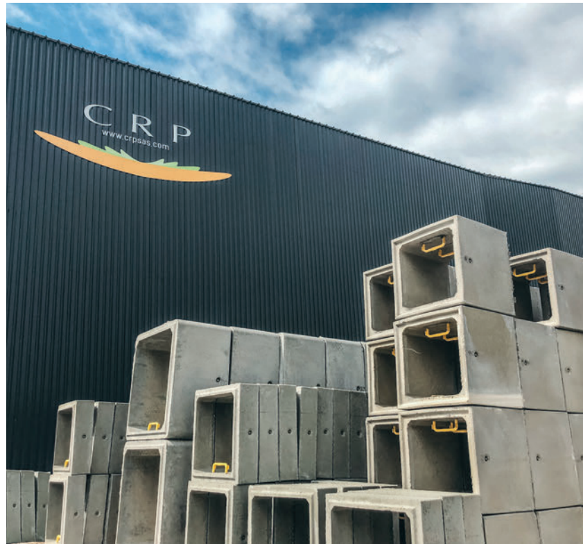
Warehouse for square products at the factory in Malemort

tween 2019 and 2022. I would like to take this opportunity to highlight and praise the major support from the European and French stimulus programs."