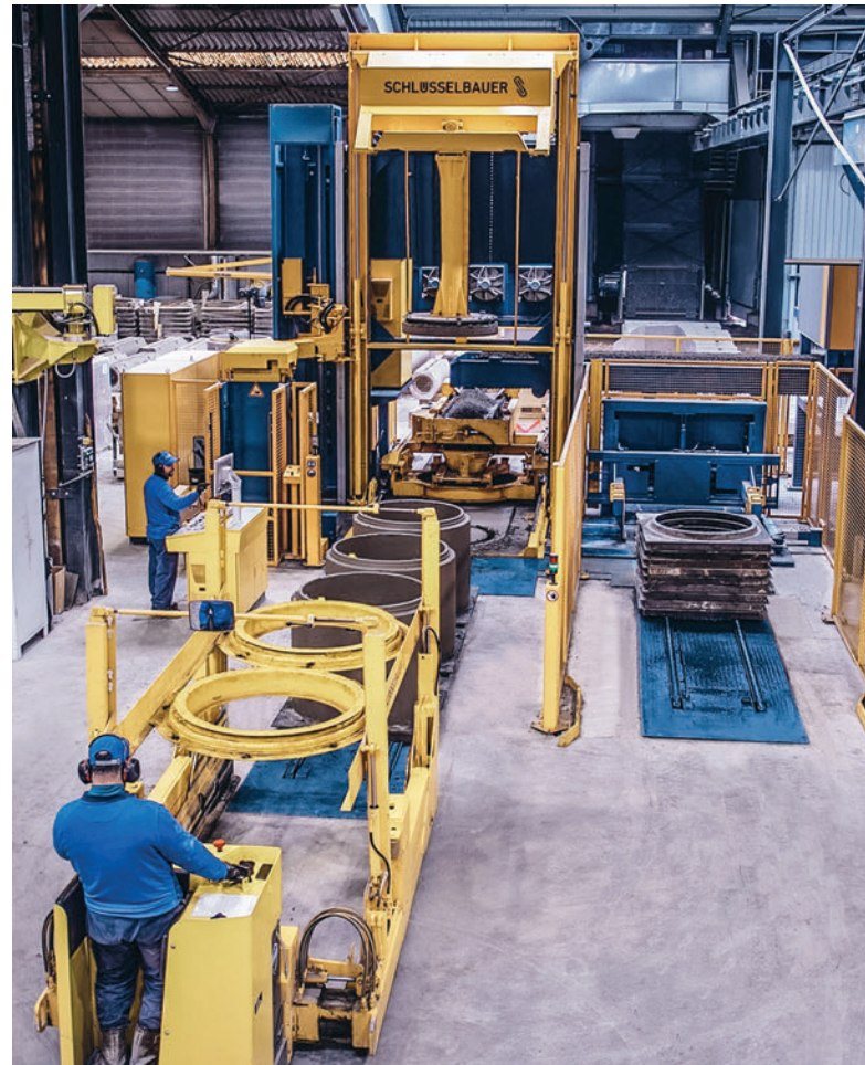
The Magic production system from Schlüsselbauer Technology in daily use

In France, safety is increasingly becoming an important maxim in plants and on construction sites, which is why transport anchors are now standard for all concrete products in France. It was therefore vitally important to CRP that the new system could automatically insert anchors during production, but without slowing down the rhythm of production. Additionally, dimensions of the concrete products are so varied such that multiple and different types of anchors are needed. Schlüsselbauer Technology reacted to this specific requirement by further developing their automatic anchor robot for