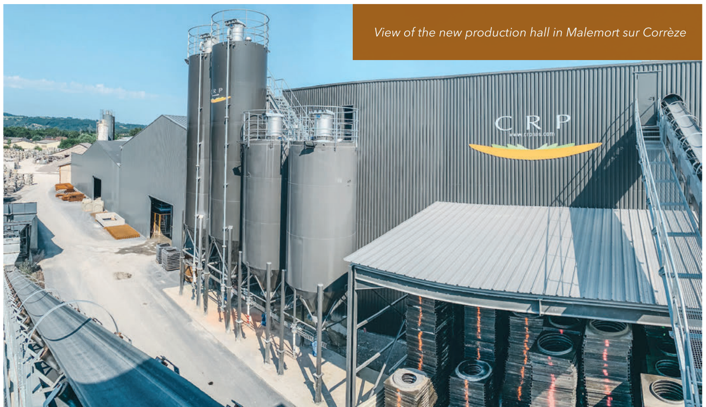
View of the new production hall in Malemort sur Corrèze

Over the past few years CRP, a family-owned company, has managed to turn what might be considered a rather tricky rural location, far from major cities and economic centres, into a benefit. The small regional town of Brive is at the intersection of two freeways that cross the country from north to south and from east to west. CRP has set up a logistics hub there and distributes its products in France and to parts of Belgium. This means that, unlike many other concrete product producers, CRP does not supply construction companies directly, but rather supplies a network of approximately 600 retailer warehouses, enabling it to “become the third largest French manufacturer of concrete products for public road construction and civil engineering in record time,” according to Jean-Marc Bessières.