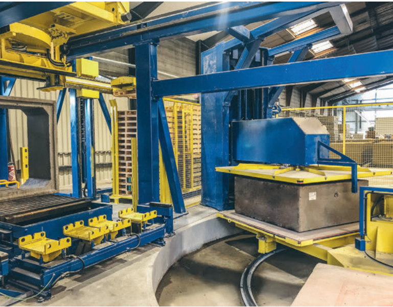
View of the palletizing carousel with corresponding testing station