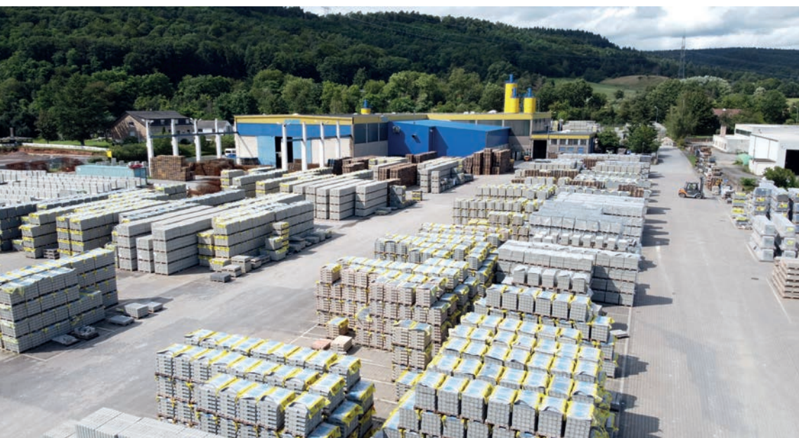
At Kann's Schweich site, pavers, kerbstones and angle blocks are manufactured and refined

For the above reasons, Kann decided to expand and retrofit the old chamber up to the latest technical standards. The specification included completely insulating the existing rack system with PU panels, introducing heat and humidity into the chamber and ensuring uniform air circulation. Having years of experience in such conversions, Kraft Curing Systems GmbH was commissioned by Kann with the project's implementation. The only time available for the installation was February 2021, which posed a great challenge for the technology supplier as well as for the customer. The conversion, including the dismantling of some old components, had to be organised with a correspondingly high number of assembly teams. In addition, the Corona-Virus problem, including local restrictions, complicated the course of the project. Contact between the individual teams was kept to a minimum.