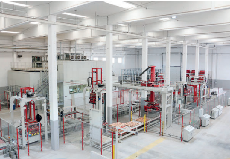
Packaging on the dry side at Siprem: product squeezer, doubler, and cuber