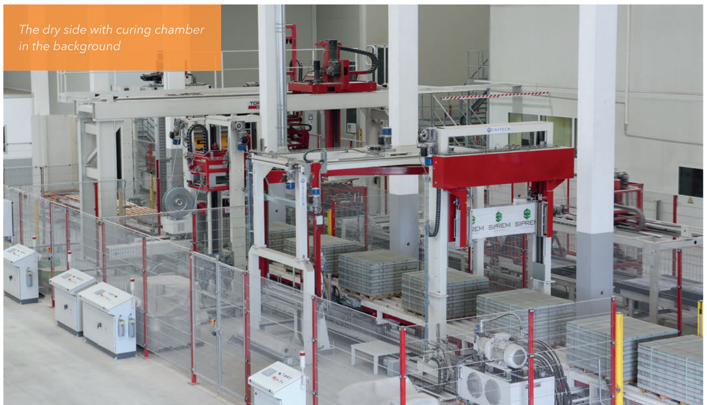
The dry side with curing chamber in the background

The overall plant design is aiming to increase the production efficiency and throughput volume while improving quality standards across a wide range of innovative products.