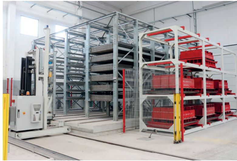
Board buffer finger car with turning device

The plant has been designed to always maintain high output. To achieve this, it is important to minimize unnecessary waiting times. This has also been considered in the packaging process. On the dry side, an electric block squeezer and a doubler have been installed before the cuber. One of the first newly designed fully electric Hess cubers with a gripper driven by linear cylinders was used at Siprem. The block squeezer and the block doubler are also driven completely electrically and are thus particularly energy-efficient compared to a hydraulic drive. The production and packaging times are therefore reduced to a minimum and the whole plant runs at an impressive speed without the quality of the products being penalized in any way.