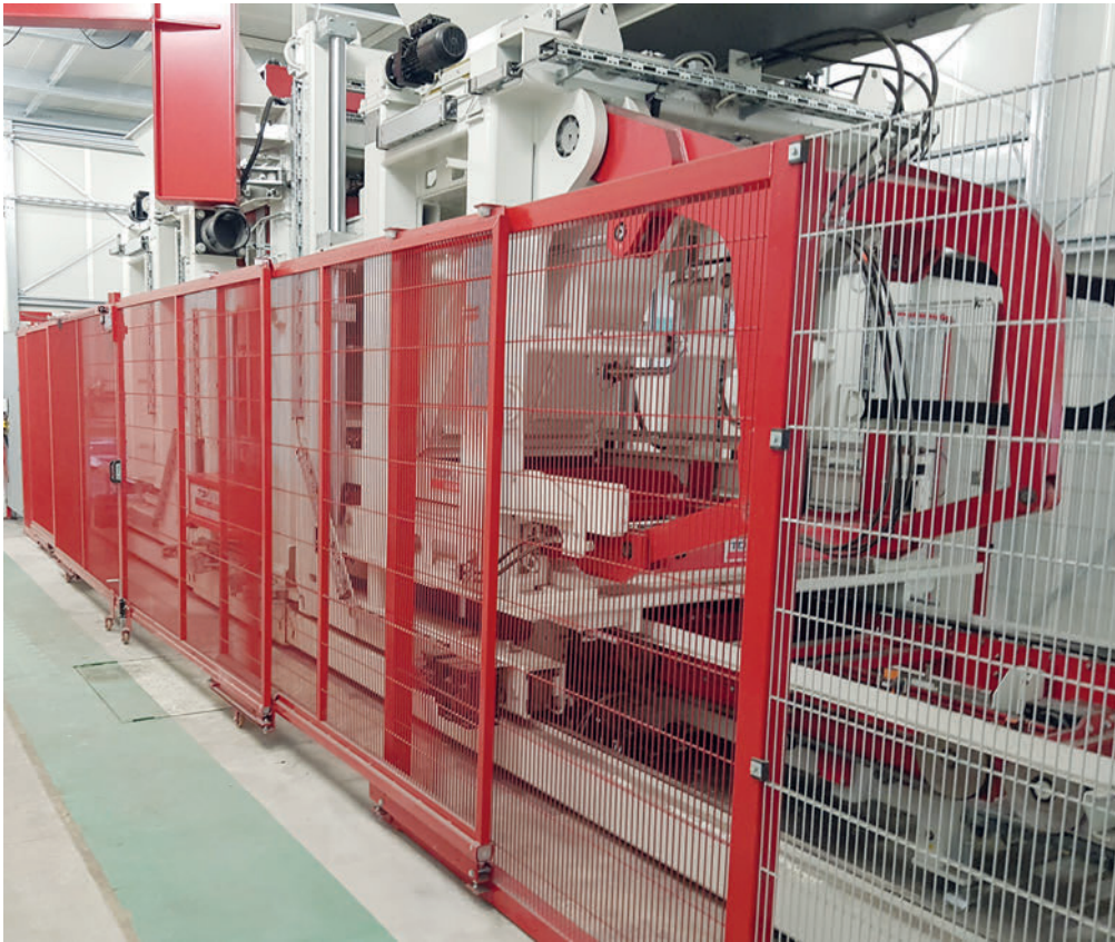
Concrete block machine RH.2000-3 MVA

fresh product to the curing chambers. The finger car from Hess Group is designed for twenty-two storeys with a load of 14 tons. The positioning of the finger car is controlled with a laser system for the upper and lower car units.