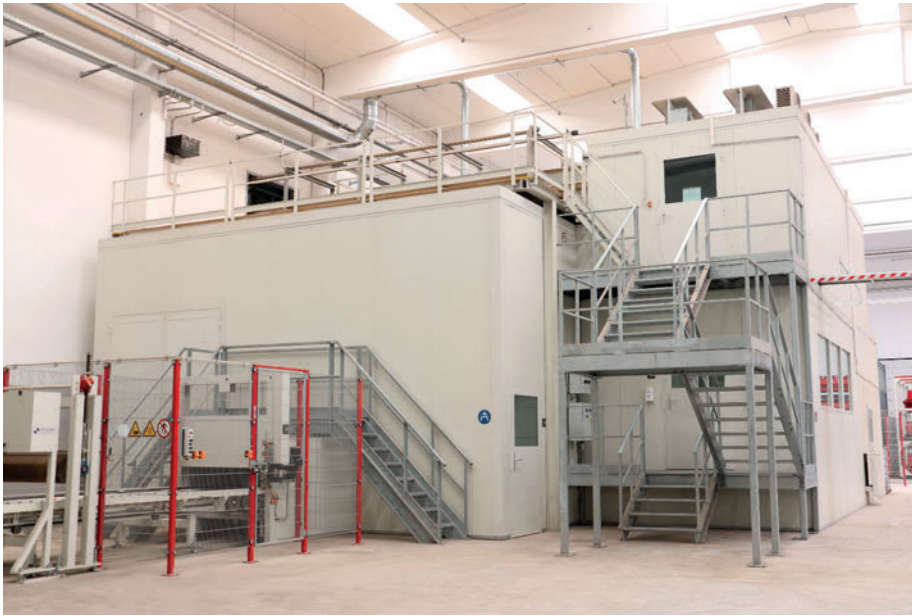
Machine sound-proof, control, and cabinet room

The high-performance hydraulics with the M-version (Multi axes control) is installed in the separate sound-proof room to reduce the noise and control the temperature. From the control room, the operators can control every aspect of the manufacturing process through touch screens and keyboards. The filler boxes are filled with concrete by an electromechanically driven silo flap, which are controlled by a laser level measurement system that ensures repeatable filling of the filler box. It is guided cleanly and with low vibration in forklift profiles using combination rollers and is equipped with a plastic/steel brush for cleaning the tamper head. The filler box is moved by a very stable double rocker arm, which is driven by two synchronized cylinders.