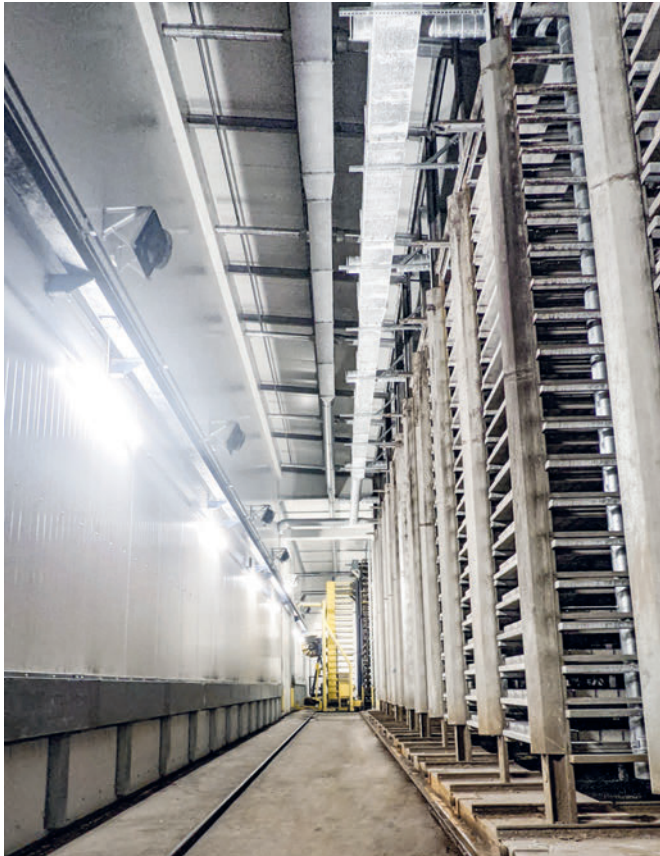
The transfer table aisle was also insulated; lights and fans were installed

Kann GmbH provided the Kraft Curing employees with their own common rooms and sanitary facilities. The cold temperatures in February made the installation even more difficult. Yet, thanks to the professional cooperation of the two project partners, the investment was successfully completed within the planned timeframe.