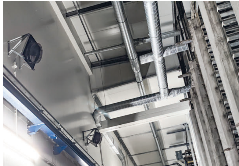
Internal ducts maintain the right climate inside the chamber