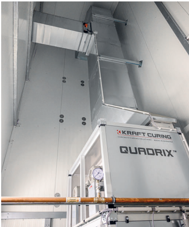
A technical room facilitates maintenance access