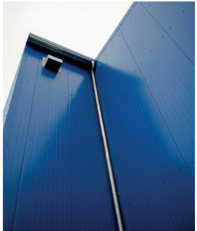
The customer's corporate design colour for the panels