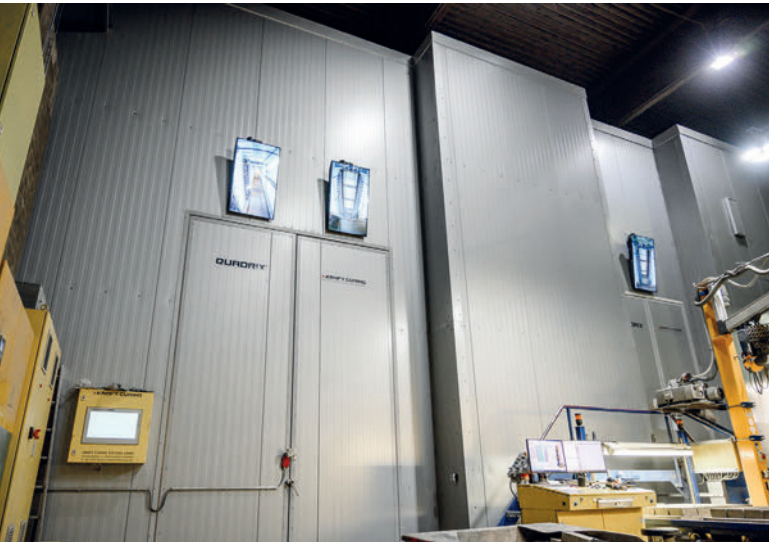
Elevators and lowerators are also completely enclosed in housing