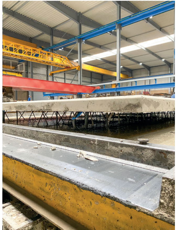
Precast concrete walls and slabs are reinforced with the manufactured lattice girders.

purchased after only a short time. In autumn 2021, a Wire Center for double wall production will be installed for additional reinforcement automation. The Wire Center lays the reinforcement according to CAD specifications, which results in an optimised process that increases production output and dimensional accuracy.