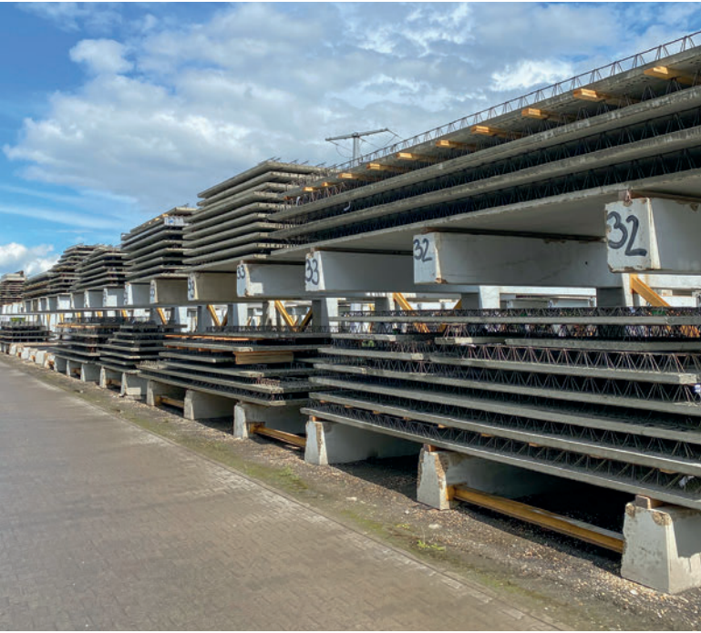
The produced double walls and precast slabs with in-situ topping ready for delivery to the customers.

gramming and service departments are an irreplaceable advantage. If something didn't work, no matter what it was, it only took a few hours and everything was fixed again. These points ultimately influenced the additional purchase decision - also for the Wire Center in 2021." ■