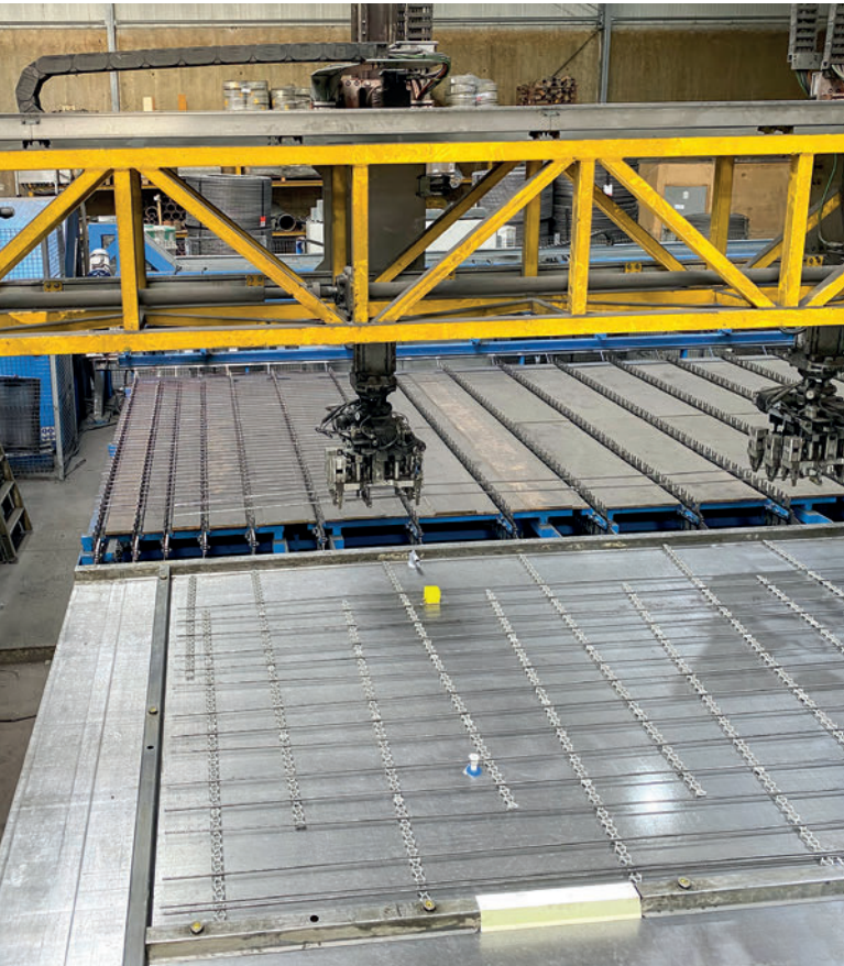
The 6-fold EPT laying grab works fully automatically according to CAD-CAM specifications.