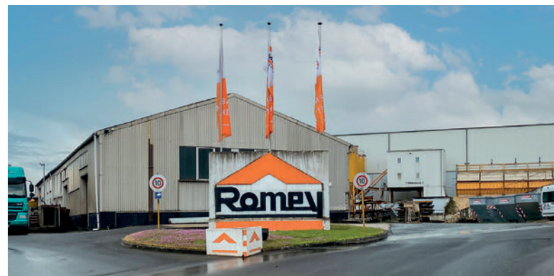
Romey Baustoffwerke headquarters in Plaidt, where it all began over 70 years ago.

Started in 1950 as a producer of masonry blocks and hollow core slabs with 10 employees in Plaidt, Romey Baustoffwerke GmbH is a well-known industry player in 2021 with around 240 employees in two production facilities and nine sales offices and continues to invest in the future. The company decided to invest repeatedly in innovative automated reinforcement plants from progress Maschinen & Automation, a Progress Group company, within a few years. This will increase the degree of automation of production at the Plaidt plant with a total of three carousel plants. The first two carousel plants were extended in quick succession with MSR cross-wire straightening and cutting machines and then VGA Versa lattice girder welding machines. A Wire Center will be added to the third carousel plant in 2021.