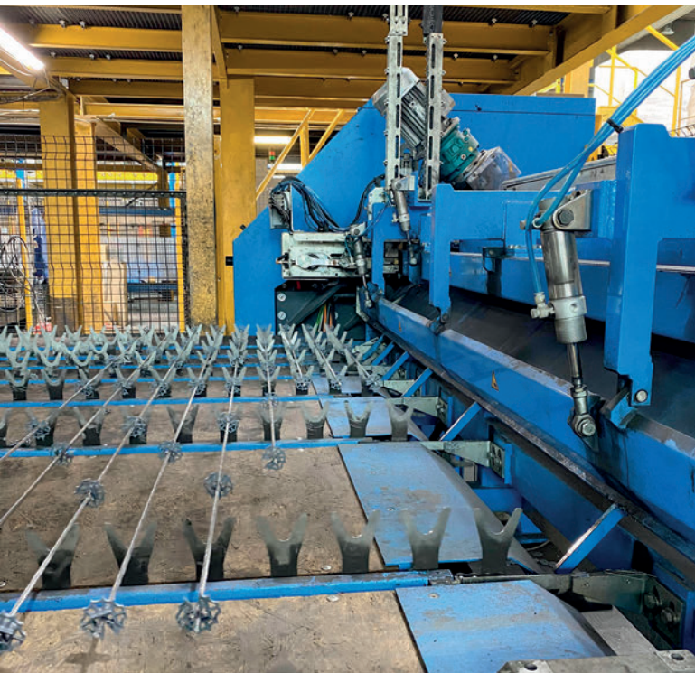
The MSR Multirotor straightening and cutting machine from Progress has an automatic wire diameter changer and is also equipped with an automatic spacer supply.

Flexibility was also the be-all and end-all for the lattice girder welding machines VGA Versa, which were additionally encased in a sound insulating cabin. Romey attaches great importance to pallet utilisation, which also means that the pallets sometimes have three to four different lattice girder heights. Here it is crucial that the girder height can be changed quickly, automatically and during ongoing production. The VGA Versa is a very good choice for these requirements, as it manages the height change fully automatically in a few seconds and can simultaneously weld the 5 wires of a lattice girder together continuously by means of resistance spot welding. This results in higher productivity and fulfils the objective for the new investment in the plant. Due to the positive experience gained, a second machine was