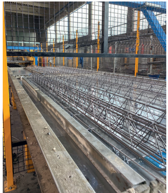
The new fully automatic VGA Versa lattice girder welding machines can switch automatically between girder heights in a very short time and during ongoing production.