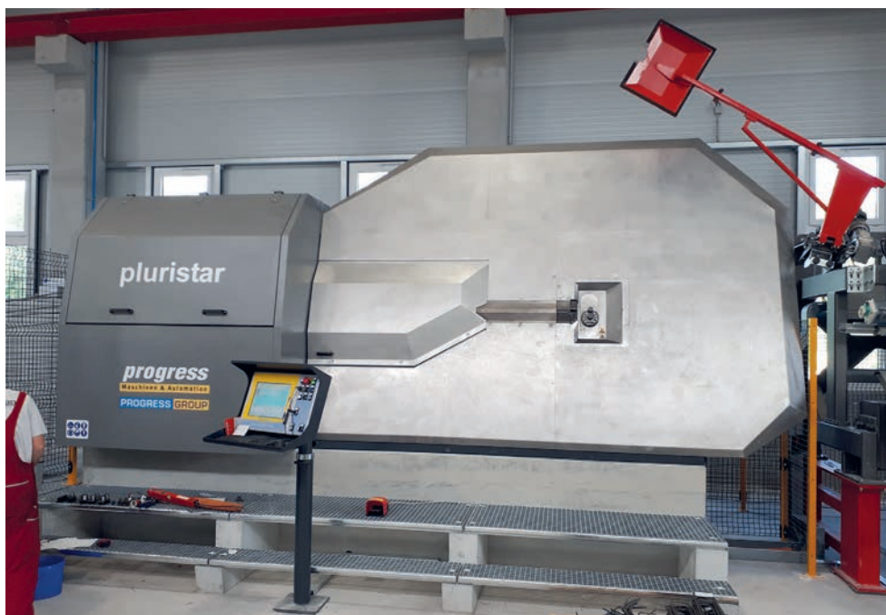
The Pluristar multifunction plant has an automatic changeover from double to single wire processing and an automatic straightening adjustment.

The automatically adjustable mould ramp for stairs with stair landing - model Ramp-Tec Plus offers an automatic variation of the slope of the ramp and the stair landing. With built-in