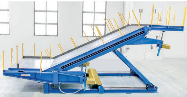
The new mould for staircases of the Ramp-Tec Plus model