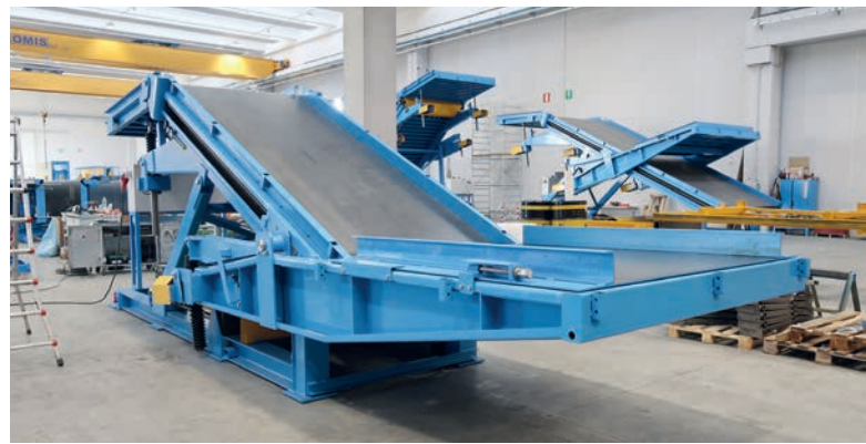
With the new machines from the Progress Group, the special prefabricated elements specialist is now well equipped for enquiries of all kinds.

cally. Some 50 reinforcement cages are produced per day on average. Depending on the order situation, a few more cages can be produced in the plant - 75 baskets in different sizes every day.