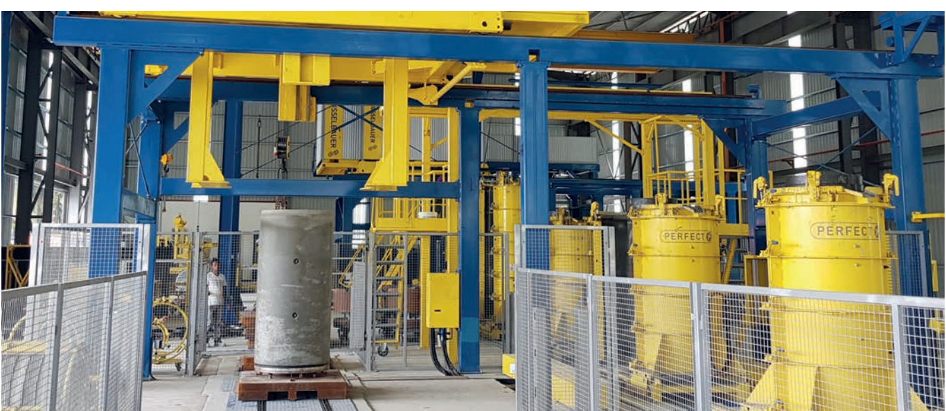
Automated production plant in Malaysia specializing in Perfect Jacking Pipe—a detailed report on this was published in CPI 2/2018.

The production of jacking pipes can be designed to be highly efficient in both cases—either as a specialized production exclusively for pipe jacking or as an additional feature alongside an established production process for mould-hardened products—with or without HDPE lining.