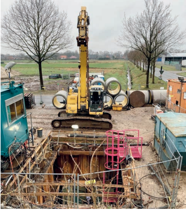
Typical Perfect Pipe construction site store (Haren, Deutschland). The first Perfect Pipe DN 1200 jacking pipes in Germany were installed here in 2021.