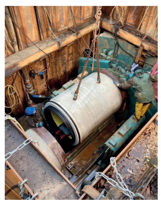
Space is usually at a premium in pipe jacking operations. This makes the Perfect Jacking Pipe even more advantageous, as a complete, corrosion-protected pipe system is created as soon as the next pipe is inserted.

on the market. Schlüsselbauer Technology has reacted and contributed to this trend by placing special focus on constantly developing and improving this type of mould. Pipes produced using a mould hardening process with consistent quality from the tip end to the joint have largely replaced dry-cast products for pipe jacking. And even when directly compared with other pipe materials, robust yet high-quality concrete pipes are increasingly preferred.