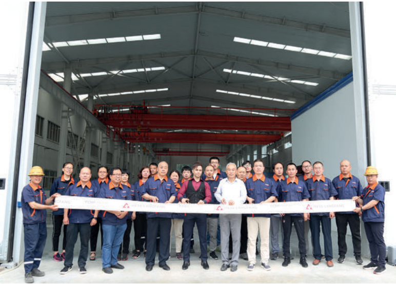
Grand opening of the new Hess Langfang facilities