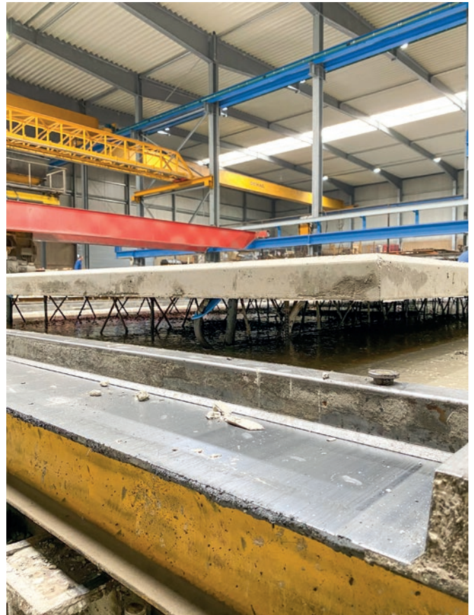
Precast concrete walls and slabs are reinforced with the manufactured lattice girders.

purchased after only a short time. In autumn 2021, a Wire Center for double wall production will be installed for additional reinforcement automation. The Wire Center lays the reinforcement according to CAD specifications, which results in an optimised process that increases production output and dimensional accuracy.