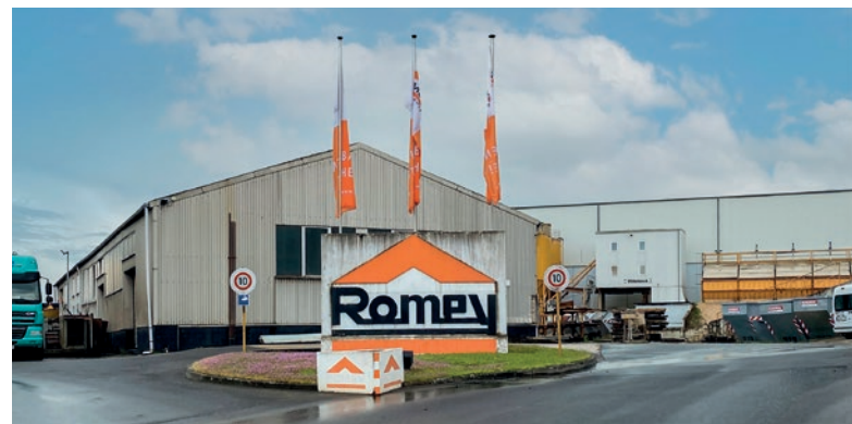
Romey Baustoffwerke headquarters in Plaidt, where it all began over 70 years ago.

Started in 1950 as a producer of masonry blocks and hollow core slabs with 10 employees in Plaidt, Romey Baustoffwerke GmbH is a well-known industry player in 2021 with around 240 employees in two production facilities and nine sales offices and continues to invest in the future. The company decided to invest repeatedly in innovative automated reinforcement plants from progress Maschinen & Automation, a Progress Group company, within a few years. This will increase the degree of automation of production at the Plaidt plant with a total of three carousel plants. The first two carousel plants were extended in quick succession with MSR cross-wire straightening and cutting machines and then VGA Versa lattice girder welding machines. A Wire Center will be added to the third carousel plant in 2021.