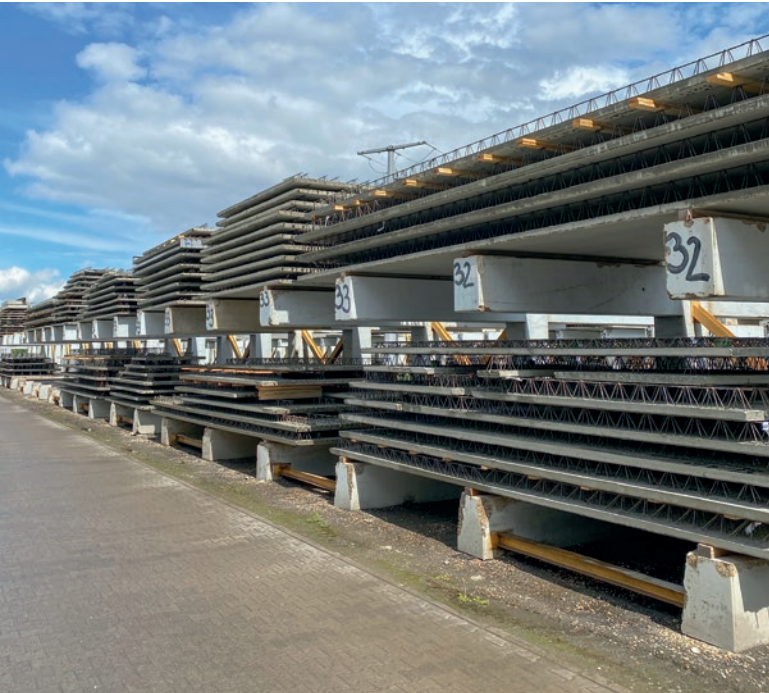
The produced double walls and precast slabs with in-situ topping ready for delivery to the customers.

gramming and service departments are an irreplaceable advantage. If something didn't work, no matter what it was, it only took a few hours and everything was fixed again. These points ultimately influenced the additional purchase decision - also for the Wire Center in 2021." ■