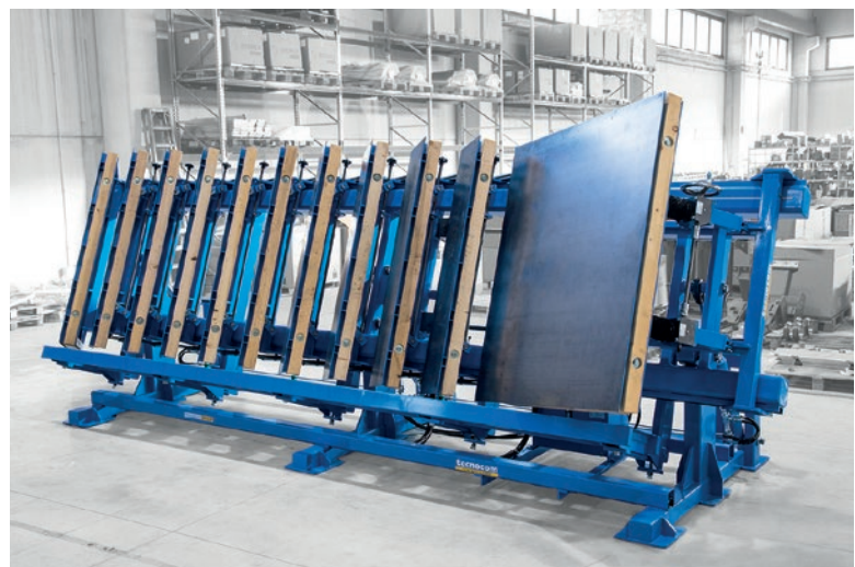
The custom-built staircase mould system model HT-Tec Plus is a tilting staircase mould with 10 steps, with which individual staircase models can be produced in easily.