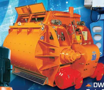
▲ DWM Twin-Shaft Mixer