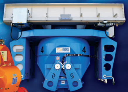
▲ Flying Bucket Transport