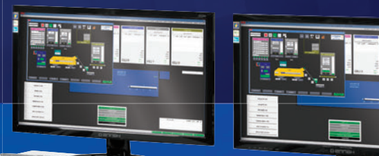
▼ WCS Wiggert Control System