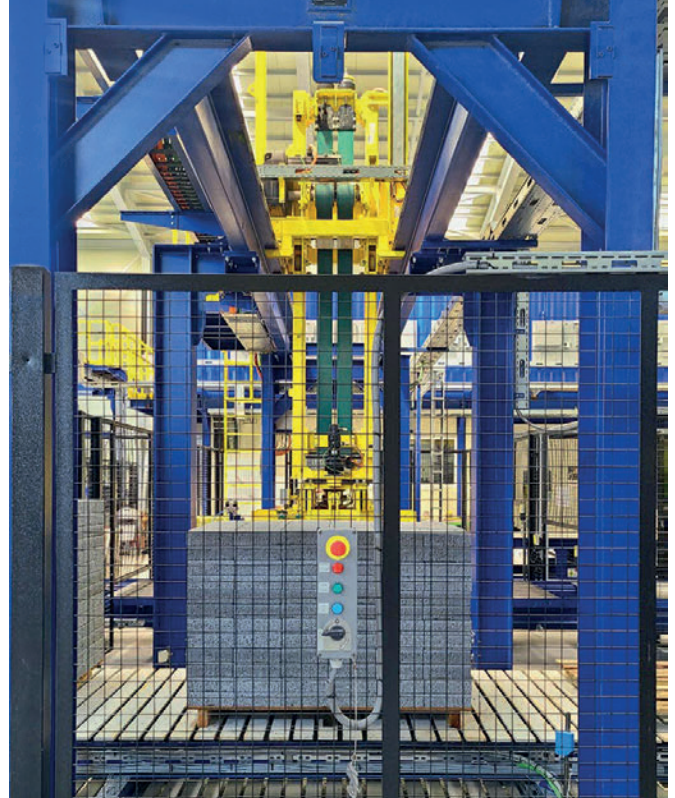
Accurate cubes: The fully electric cubing system is known for sensitive handling of concrete products.