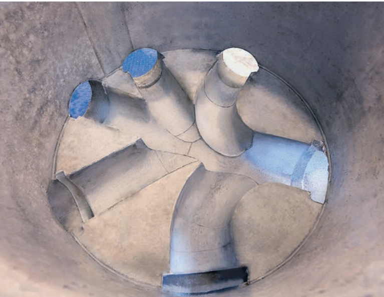
Precise production of manhole bases with channels and pipe connections