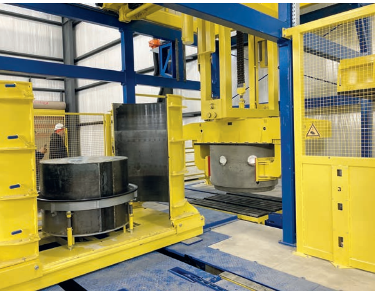
Automated manhole base demoulding with optimized cycle time

Next, openings are drilled at the relevant points for the subsequent pipe connections. Finally, if absolutely necessary, a channel is manufactured by hand to match the flow of the pipe connections, and it includes making a surface inside the manhole to stand on. This labor intensive process is normally conducted over several production days and it's very costly. In using this process, there is an extremely high probability of producing faulty parts or of making mistakes, due to the repetitive nature of the work and the physical strength it takes to carry it out.