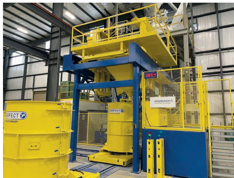
By setting up moulds based on the division of labor, moulds are constantly made available for filling with SCC.

The production of manhole bases with built-in channels is one of the most labor-intensive areas in precast plants. Traditionally, these components are frequently produced in two or three steps. In the first step, blanks are produced.