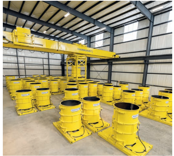
Reduction of costs and risks through automated mould management in the hardening area

pany and Schlüsselbauer Technology, an Austrian provider, together many years ago in an initial investment project. This project involved the installation of Schlüsselbauer’s Magic 1500, a dry-cast manhole production system with fully automatic product and pallet handling. Since its installation, the Magic 1500 has manufactured over one million manhole risers, cones, and cover plates, leaving Foley extremely satisfied with their first collaboration with Schlüsselbauer. In the company’s latest project to modernize their manhole base production, Foley was yet again ambitious from the start. It wasn’t just the complex production of manhole bases with berms or channels that was to be overhauled; in blank production, they also wanted to improve processes and completely replace individual work steps with new technologies. Foley had two criteria that had to be fulfilled by a suitable provider for their new production system. First, they wanted a technology partner who had substantial experience with high-volume wet-cast systems which require minimal manpower; and second, the perfect partner had to be able to offer a system for the manufacturing of custom-made channels with a profitable balance of raw materials.