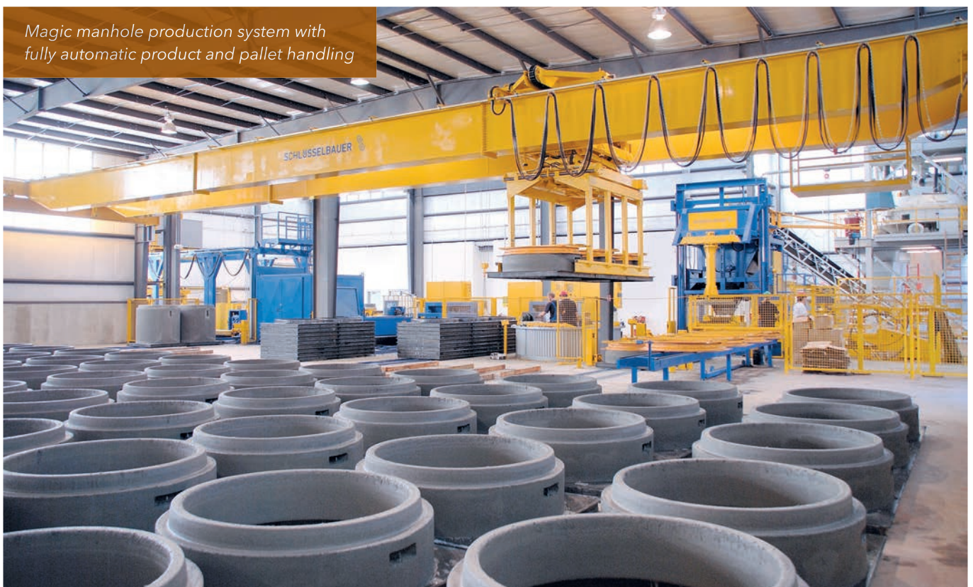
Magic manhole production system with fully automatic product and pallet handling

Products included in the production preview are reliably ready for delivery at the planned time and they are consistently made with high quality. Fluctuations in demand can of course also be used in the future to produce stock goods. However, demand-synchronized production in the Perfect manhole base system tends to reduce the quantity of precast parts produced in stock. This results in reduced capital costs with increased reliability of parts availability compared with the build-up of stock that historically occurred.