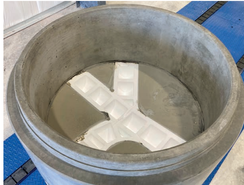
Efficient production of monolithic concrete manhole bases

ties, the manager responsible for meeting the planned production quantities can also control the production productivity for a longer period of time as a result. Manhole bases with a channel or berm, and blanks, are now manufactured at Foley in one procedure. Thanks to the Perfect planning software, neither complex channel formations nor different pipe connections in blanks pose a problem to plan their completion, since downstream work steps such as drilling connections or manual channel installation are no longer required.