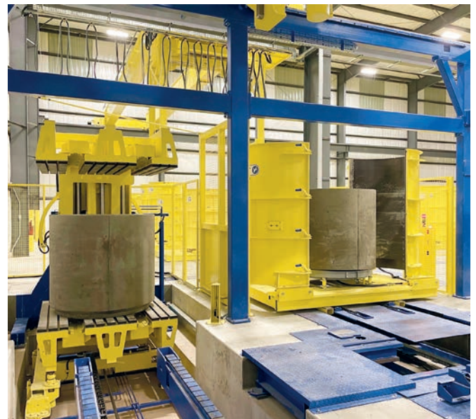
When required, demoulded products are automatically and carefully rotated by 180 degrees.

Through the installation of Schlüsselbauer's Perfect System, Foley has overcome the drawbacks and risks that conventional production poses. With Perfect, employees in the company's manhole base production are extensively supported by technology, and this support begins with the collection