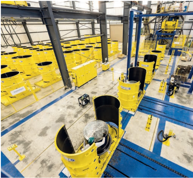
User-friendly moulds and scheduled processes—two cornerstones for efficient precast part manufacturing at Foley