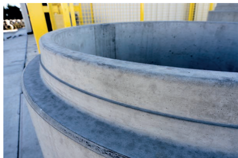
Outstanding component quality thanks to the use of self-compacting concrete