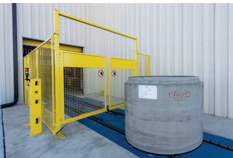
Manhole bases are transferred from the production hall with individual labels attached.

Scheduling the required work steps one manhole base at a time is not just advantageous, due to the clear responsibili-