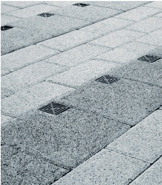
The Aqua Core Block: A high quality concrete block with differentiated water permeability and non-slip properties.

By cooperating with a German company, Decopave embarked on another path towards the environmentally friendly capital. In 2018, an initial test area with paving stones was laid in Seoul, to which a special concrete additive was added during production. When exposed to light, a photocatalytic reaction is triggered on the paving stone surface, which converts toxic nitrogen oxides (NO x ) from the air into non-toxic nitrate. Mr. Park likes to compare the positive effect with ginko trees, which are traditionally planted in Seoul to improve air quality: "In relation to a paved area of 1 m 2 , the air purifying power of our product can be compared to that of nine ginko trees. With the help of rain and the sun, the air can be cleaned even overnight."