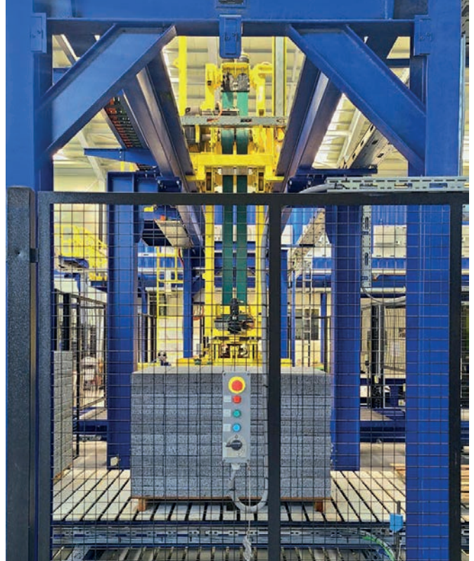
Accurate cubes: The fully electric cubing system is known for sensitive handling of concrete products.