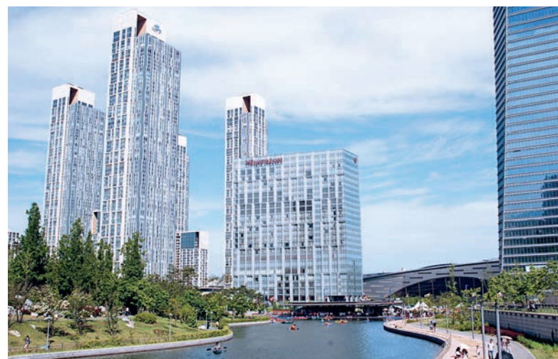
"Smart City" Songdo: A showcase project that attracted a lot of international attention.