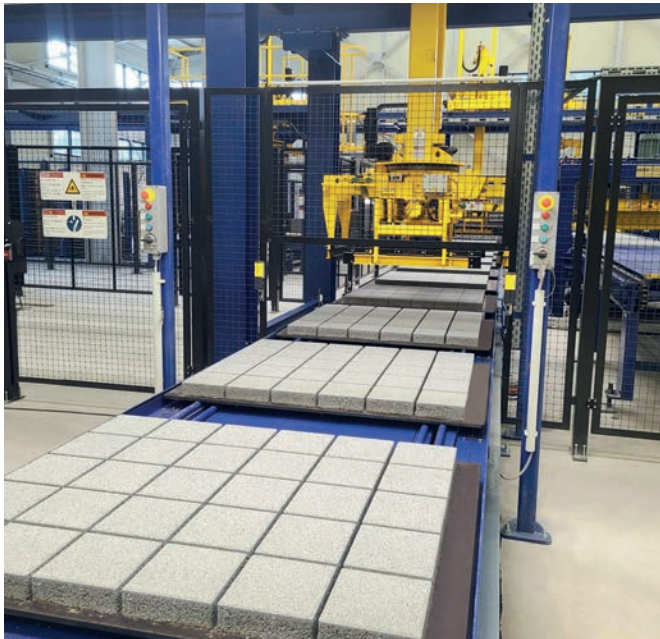
High-quality products on their way to further processing.