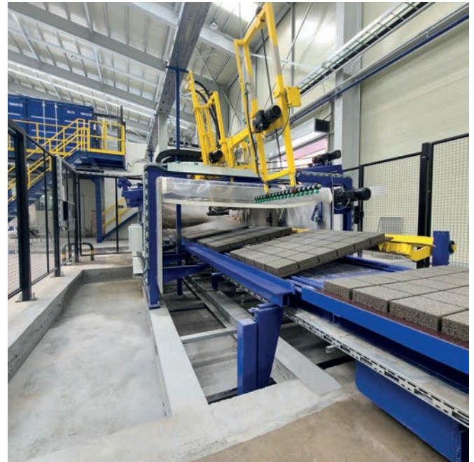
Masa 3-station washing plant: Fine fractions of the aggregates and the cement films are removed by a combined spray and surge process.

onto the cube transport. This solution provides Decopave with the required time buffer and reduces the need to refill the transport pallets accordingly.