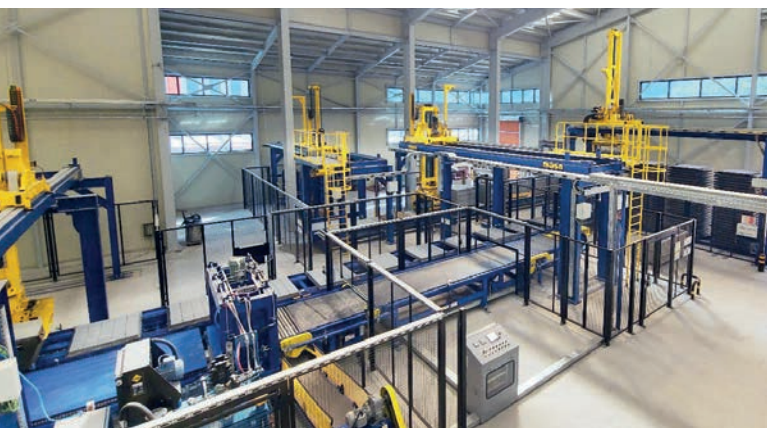
A short glimpse: Dry side, cubing area and cross transport.

Decopave cubes the end products on transport pallets. Since the highest possible degree of automation should also be achieved at this point, the system layout provides for an extensive transport pallet storage system with a grab. The component in portal design has a movable lifting / lowering device with pneumatically driven clamps to hold the transport pallets. The drive of the running gear and lifting unit is done by frequency-controlled gear motors. Starting from three positioning stations, the grab places the transport pallet directly