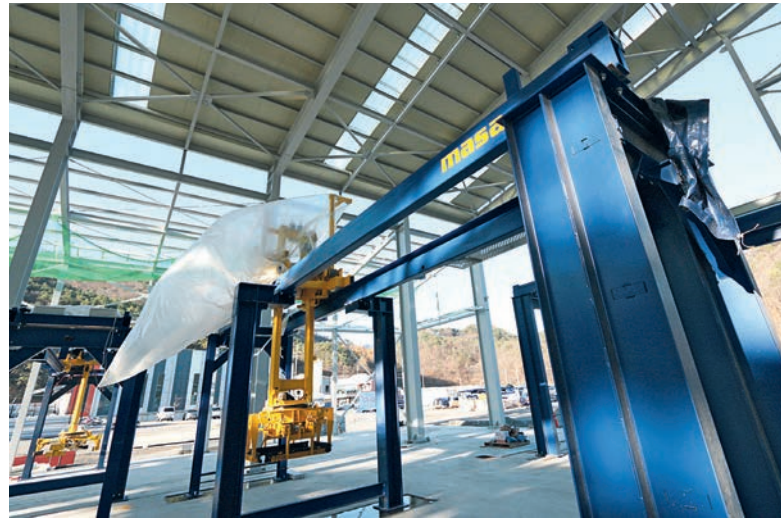
The new plant in Danyang is taking shape step by step.

At Decopave, the oscillating grate drive usually used in the main mix concrete filling box has been replaced by a hydraulic eccentric drive. This eliminates the pressure peaks that arise when switching over a conventional hydraulic cylinder. The oscillating grate is driven by a hydraulic motor. This is regulated by a proportional valve, whereby the speed can be set variably. The rotary movement of the motor is converted into a linear movement due to an eccentric connection with