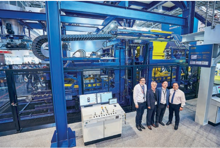
The Masa concrete block making machine XL-R: During the world's leading trade fair bauma 2019 in Munich, the partnership with Masa was symbolically sealed.

The effective use of energy is very important to Masa. Therefore, energy-efficient drive concepts are implemented in the XL-R, which are based on an intelligent converter network (vibrators, servo- production pallet feed, and lowering device with V-belt conveyor).