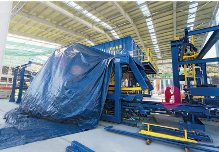
Shrouded: The new Masa XL-R concrete block making machine awaits commissioning.