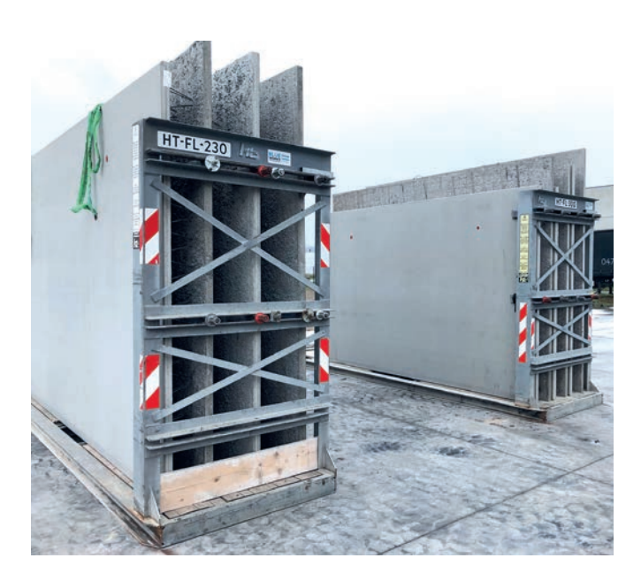
Double walls prepared for the transport to the building site.

Thanks to the new production plant from the Progress Group, the Belgian company is able to make its product range more flexible. They are now producing a higher number of finished products with high quality standards and less manpower.