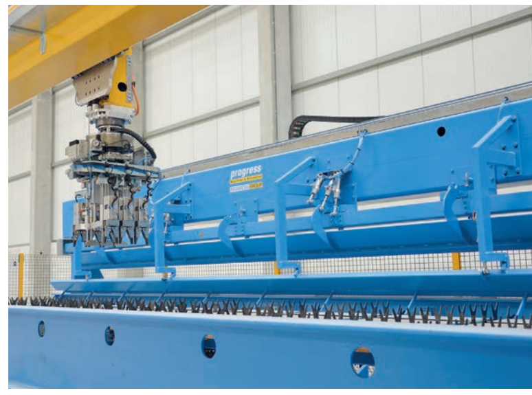
The Wire Center places reinforcement fully automatically and improves production output.