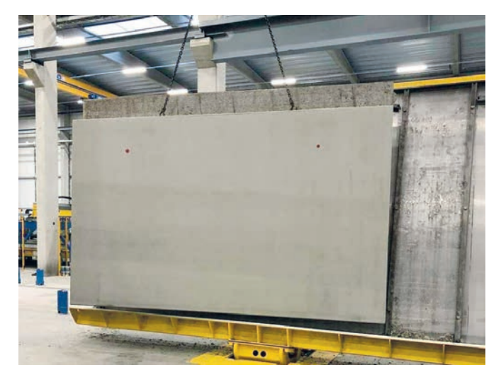
Production of first double walls.