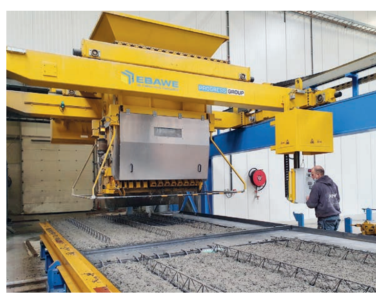
The concrete spreader distributes the fresh concrete into the shuttered pallets, with the made to measure reinforcement already in place.

gressed well. Mr. Zyde provides project support for the construction of the new location to produce precast concrete elements in Aalst. The assignment consisted of the selection of the various suppliers and contractors, the preparation of the works, the follow-up of the works on the site, commissioning, and start-up of the entire company. The new production site is working very hard to have a short line, being able to react quickly and producing standard products for the construction market. They supply from small contractors, which are building small apartments, to main contractors on the biggest level, which are doing office buildings or parking garages.