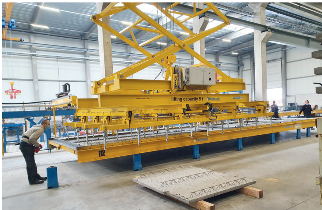
The demoulding crane provides a safe removal of the elements.

cast element production. The workflow has been optimized through a thorough planning of all the product flow in the plant. Containing additionally a concrete spreader in bridge design with compacting equipment and interface to a fully automated mixing plant as well as a turning device with appropriate compacting equipment. The plant is also equipped with an automated pallet stacker in addition with a demoulding crane with demoulding traverse ensures a safe removal of the finished precast elements. An interesting feature of the demoulding crane is that not only lattice girder floors can be lifted as usual but also double walls both in horizontal and in vertical position. Although D-Beton is very keen of the manual quality control the automation of the plant is saving a lot of