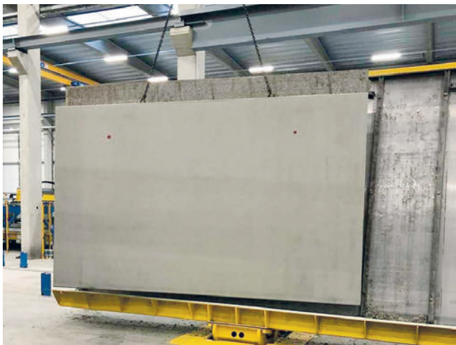
Production of first double walls.