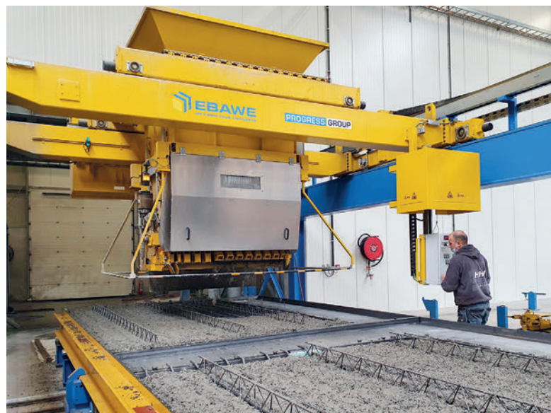
The concrete spreader distributes the fresh concrete into the shuttered pallets, with the made to measure reinforcement already in place.

is working very hard to have a short line, being able to react quickly and producing standard products for the construction market. They supply from small contractors, which are building small apartments, to main contractors on the biggest level, which are doing office buildings or parking garages.