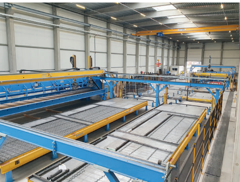
Extended view of the plant with the automatic wire processing units as well as the fully automatic shuttering robot including a pallet cleaning device.