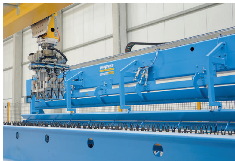
The Wire Center places reinforcement fully automatically and improves production output.