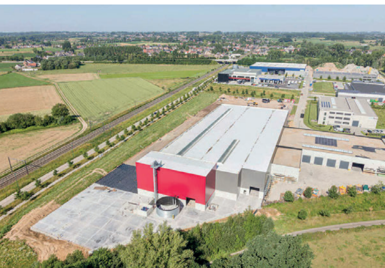
The new production facility in Aalst is fully operational for production and equipped with the latest technology.