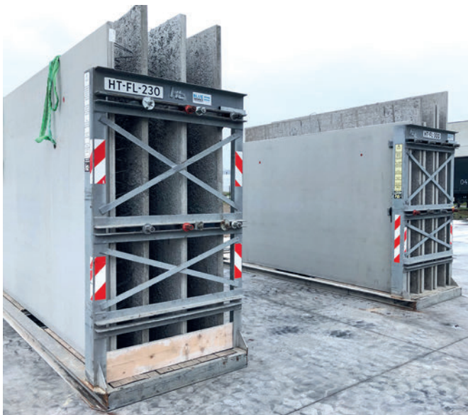
Double walls prepared for the transport to the building site.

can be easily collected and evaluated with the integrated st-abos-software. Thanks to the unique web interface the analyzing and reporting of the whole carousel plant can be done from everywhere.