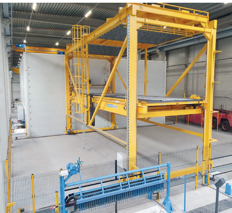
The pallet stacker for stacking and destacking of the pallets fully automated by ebos®

Benefit from our experience, flexibility and creativity – MEET THE BETTER IDEAS!