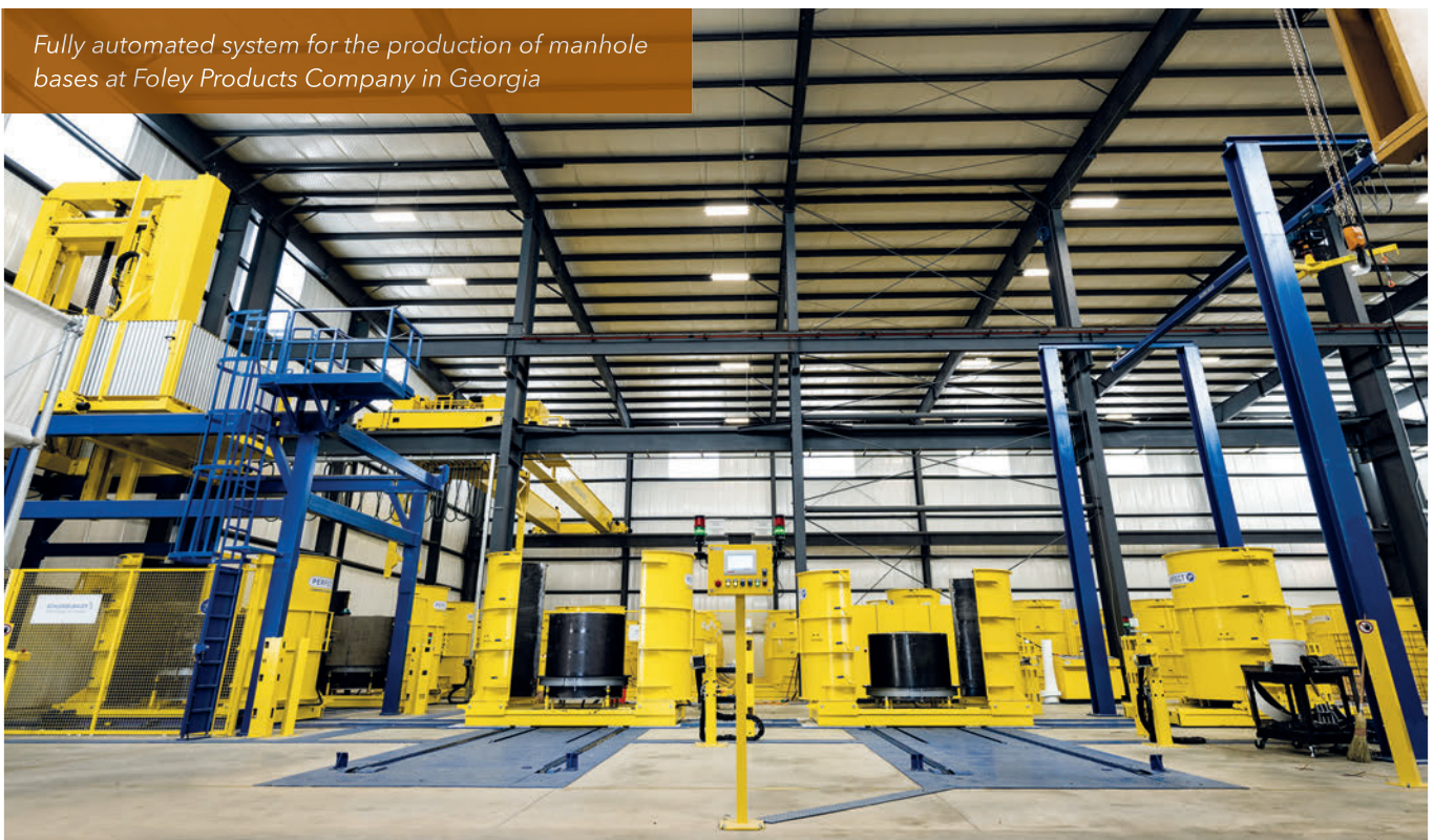
Fully automated system for the production of manhole bases at Foley Products Company in Georgia

As a successful company, Foley's owners and plant managers have always placed the highest capacity and product quality demands on their precast concrete products production systems. It's this attitude that brought Foley Products Com-