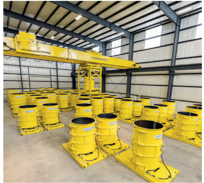
Reduction of costs and risks through automated mould management in the hardening area

pany and Schlüsselbauer Technology, an Austrian provider, together many years ago in an initial investment project. This project involved the installation of Schlüsselbauer’s Magic 1500, a dry-cast manhole production system with fully automatic product and pallet handling. Since its installation, the Magic 1500 has manufactured over one million manhole risers, cones, and cover plates, leaving Foley extremely satisfied with their first collaboration with Schlüsselbauer. In the company’s latest project to modernize their manhole base production, Foley was yet again ambitious from the start. It wasn’t just the complex production of manhole bases with berms or channels that was to be overhauled; in blank production, they also wanted to improve processes and completely replace individual work steps with new technologies. Foley had two criteria that had to be fulfilled by a suitable provider for their new production system. First, they wanted a technology partner who had substantial experience with high-volume wet-cast systems which require minimal manpower; and second, the perfect partner had to be able to offer a system for the manufacturing of custom-made channels with a profitable balance of raw materials.