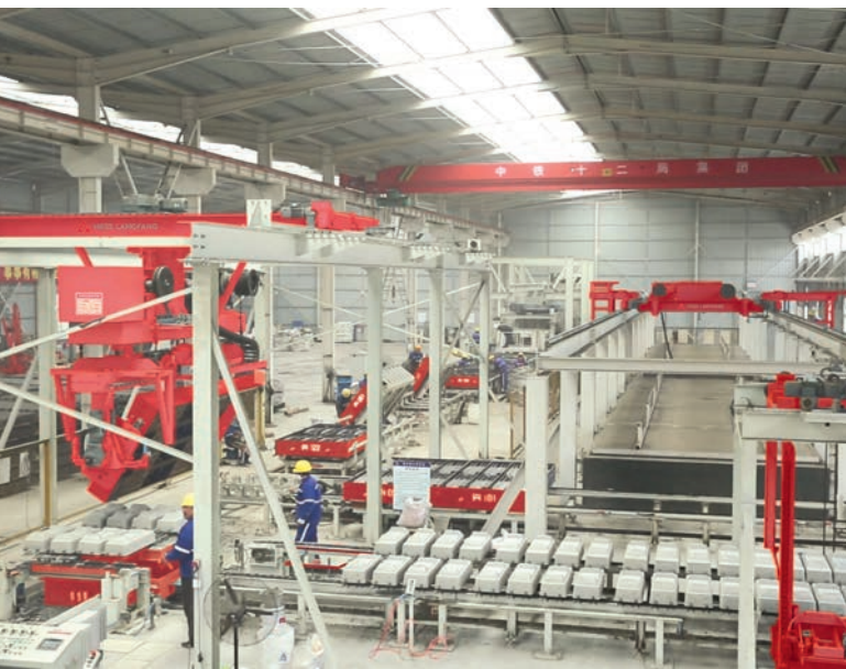
Figure 2: Modern carousel line system – First project of China Railway 12 th Bureau, Lanxin Daban City

A key aspect of Hess Langfang in designing a sleeper production plant is the flexibility of the plant from the process to the products according to individual project requirements. Generally, a railway sleeper production plant will typically be composed of the following process steps: