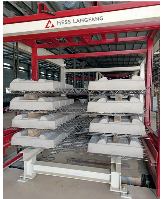
Figure 6: Automated sleepers stacking device

equipment such as a mold turning device and a pneumatically operated demolding table are applied (figure 5).