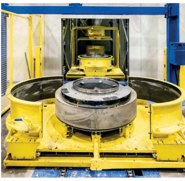
One mould after another is removed from the high-bay racks.

For more than 20 years, Schlüsselbauer's engineers have pursued ways of implementing production systems that enable increasingly efficient production of precast concrete products using self-compacting concrete (SCC). Right from the very beginning, their focus has been on realizing concrete products of the highest possible quality. When progress in concrete technology is combined with Schlüsselbauer's many years of work and research in this field, the result is a growing number of components made from SCC (wetcast process) in western markets in 2021, with an accompanying departure from conventional drycast production. The use of SCC to produce concrete products has helped the concrete industry transform into a highly innovative sector that is a world away from the staid, old-fashioned trade that many people still imagine it to be. What's more, French industrialists are enthusiastically spearheading these developments.