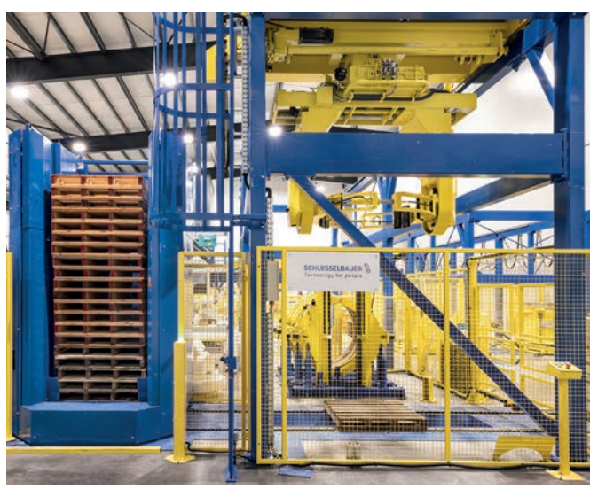
The pallets are fed into the system in stacks

Libaud has been actively following market developments in recent years and now sees an opportunity to advance them even further. The company's dynamic growth is underpinned by its pride in its family background (the third generation of the family is now at the helm) and its 300 employees, who together achieve a annual turnover of 80 million euros. 2020 was a pivotal year for the company, with the acquisition of two former competitors in Toulouse and Le Mans. Adding these to its original production plants (Luçon and Ste Florence in the Vendée, Chenon in Charente) gives Libaud excellent coverage of western France, with five production sites and 24 branches spread across the Pays de la Loire, Nouvelle Aquitaine and Occitanie regions. Making this move in a challenging and dynamic market required new, cutting-edge