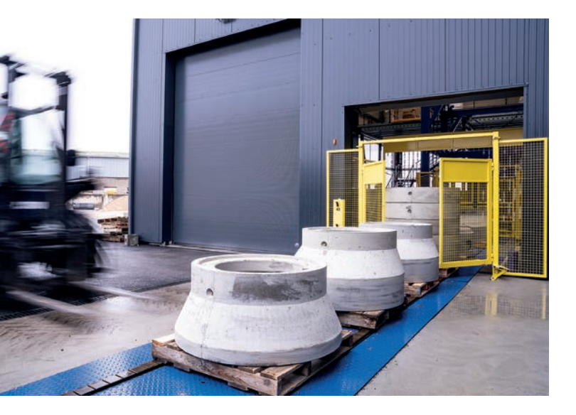
The demoulded manhole parts leave the building on pallets ready for loading.