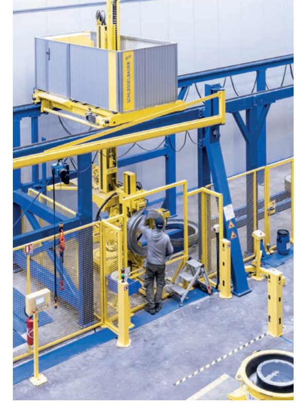
Top pallets are automatically transported to an ergonomically optimized workplace for cleaning.

it comes to the quantity and diameter of pipe connections, angulations, inclination of the inlets and outlets, pipe branching, and much more. And of course, this all comes with the additional benefit of consistent product quality with regard to the flow characteristics and surface finish of the concrete.