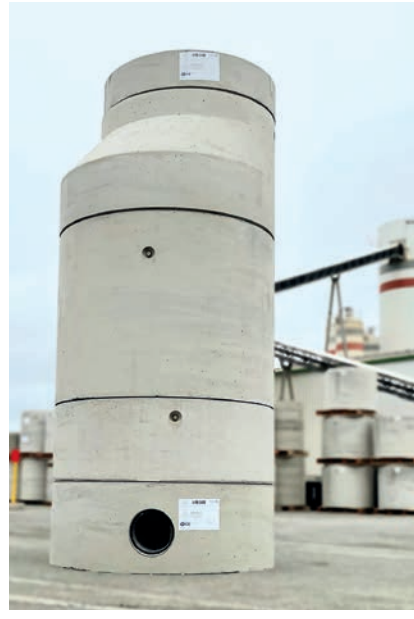
Manhole risers produced in the wetcast process