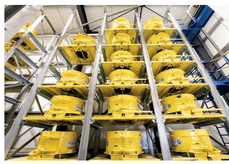
An efficient way of storing the mould-hardened product and making use of the energy released by the concrete during hardening.