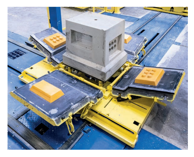
Precisely manufactured and highly functional casting moulds for high-quality components.