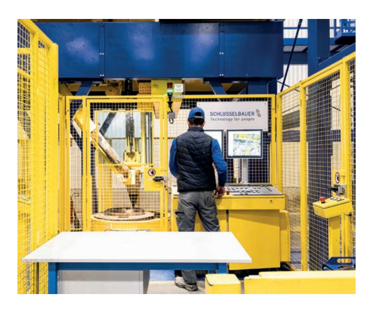
The operator monitors the filling process and the storage and retrieval of moulds in the high-bay racks from a central operating panel.

Once this first decision had been made, and since Libaud wanted to build a completely new hall in order to optimize the working conditions, the next step was to plan out the