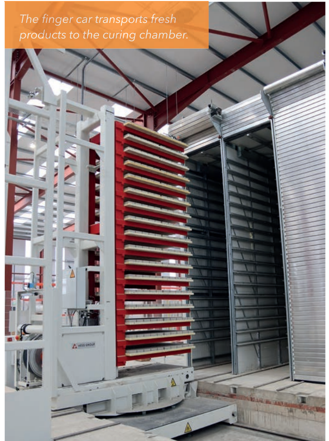
The finger car transports fresh products to the curing chamber.