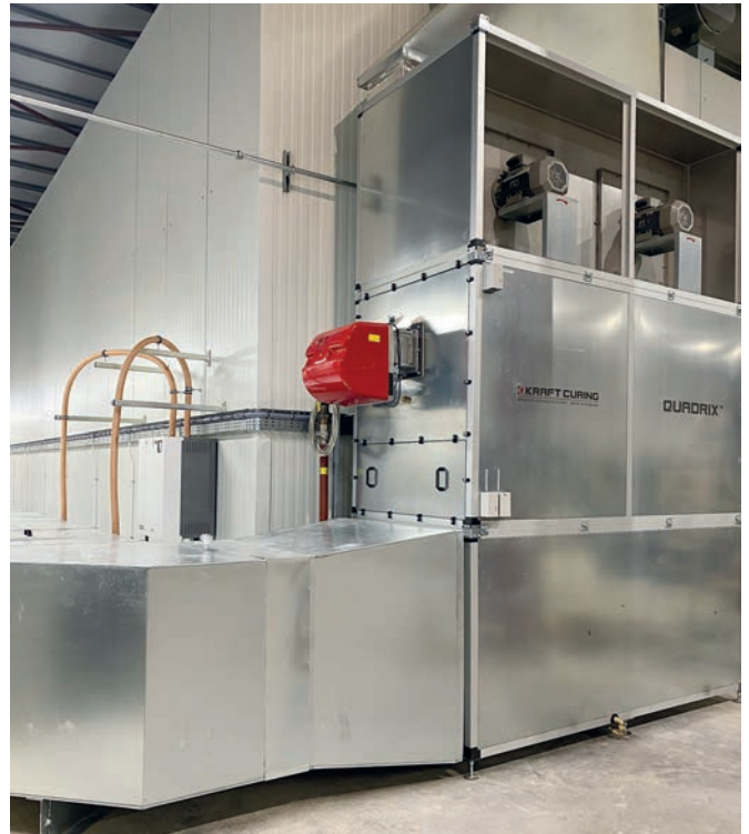
The ideal climate in the individual chambers is ensured by the latest-generation Quadrix Ultra concrete curing system from manufacturer Kraft Curing Systems.

The ideal climate in the individual chambers is ensured by the latest-generation Quadrix Ultra concrete curing system from manufacturer Kraft Curing Systems. The system enables the temperature in the individual chamber to be raised to 45 °C and the humidity to 95 %. The formation of condensate or mist is thus prevented.