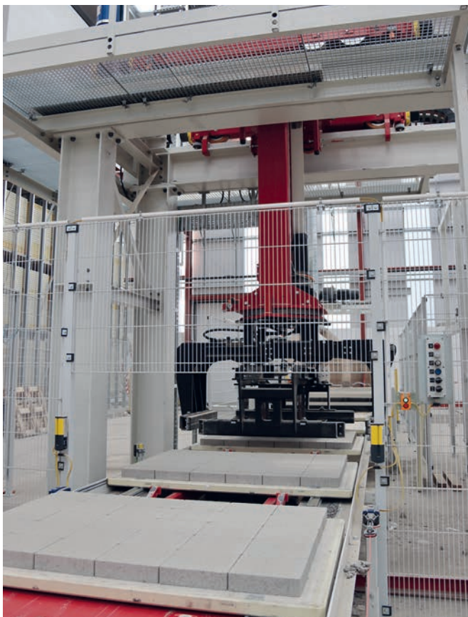
One of three Hess cubers Servo 900 belonging to the new circulation system in production hall IV at the Tobermore site

Another advantage of the Lachenmeier machine is a patented technology that ensures that the stretch hood is applied in sufficient thickness even on the sharp edges of the packs and does not tear.