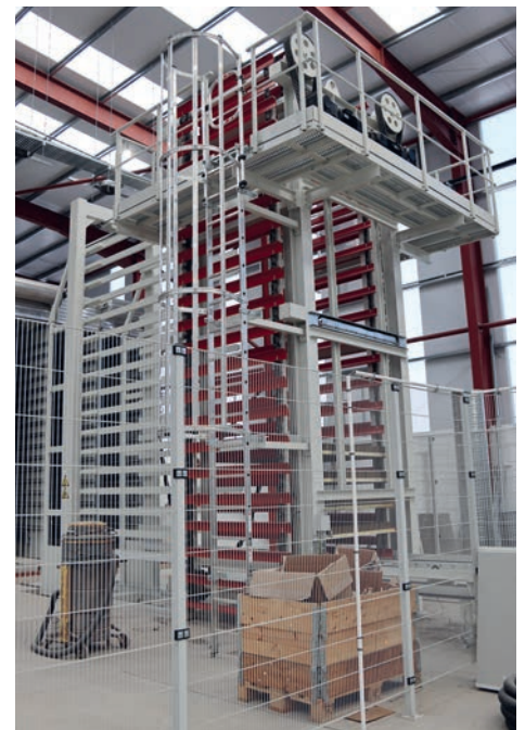
There is one buffer car behind the elevator and one in front of the lowerator on the wet side and on the dry side respectively, each with 17 tiers (double discharge system) and 14 tons of capacity.