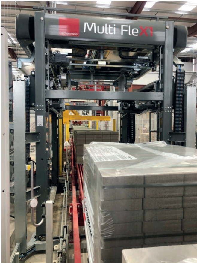
After strapping, a Multi FleX1 stretch hooding machine from Lachenmeier covers the stabilized packs with a stretch hood.