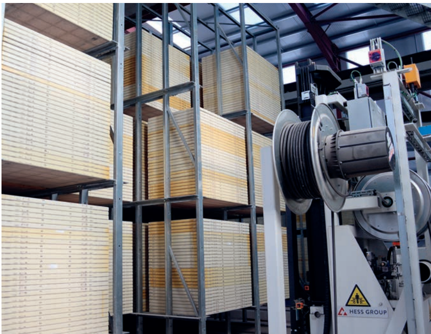
Buffer with 3,240 production pallets at the beginning of the wet side.

„We run the plant in two 12-hour shifts, i.e. uninterrupted 24 hours a day. This gives us an annual production of around 1 million m 2 of paving,” says Trevor Smyth, production works manager at Tobermore, who is responsible for the project.