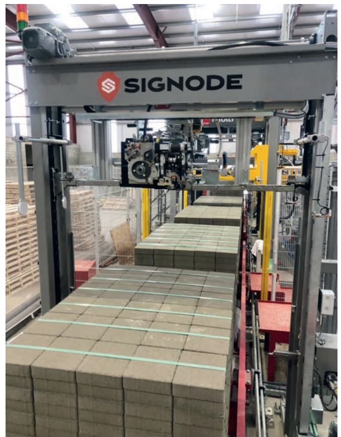
Strapping is performed on a TSM-H6500 machine with Jumbo Reel Dispenser and HSM-H3000 head from manufacturer Signode.