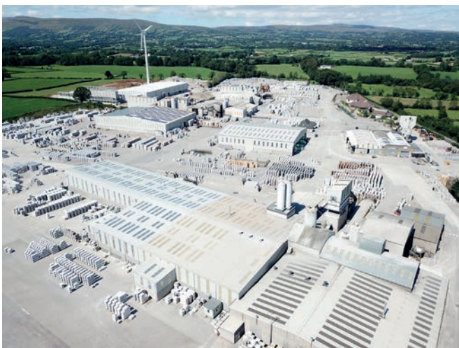
The plant site in Tobermore - the new production hall IV can be seen in the background below the wind turbine.

According to Tobermore's specifications, the entire fourth circulation system is designed for high performance and continuous operation without interruptions: This is ensured by the Hess RH 1500-4 MVA concrete block machine, a buffering system at the beginning of the wet side with 3,240 production pallets, one buffer car behind the elevator and one in front of the lowerator on the wet side and on the dry side respectively, each with 17 tiers (double discharge system) and 14 tons of capacity, and a curing chamber with 15 individual chambers of 510 pallets each and a total capacity of 7,650 production pallets.