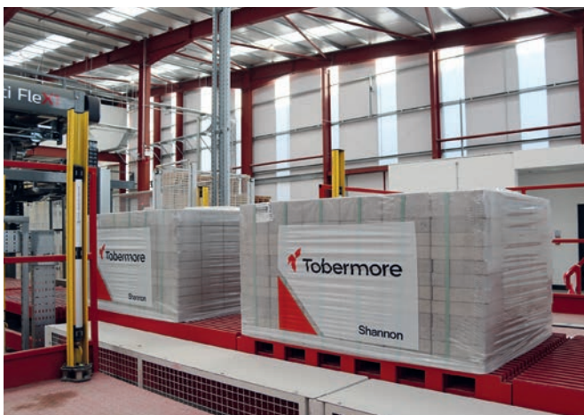
Paver packs strapped, stretch hooded, printed with Tobermore logo, ready for transportation