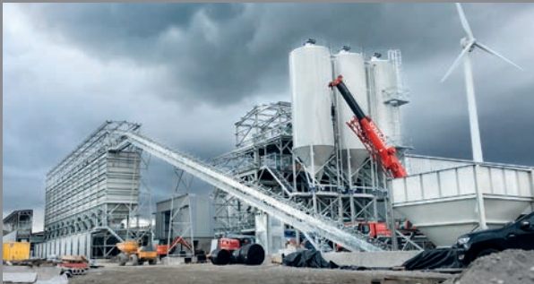
Rapid International's batching and mixing plant in the assembly phase: on the right the mixing tower with the three 150-ton cement silos, on the left the units with a total of 29 storage bins for aggregates and sand.

The new Rapid batching plant is comprised of a 20m 3 dump hopper to receive aggregates and sand and an inclined 750 mm wide conveyor to convey materials to the shuttle conveyor. The shuttle conveyor subsequently distributes aggregates to each of the aggregate bins. Aggregates and sands are stored in a series of 29 storage bins, of varying sizes, from 4.7 to 100 m 3 . This represents the greatest number of bins Rapid has ever installed on a plant.