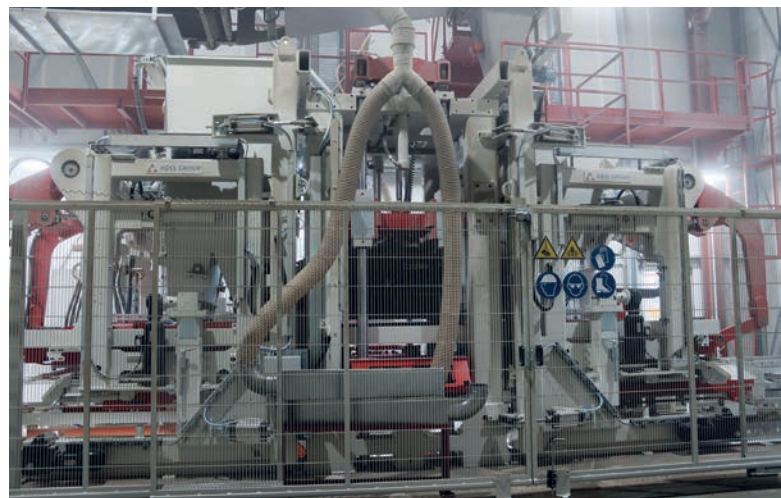
The Hess RH 1500-4 MVA concrete block machine is the heart of the production plant.