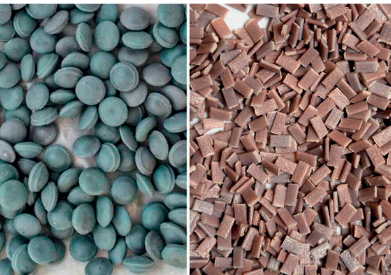
Only a small selection of the granules available. Lentil shape or flakes from recycled plastics

In most cases, larger products require less granules, as sufficient space is available due to relevant support areas so that the distances between the granules can be enlarged. More granules, on the other hand, often have to be scattered on smaller products because there is less surface area available. Here, too, the exception proves the rule and individual cases have to be examined. Concrete block manufacturers stack and transport their products in many different ways. It must therefore be ensured that the bottom layer of granules can also withstand the loading from the entire stack. In addition, the stack must not be subjected to too much movement during transport; consideration must also be given to differing storage times. Once all these criteria have been thought through and the required quantity has been determined, a granule dispenser must also be able to guarantee appro-