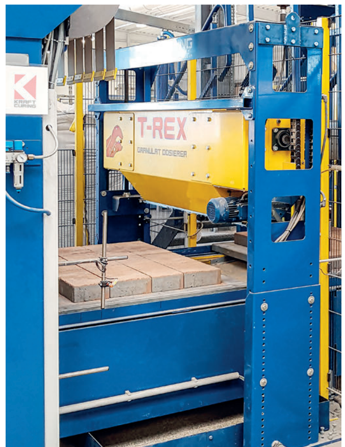
Light barriers detect the products and start the dosing process