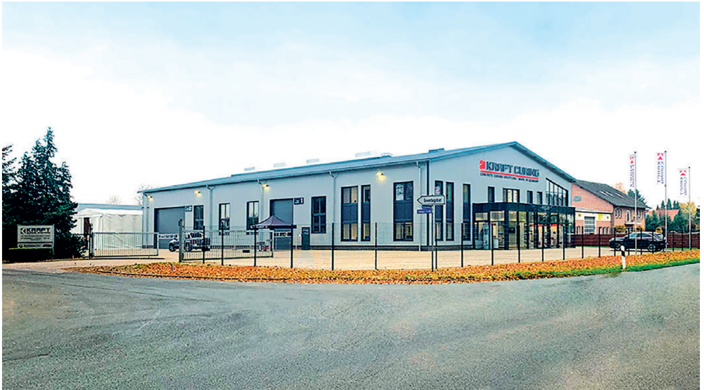
New Kraft Curing Systems GmbH production hall and office building

requirements they need. Much of it continues to be utilised in the packing industry, and thus for consumer goods in private households, and is difficult for the concrete industry to attain due to the prices demanded. Whether and how this will change in the next few years is something no one can really say at the moment. Recycled plastics are a possibility as an interim solution for such products. These are already available in a wide range of varieties and shapes. Some manufacturers in Germany are also employing gravel, among other things, which exhibits great load-bearing properties due to its higher density, but can cause difficulties when transporting the pallets.