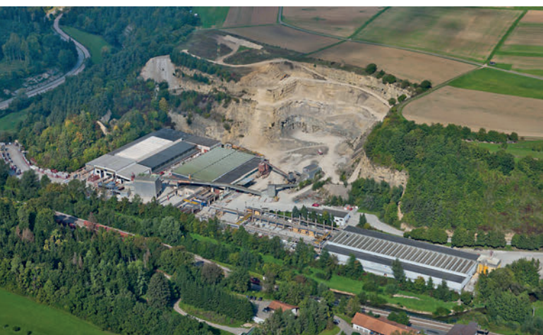
Schwörer Bausysteme GmbH in Haigerloch-Stetten

“When the cellar is well insulated from the outside as well, everyone thinks that the cellar is heated,” says works manager