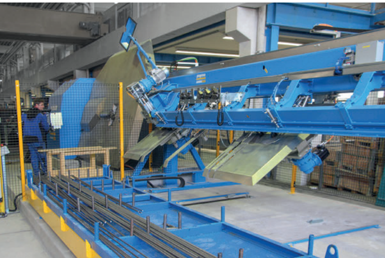
In operation at Schwörer Bausysteme GmbH since the beginning of 2021: the Pluristar - a multifunctional machine for all steps in steel processing from the coil.