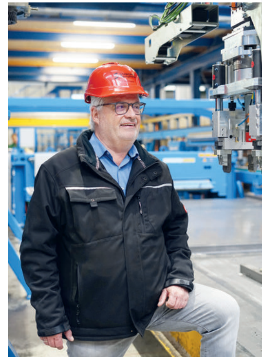
The individualised shuttering robot at Schwörer places the shuttering, magnets and assembly sleeves precisely on the pallet.