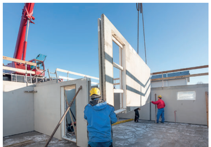
Schwörer cellar assembly – the basis of Schwörer prefabricated houses.