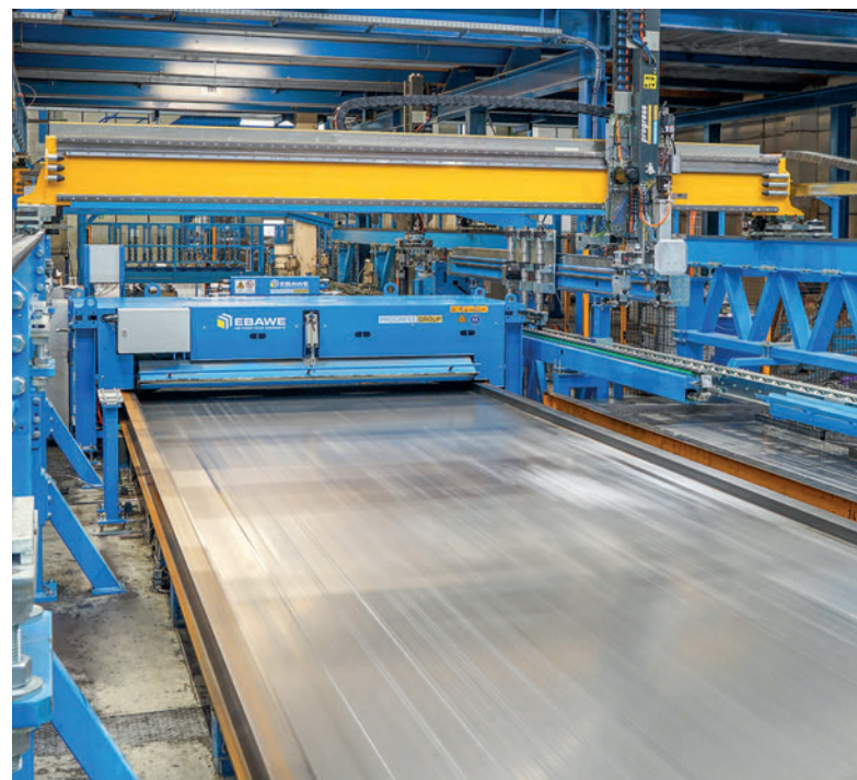
The Ebawe pallet cleaner is also part of the new shuttering robot.

faster and more automated, and the solution with setting the magnets for mounting sleeves as well as electrical boxes is a great step towards the future, but it's mainly about making the employees' work easier."