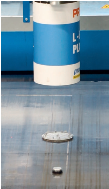
The device specially developed for Schwörer places magnets and mineral fibre boards for electrical installations.