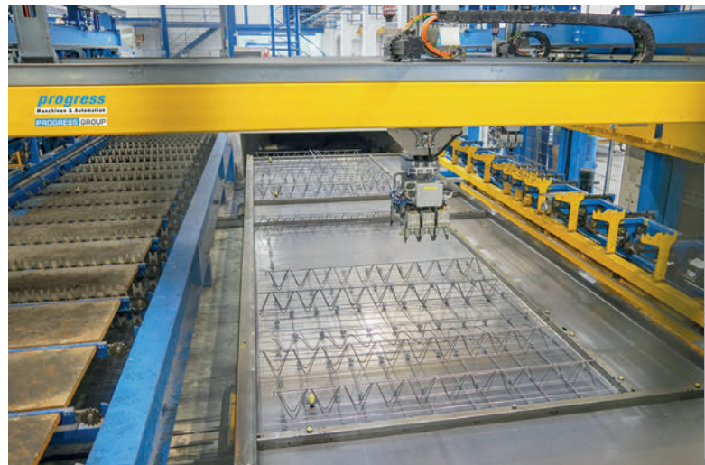
The Wire Center installs transverse reinforcement with and without spacers as well as longitudinal reinforcement and lattice girders according to CAD specifications.

Thanks to the positive business outlook, Schwörer has also planned further modernization steps for the coming years. For the complete renewal of the circulation system, an automatic concrete spreader is still to be purchased. "Now we are at 80 per cent - we will manage the rest," says Schneider. ■