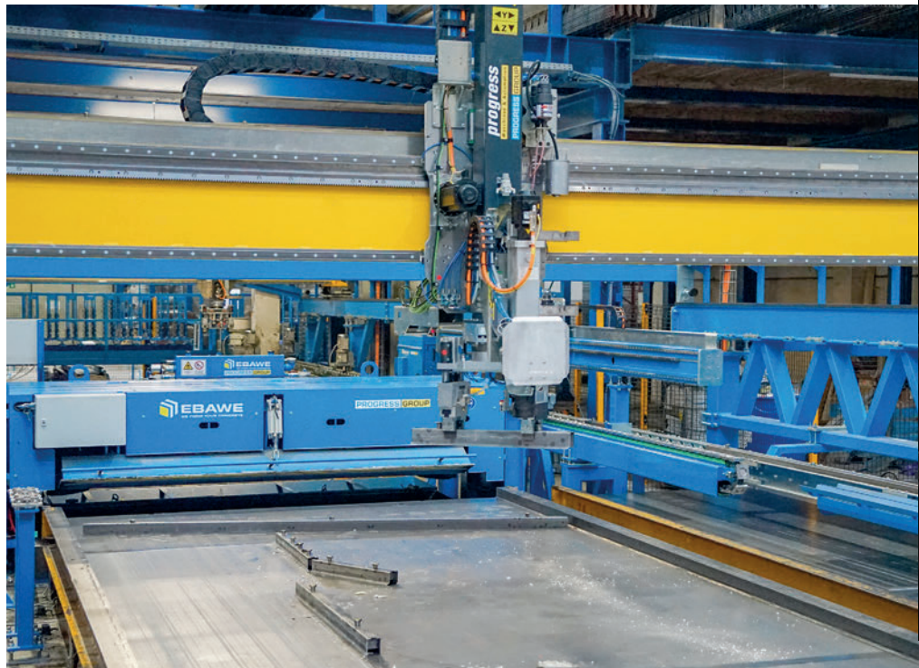
The demoulding robot removes the formwork fully automatically before the pallet is forwarded to the cleaning device.

combination enables flexible production of stirrups, straight bars and bars with large bends and can thus cover the entire rebar processing from coil. The main customer is the parent company, which is supplied with the reinforcement completely cut to size for the Schwörer cellar assembly.