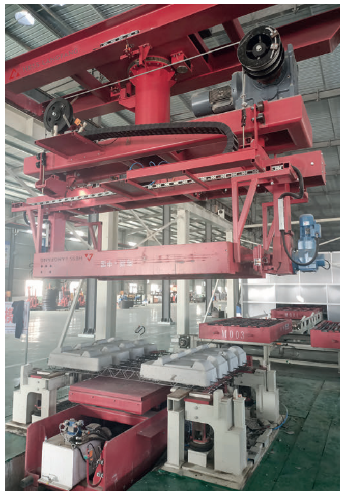
Figure 5: De-molding system with mold turning device and demolding table

separated again at the demolding station. The demolding requires to turn the mold by 180 degrees and releasing needs to be enhanced by an up and down movement. Special equipment such as a mold turning device and a pneumatically operated demolding table are applied (figure 5).