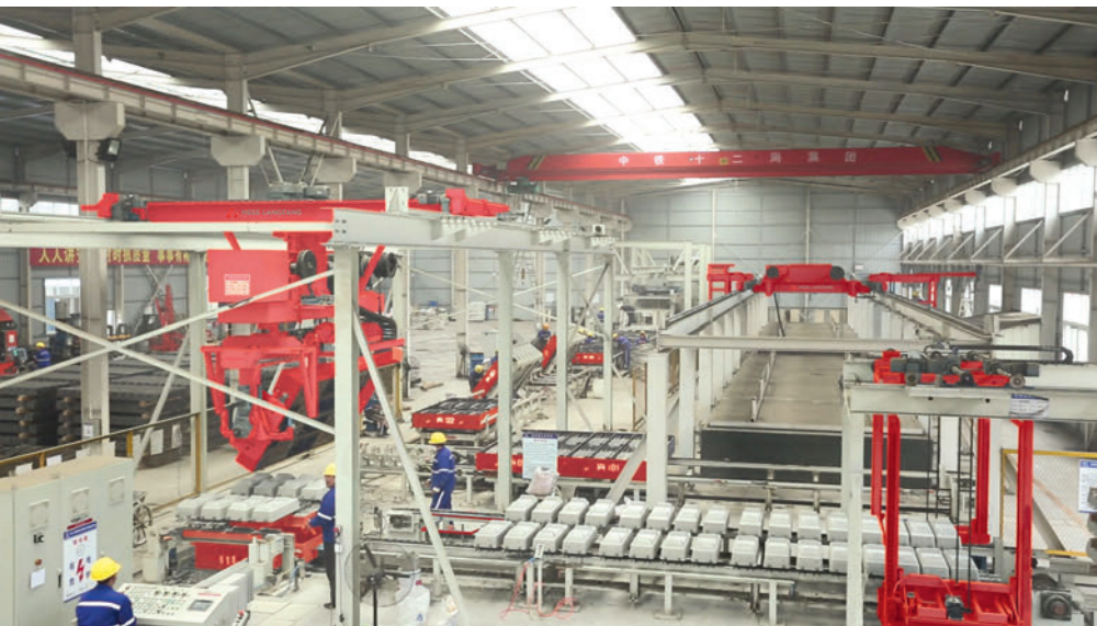
Figure 2: Modern carousel line system – First project of China Railway 12 th Bureau, Lanxin Daban City

A key aspect of Hess Langfang in designing a sleeper production plant is the flexibility of the plant from the process to the products according to individual project requirements. Generally, a railway sleeper production plant will typically be composed of the following process steps: