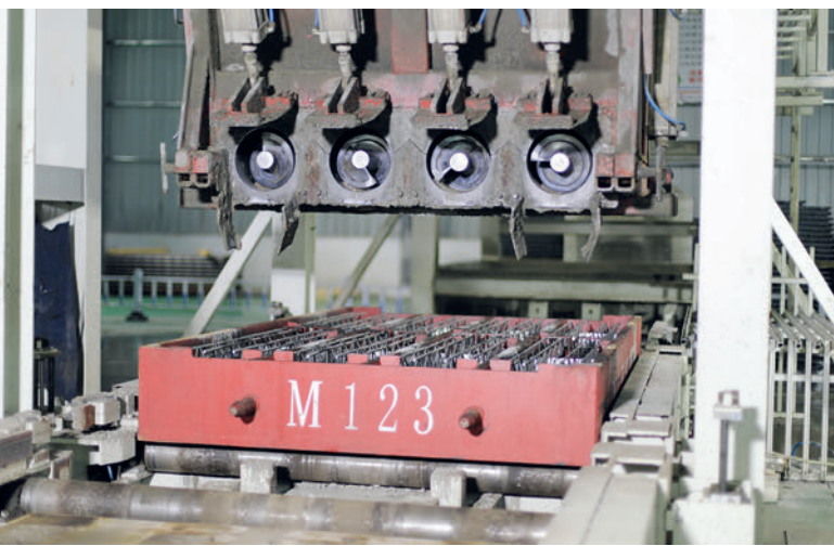
Figure 3: Automated casting and vibration station

Additional process steps, not necessarily being part of the main production line, are the preparation of the embedded parts like reinforcement steel, the steam generation required for the curing process, compressed air generation or a secondary natural curing of the sleepers in storage.