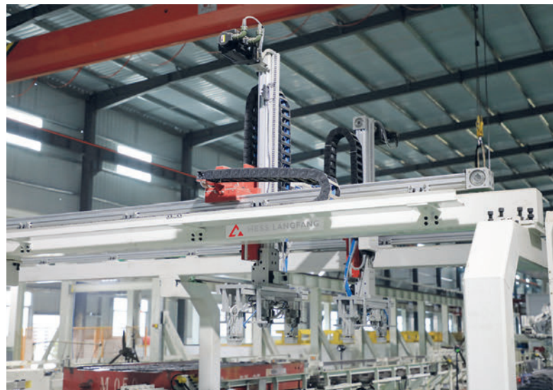
Figure 8: Automated railway sleeper steel reinforcement installation station

degree of automation etc. High demands on the sleepers such as for high-speed application or heavy freight loads require high and uniform product quality with tight tolerances which also leads to a limited size of the single molds with a limited number of sleepers per mold. With the limited weight of such molds and further supported by automated process steps, also impacts of the molds with the process equipment are minimized, avoiding potential damages being more likely the larger and heavier the molds and the more manual labor is required. With high lifting accuracy, e.g. contact with the inner wall of the curing pits is avoided allowing for less reinforcement, no guide bars and therefore reduced investment costs for the pits.