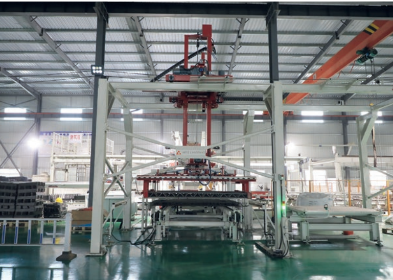
Figure 11: Palletizer system with accurate position sensors for efficient steel girder handling