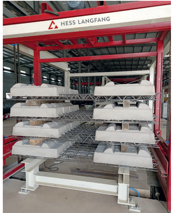
Figure 6: Automated sleepers stacking device

After this 'divorce' the mold is turned again and conveyed to cleaning and preparation for the next casting process. This preparation consists of the spraying of a mold release agent and the installation of all embedded parts like reinforcement steel or screw anchors. This process steps are typically carried manually.