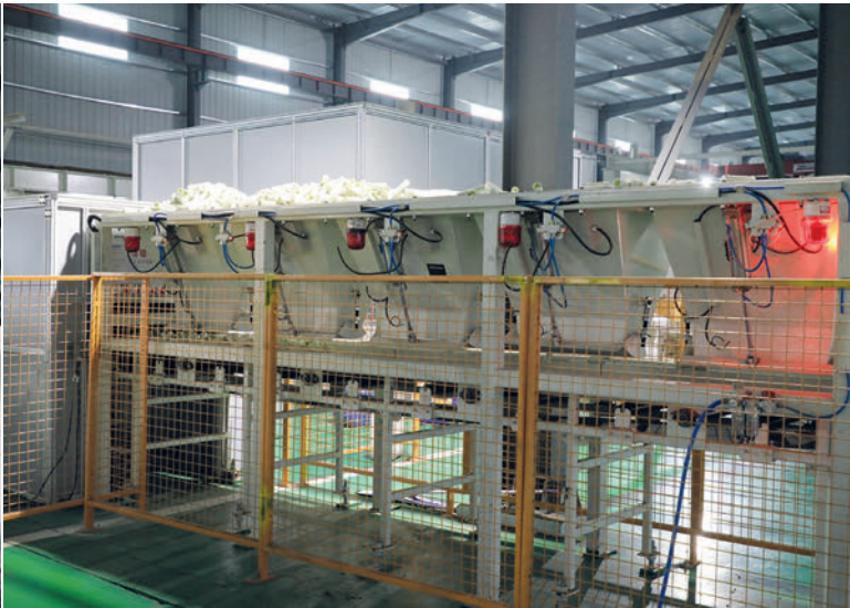
Figure 10: Feeding system for screw anchors to be installed automatically by robots