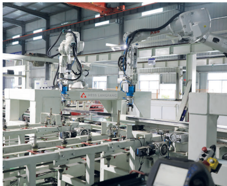
Figure 9: Robots screwing-in spring elements into the railway sleeper molds - fully automated

Already from the very beginning when China's high-speed railway construction boom started, Hess Langfang took a leading position in the development of China's railway sleeper production lines. Based on original production lines, Hess Langfang has newly developed various tailor-made innovations to achieve this unique degree of automation. These further developments include (figures 7 - 13):