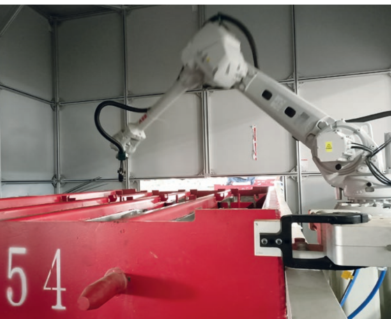
Figure 13: Mold spraying of release agent by robots