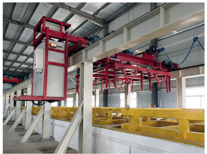
Figure 4: Mold stacking device for handling of molds and curing pit covers

The sleepers will then be treated in the curing pits. The concrete curing requires a quality specific temperature treatment with a temperature increase by steam injection in the covered pits. The temperature increase, the time and temperature on a constant temperature level and the following temperature reduction shall be precisely controlled for quality assurance. After the curing process the sleepers and the molds will be