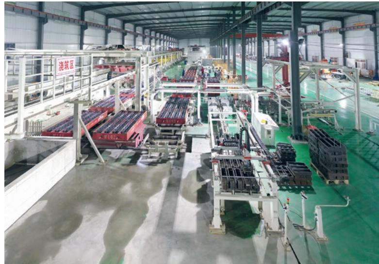
Figure 12: Fully automated installation of embedded parts / steel reinforcement

Specialty: For this project Hess Langfang had to design & to produce various complex molds which can be applied to the same production line in just one system. Consequently, the customer can produce different types of concrete elements besides the railway sleepers such as water channels, cover plates, special concrete blocks or barriers with just one production plant.