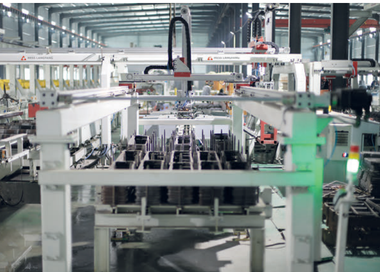
Figure 7: Automated railway sleeper steel reinforcement installation station