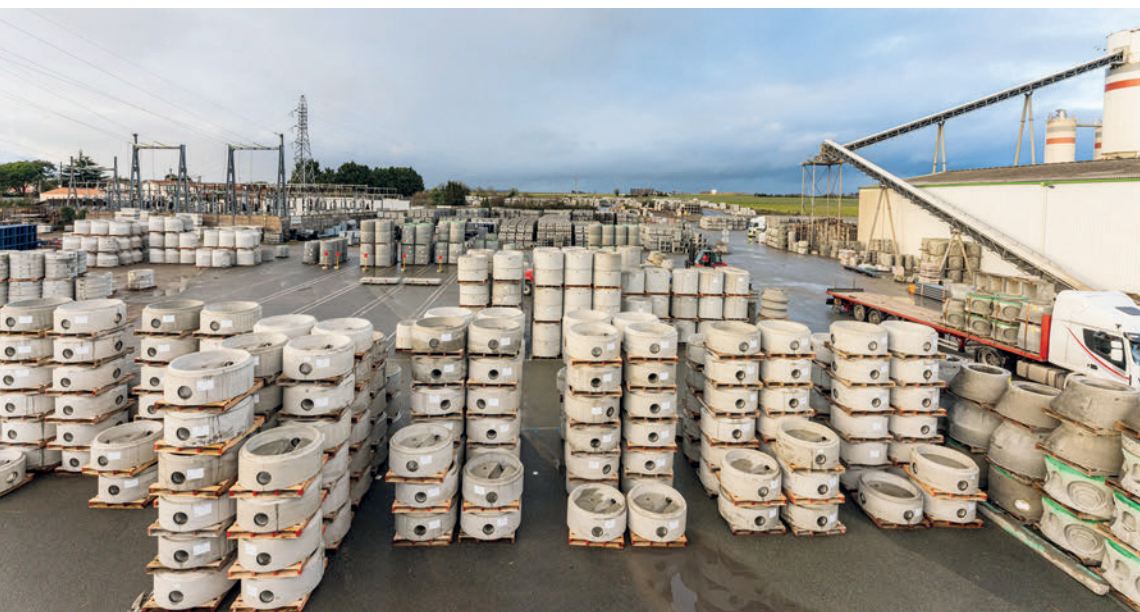
The external storage area in Luçon

This step demonstrates Libaud's willingness to invest, grow, and build up sustainable production activities with high-quality products, all in ways that are appropriate for today's market conditions. Meanwhile, the new production site for manhole components, which was supplied and commissioned by the Austrian company Schlüsselbauer Technology, has brought welcomed improvements to working conditions at the Luçon plant. Now employees can enjoy a bright, well-designed industrial building and highly automated systems with just a few simple manual tasks to take care of.