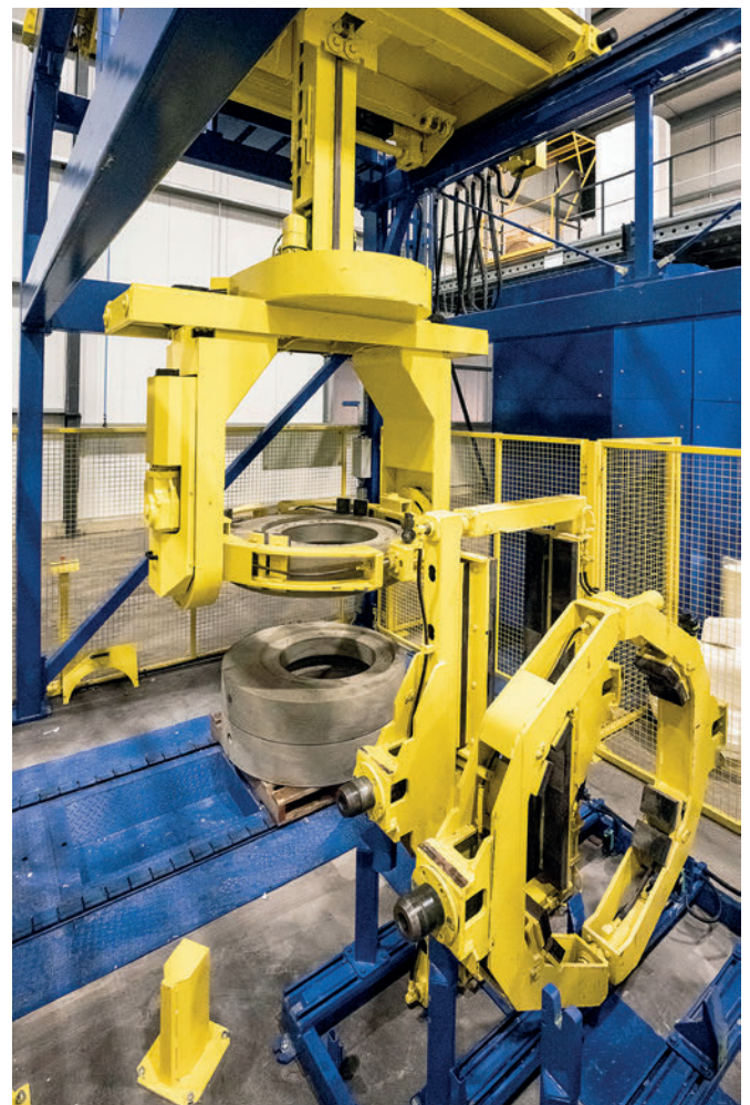
The automatic product manipulator gently removes the products from the moulds.