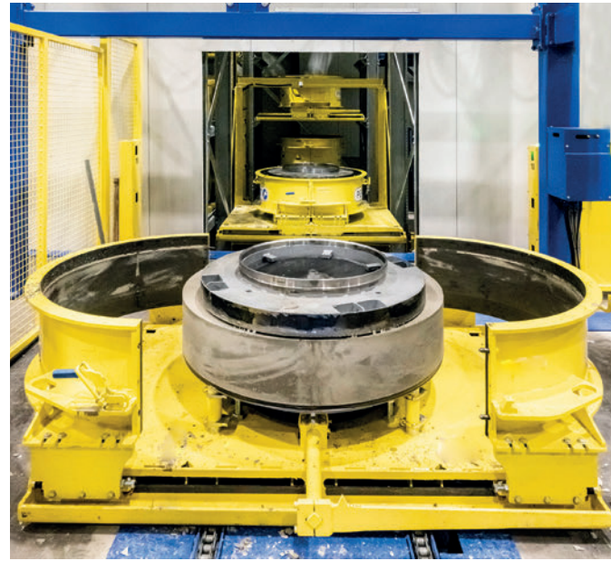
One mould after another is removed from the high-bay racks.

For more than 20 years, Schlüsselbauer's engineers have pursued ways of implementing production systems that enable increasingly efficient production of precast concrete products using self-compacting concrete (SCC). Right from the very beginning, their focus has been on realizing concrete products of the highest possible quality. When progress in concrete technology is combined with Schlüsselbauer's many years of work and research in this field, the result is a growing number of components made from SCC (wetcast process) in western markets in 2021, with an accompanying departure from conventional drycast production. The use of SCC to produce concrete products has helped the concrete industry transform into a highly innovative sector that is a world away from the staid, old-fashioned trade that many people still imagine it to be. What's more, French industrialists are enthusiastically spearheading these developments.