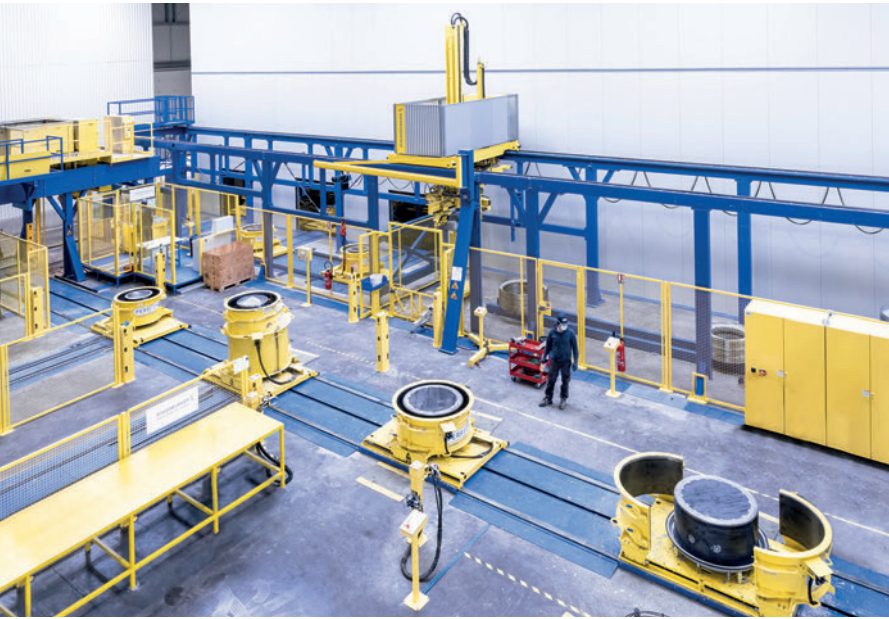
Industrial manufacturing: no matter what preparation work is needed, every mould on the production line is transported to the filling zone like clockwork.