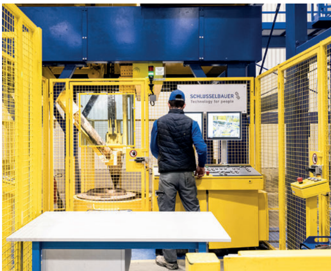
The operator monitors the filling process and the storage and retrieval of moulds in the high-bay racks from a central operating panel.

Once this first decision had been made, and since Libaud wanted to build a completely new hall in order to optimize the working conditions, the next step was to plan out the