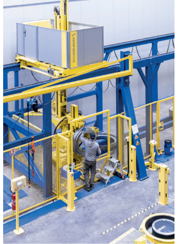
Top pallets are automatically transported to an ergonomically optimized workplace for cleaning.

it comes to the quantity and diameter of pipe connections, angulations, inclination of the inlets and outlets, pipe branching, and much more. And of course, this all comes with the additional benefit of consistent product quality with regard to the flow characteristics and surface finish of the concrete.