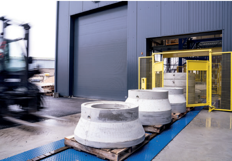
The demoulded manhole parts leave the building on pallets ready for loading.