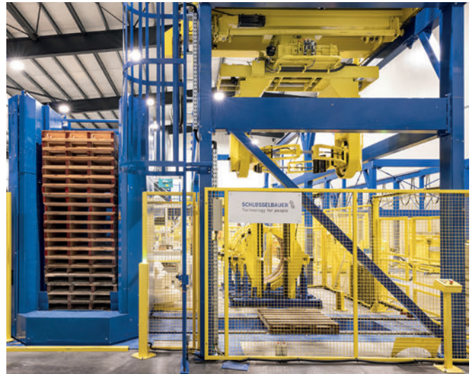
The pallets are fed into the system in stacks

Libaud has been actively following market developments in recent years and now sees an opportunity to advance them even further. The company's dynamic growth is underpinned by its pride in its family background (the third generation of the family is now at the helm) and its 300 employees, who together achieve a annual turnover of 80 million euros. 2020 was a pivotal year for the company, with the acquisition of two former competitors in Toulouse and Le Mans. Adding these to its original production plants (Luçon and Ste Florence in the Vendée, Chenon in Charente) gives Libaud excellent coverage of western France, with five production sites and 24 branches spread across the Pays de la Loire, Nouvelle Aquitaine and Occitanie regions. Making this move in a challenging and dynamic market required new, cutting-edge