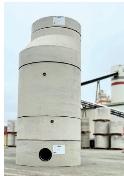
Manhole risers produced in the wetcast process