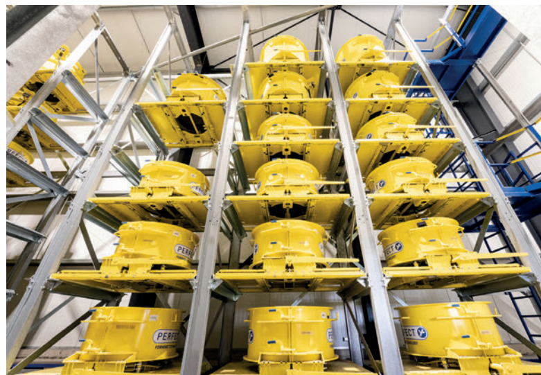
An efficient way of storing the mould-hardened product and making use of the energy released by the concrete during hardening.