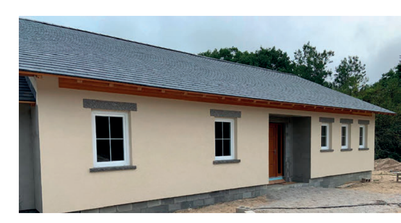
Comfort Block Model House

The manufacturing process of the Comfort Block guarantees high dimensional stability of the stones, which can be installed precisely and easily. All that is needed is concrete adhesive, which reduces the amount of dirt accumulation during the construction phase and increases the speed of construction. After setting, the blocks are plastered inside and outside. Chris Genest emphasises that all materials used