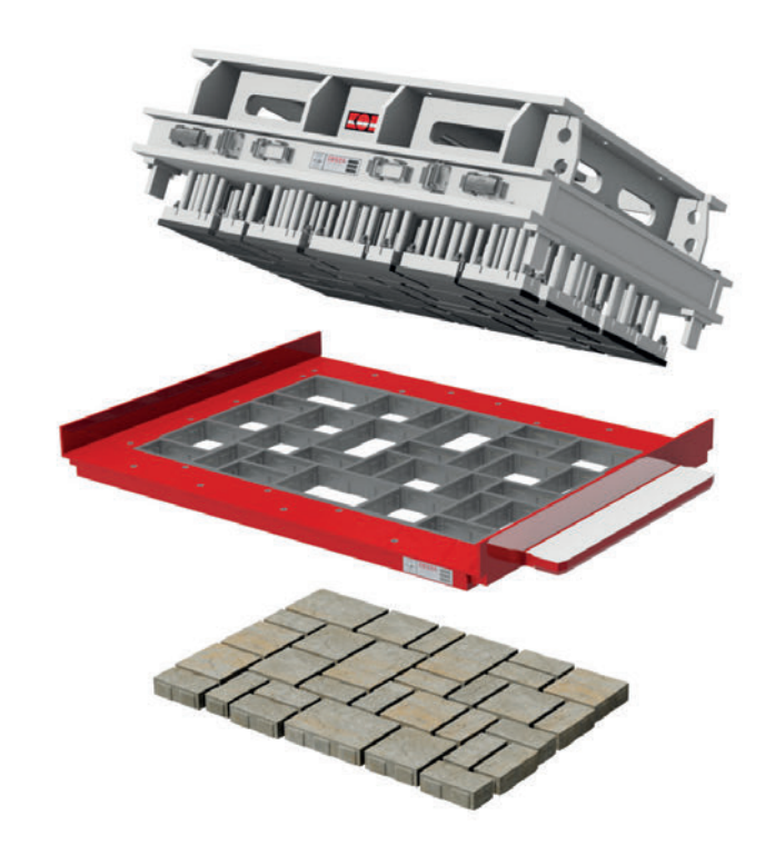
Kobra concrete block mold Basicline 2<sup>™</sup> for Sebago Stone<sup>™</sup>

It is based on an existing product and consists of a wild pattern in which individual stones are systematically interchangeable to avoid continuous joints during laying and to generate a varied view. The embossed surface in a slate look is available in different colour variations. The stone is characterised by high stability and weather resistance due to the aggregates selected for the core concrete. In order to achieve a homogeneous surface and a natural colour gradient, Genest uses Kobra concrete block molds with features adapted to the product to increase the stone quality.