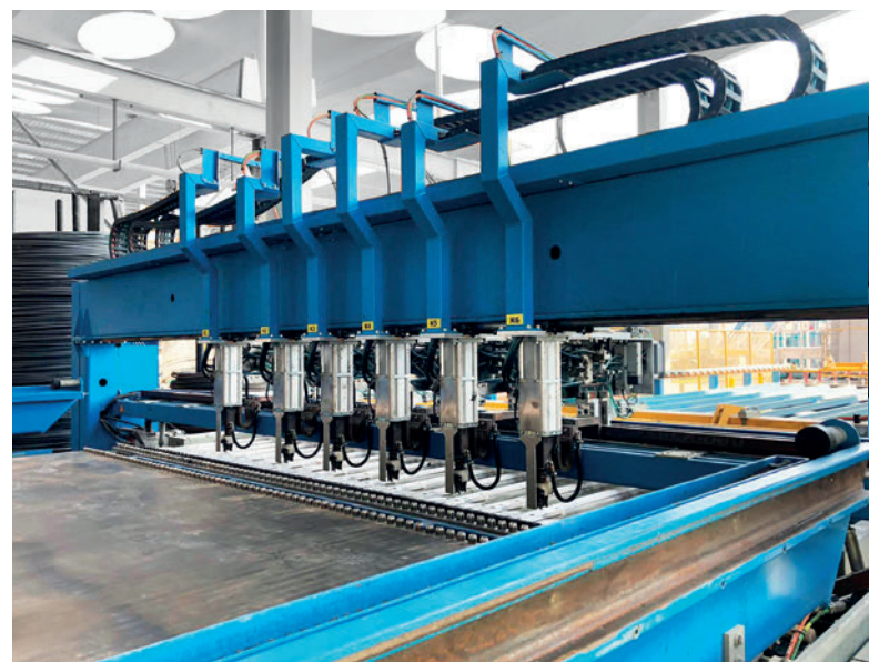
Reinforcement meshes are produced on the M-System BlueMesh® mesh welding machine with an exact fit and just-in-time.