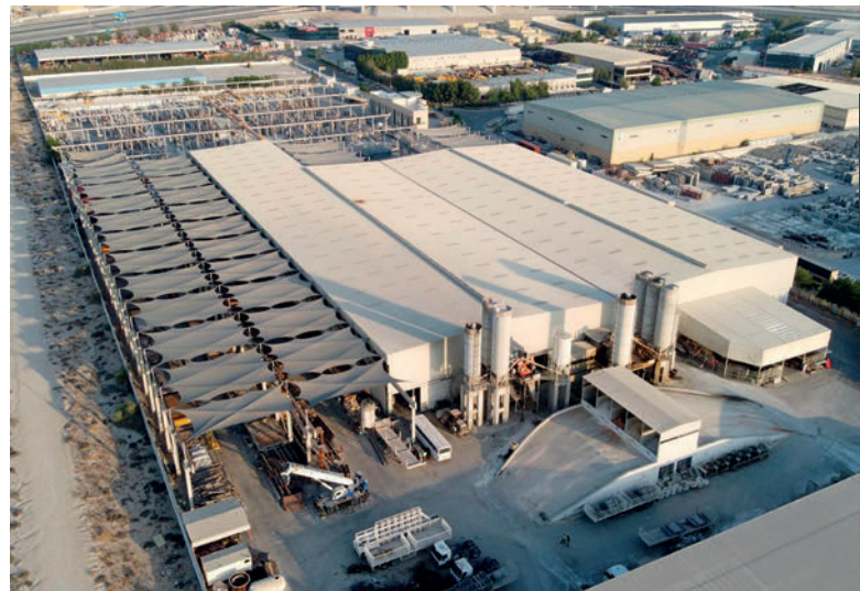
View of Hard Precast's company site in Dubai and the stored precast concrete parts.

The Progress Group is known for its high-quality products and customer satisfaction. They were able to plan the manufacture, delivery and installation of the required machines within a very short time. In addition to the mesh welding machine, an automatic stirrup bending machine from the EBA S line was commissioned. This robust and powerful machine is used for the manufacture of reinforcing steel stirrups in various shapes, which are used as spacers between wall and floor