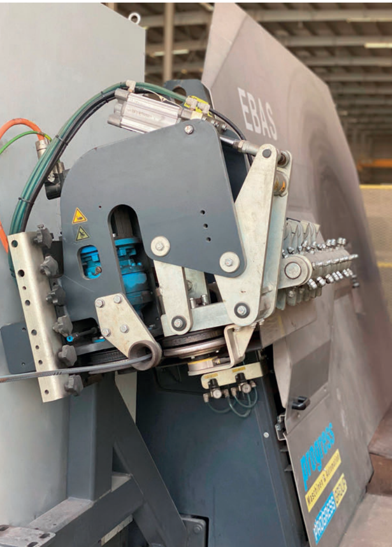
The EBA S 16 automatic stirrup bending machine from Progress Maschinen & Automation is successfully used for processing reinforcing steel.

of energy, space requirements and costs. It is also distinguished by a special feature - the production of meshes with a special size of 8 x 4 m. The meshes are produced just-in-time with a maximum mesh width of 4 m and fit precisely to the specified precast element moulds, including any openings. The mesh welding machine has been designed accordingly to add additional functions in the future, such as 3D meshes and other diameters.