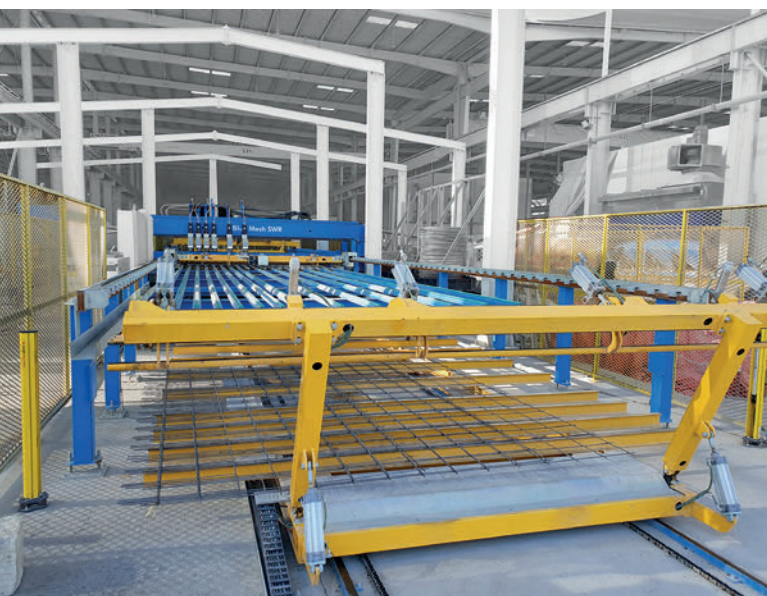
The newly developed system is designed for maximum flexibility in mesh production.

The new machine is convincing not only because of its high technological level, but also because of its economy in terms